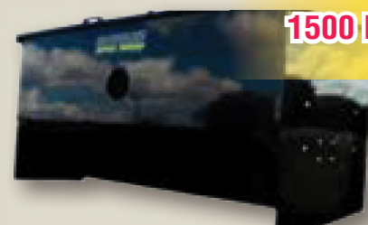
2024 Crownline Feeder Available In 3 Sizes 1,000 Lb., 1,500 Lb., 2,000 Lb.