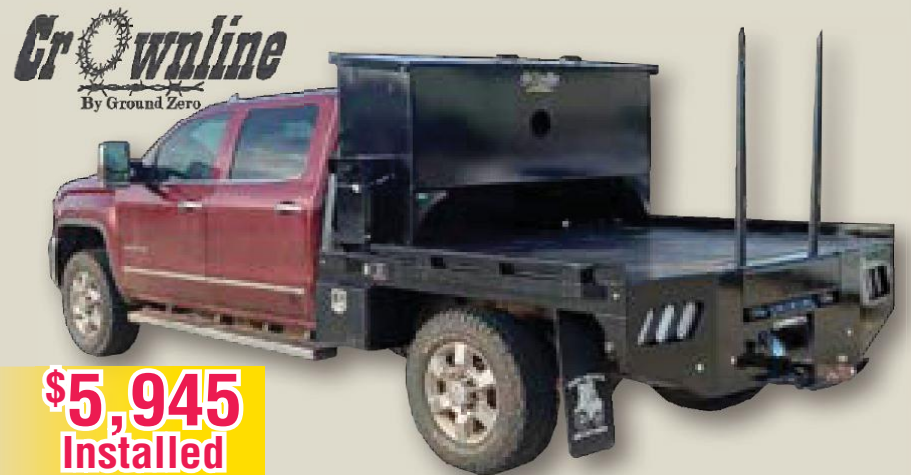
2024 Crownline 8' Spike Bed