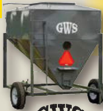
GWS Portable Feed Bin