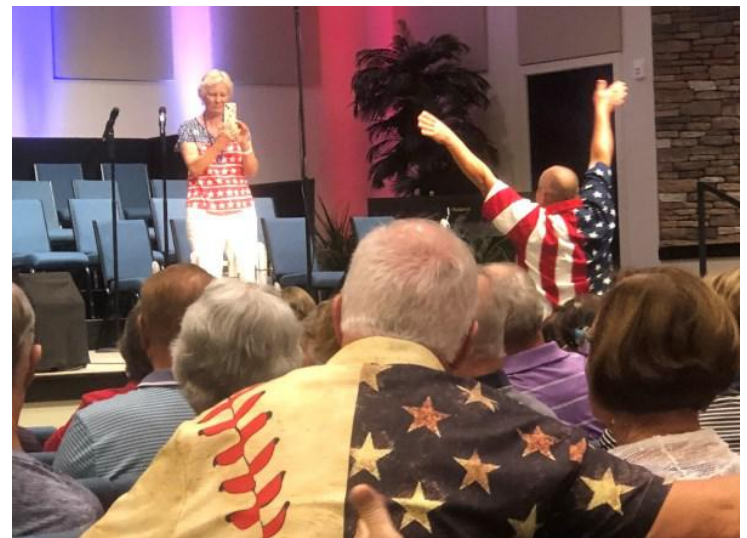
There is a photobomber in every crowd!!