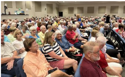
We had totally sold out the concert a week before.