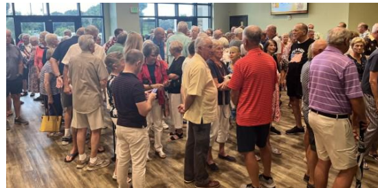
Good thing we have a large foyer!