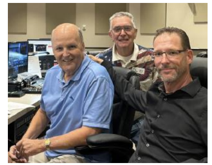
Our great tech people were on the job as usual.