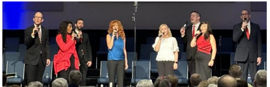
The Liberty Voices!