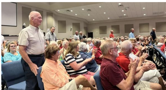
Men stood during the armed forces medley.