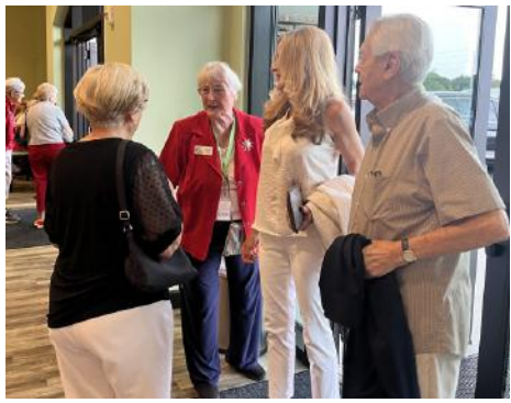
Friendly greeters were at each door to take tickets.