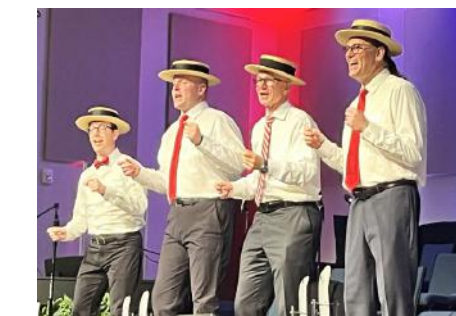
The Humdingers Barbershop quartet