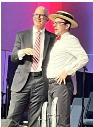
Cutting up with a Humdinger