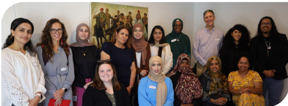
Majdal staff and SDRCC host the BUILD Health Initiative for a site visit.