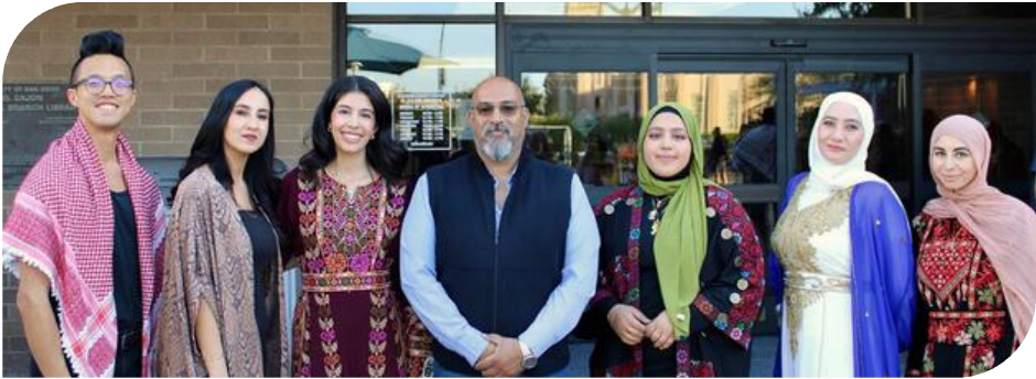
Majdal Staff at our Homeland & Homemaking Exhibit Launch!

Our leadership reflects the communities we serve.