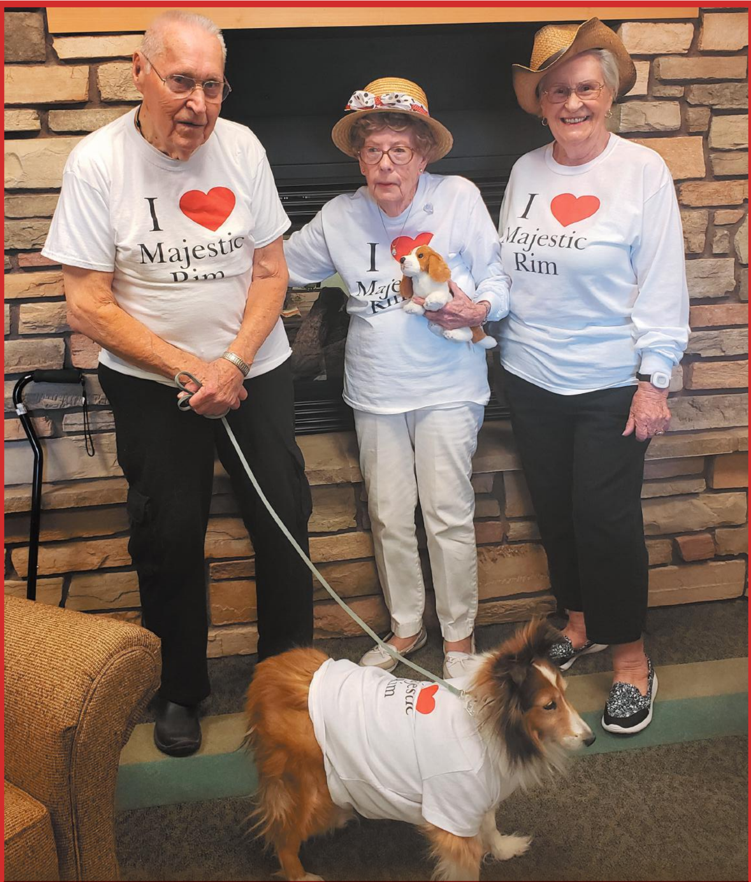
Love overflows here at Majestic Rim