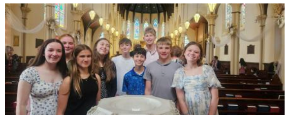
Celebrate the confirmation class of 2026 on Sat May 2, at the 5:30pm service