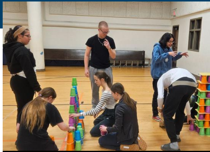
High School Youth Group is on break until August 23rd

Sun May 10 at the 10:30am service. After worship, graduates are invited to pick up a gift in the Otis Young Room.