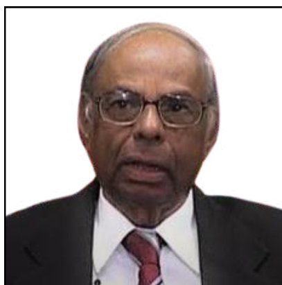
Dr C Rangarajan

Chairman & Managing Director TVS Capital Funds (P) Limited