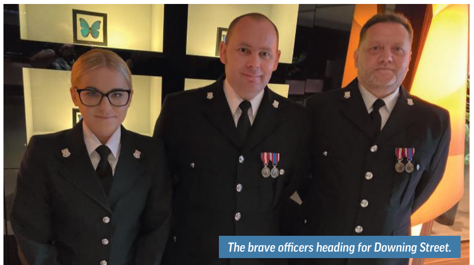
The brave officers heading for Downing Street.

"They were just wonderful and engaging and we talked about the incident which led