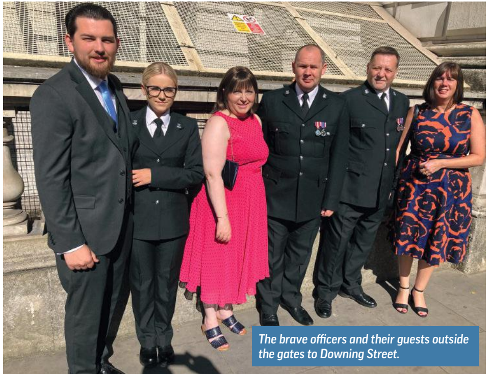
The brave officers and their guests outside the gates to Downing Street.

A police officer who was slashed twice in the face as he tackled a man under the influence of drugs has been honoured at the Police Bravery Awards along with two colleagues who came to his aid.