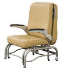
AG-AC005 Accompany chair