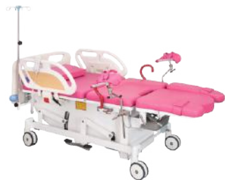
AG-C500 Electric LDR bed