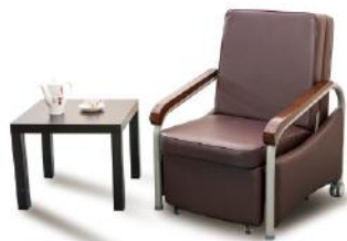
AG-AC007 Luxurious accompany chair