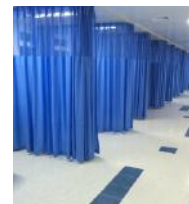
AG-CL001 Curtain with track