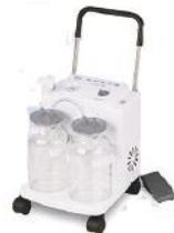
AG-D0031 Suction machine