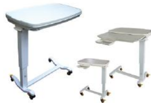
AG-OBT013 Over bed table