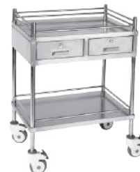
AG-SS040A-1 Treatment trolley