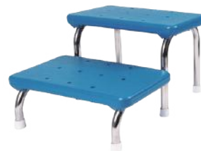
AG-FS008 Double foot steps