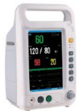
AG-BZ007 Patient monitor