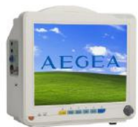
AG-BZ008 Patient monitor