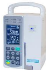
AG-XB-Y1000 Single-channel infusion pump