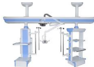
AG-18C-3 ICU pendant