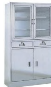
AG-SS004-1 SS Instrument locker