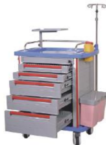
AG-ET001A1-850MM ABS Emergency trolley