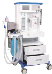
AG-AM001 Anaesthesia machine