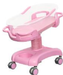
AG-CB011 Baby cart