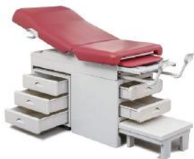
AG-S108 Gynecology exam table