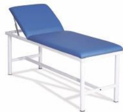
AG-ECC01 Examination couch