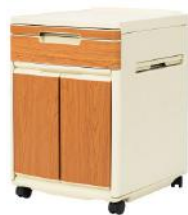
AG-BC025 ABS Bedside cabinet