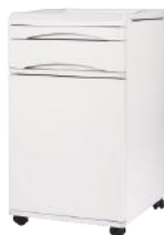
AG-BC020 Bedside cabinet