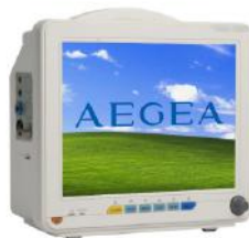
AG-BZ008 Patient monitor