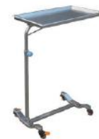
AG-SS008A Mayo cart