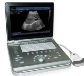
AG-BU009 Ultrasound scanner