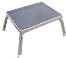
AG-FS003 SS foot step