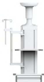
AG-58 Hospital surgical pendant