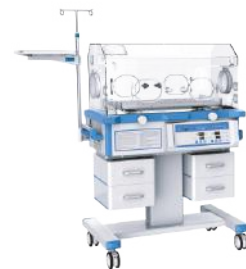
AG-IIR001C Infant incubator