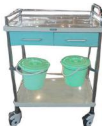
AG-MT035A Treatment trolley