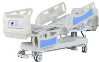
AG-BY009 5-Function electric hospital bed (weighing-type )