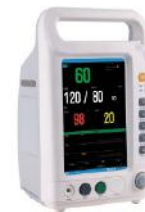
AG-BZ007 Patient monitor