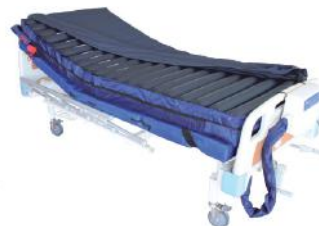
AG-M0016 Air mattress