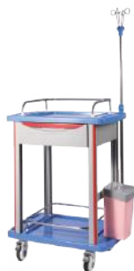
AG-LPT006B Clinical trolley