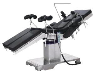
AG-OT650 Electric-hydraulic operating table