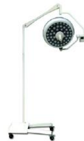
AG-LT020A-1 LED Operating light