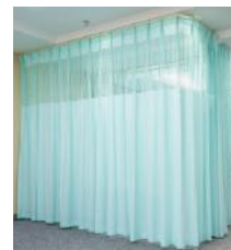
AG-CL001 Curtain with track