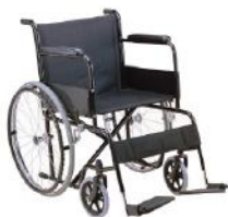
AG-LY875 Wheel chair