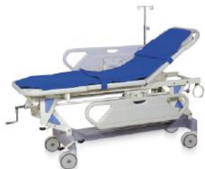
AG-HS002 Manual transfer stretcher