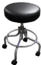
AG-NS001 Doctor stool