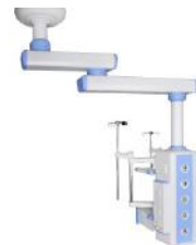
AG-360-2 Double arms hospital pendant