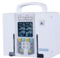
AG-XB-Y1200 Double-channel infusion pump