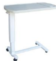
AG-OBT002 Over bed table