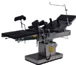
AG-OT009 Electric operating table