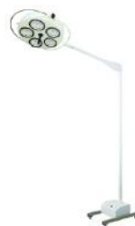
AG-LT030A-1 LED Operating light