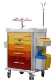
AG-P3 ABS Emergency trolley