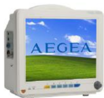
AG-BZ008 Patient monitor