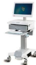
AG-WT006 ABS medical workstation trolley