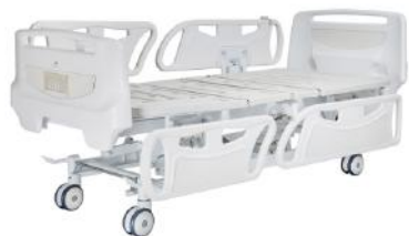
AG-BY003C 5-function electric hospital bed