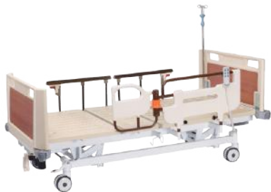
AG-W003 3-Function manual & electric homecare bed