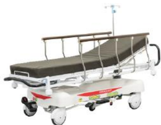
AG-HS001 Hydraulic transport stretcher