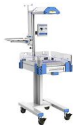
AG-IRW002A Infant radiant warmer