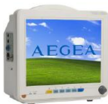
AG-BZ008 Patient monitor