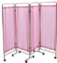
AG-SC001 Bedside screen