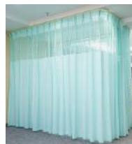
AG-CL001 Curtain with track