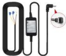
6 Power Box