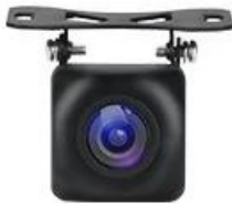
3 1080P Rear Camera