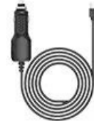
2 Car Charge