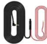
4 10m Cable (optional)