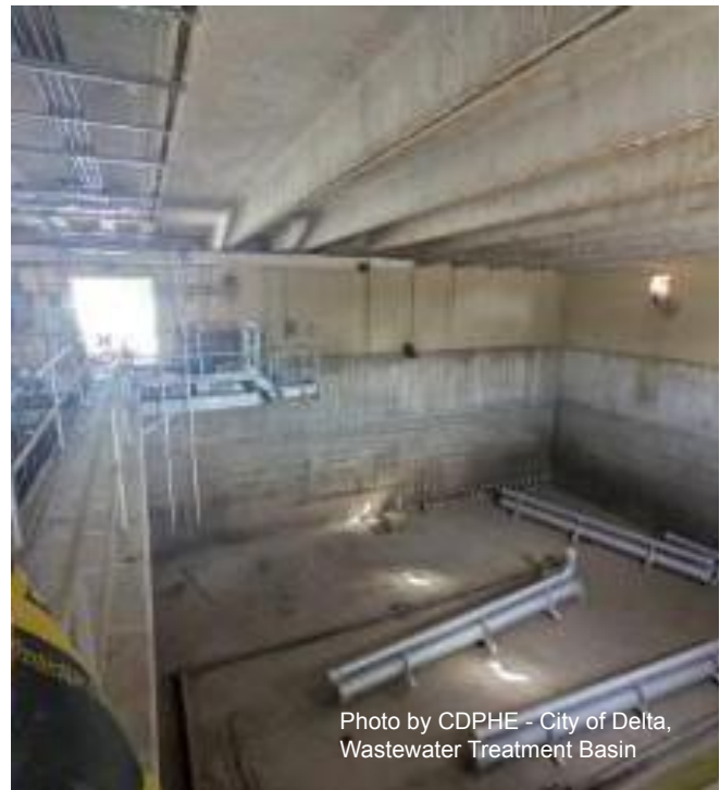
City of Delta, Wastewater Treatment Basin