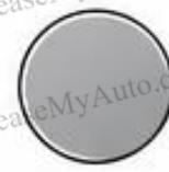
Machine Gray Metallic