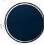
Deep Crystal Blue Mica