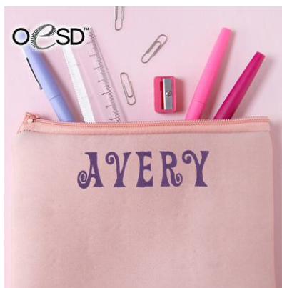
♡ 👁 📌 Action Alphabet — $12.99