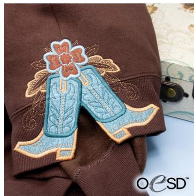
♡ 👁 📌 Split Seam Appliques $9.99