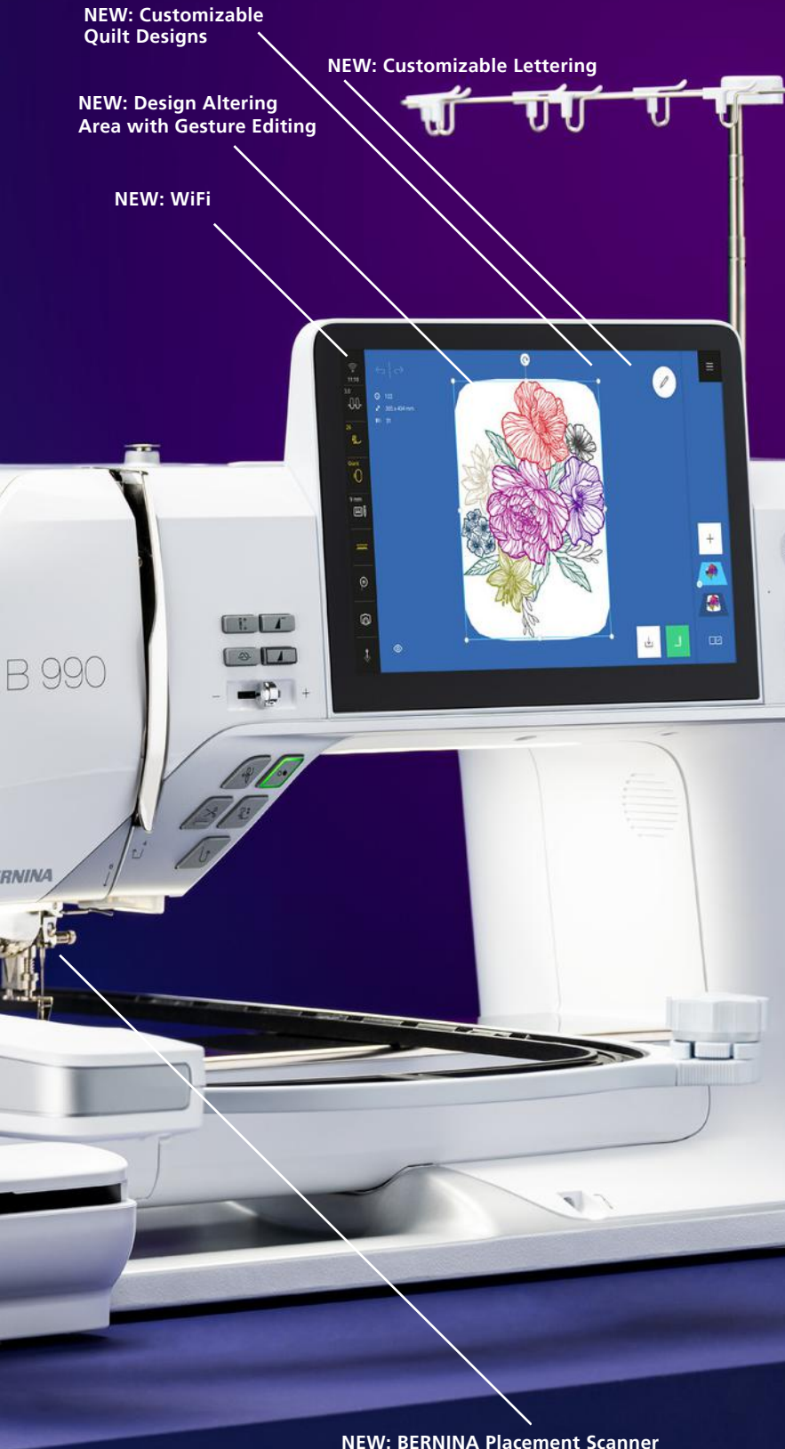
NEW: BERNINA Placement Scanner

WiFi allows you to transfer embroidery designs from your optional BERNINA Embroidery Software 9 DesignerPlus directly to your B 990, or the other way around. And thanks to the new BERNINA Stitchout App, the embroidery process can be monitored on your smartphone or tablet. The B 990 connects with the app allowing you to monitor the status of your embroidery stitchout from any room in your house. The app notifies you when the machine needs your direct attention, like thread color change, thread breakage or when the design is finished.