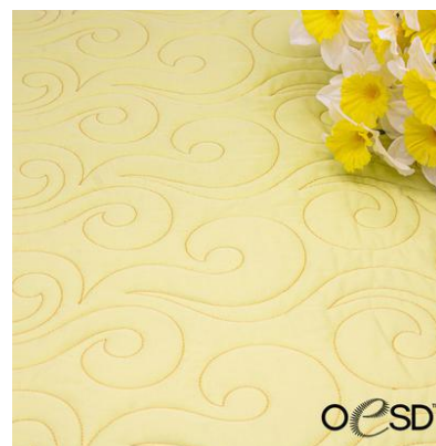
♡ 👁 📌 Edge-to-Edge Highlights $39.99