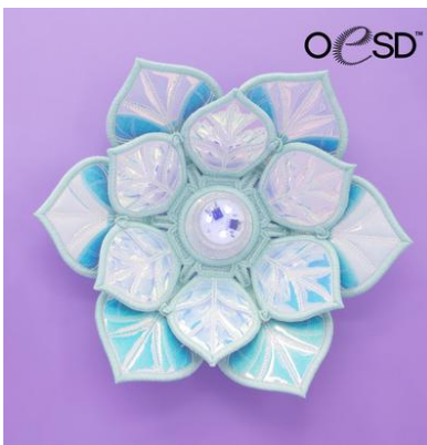
♡ 👁 📌 Freestanding Tea Light Lotus $12.99