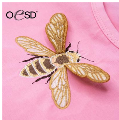
♡ 👁 📌 Wings of Beauty $14.99