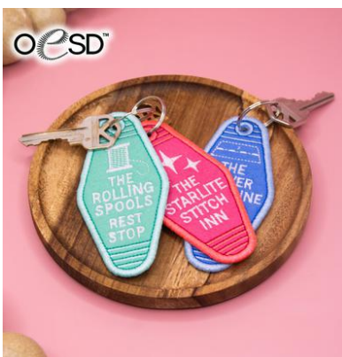
♡ 👁 📌 Sew Vintage Keychains $12.99