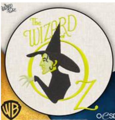
♡ 👁 📌 Classic Wizard of Oz $39.99