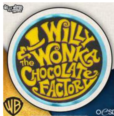
♡ 👁 📌 Classic Willy Wonka $59.99