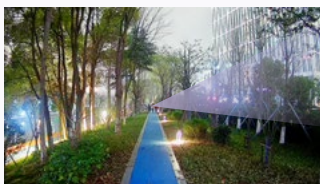
Image taken by DF3T cameras 2 MP