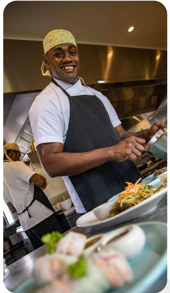
Friendly chef prepares lunch at the Tovolea Restaurant at Six Senses Fiji Resort, at the Malolo Island