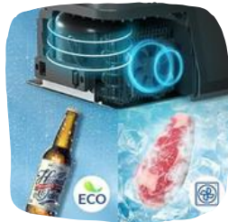
Cool or Chill

Whether you're enjoying a day at the beach, spending a few days on the road, or camping with family and friends, the new Car Fridge has everything you need to keep beverages, food, and snacks fresh and convenient.