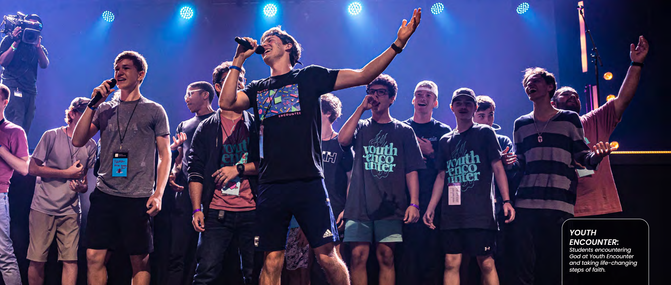
YOUTH ENCOUNTER: Students encountering God at Youth Encounter and taking life-changing steps of faith.