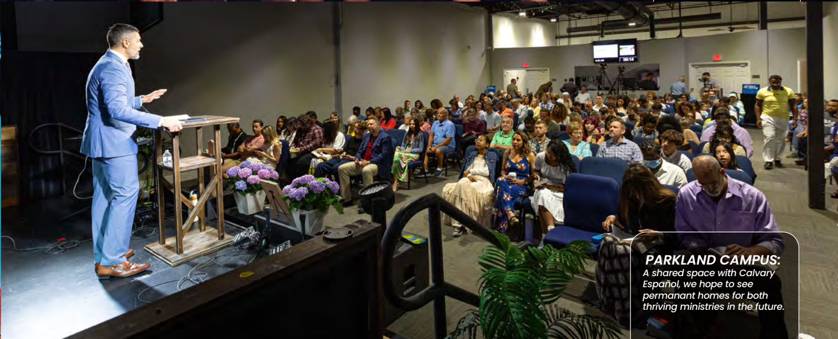
PARKLAND CAMPUS: A shared space with Calvary Español, we hope to see permanent homes for both thriving ministries in the future.