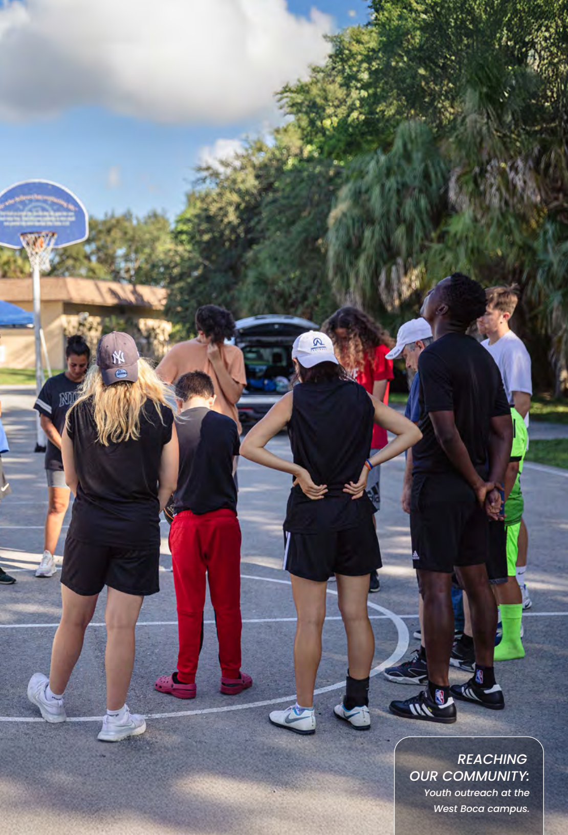
REACHING OUR COMMUNITY: Youth outreach at the West Boca campus.