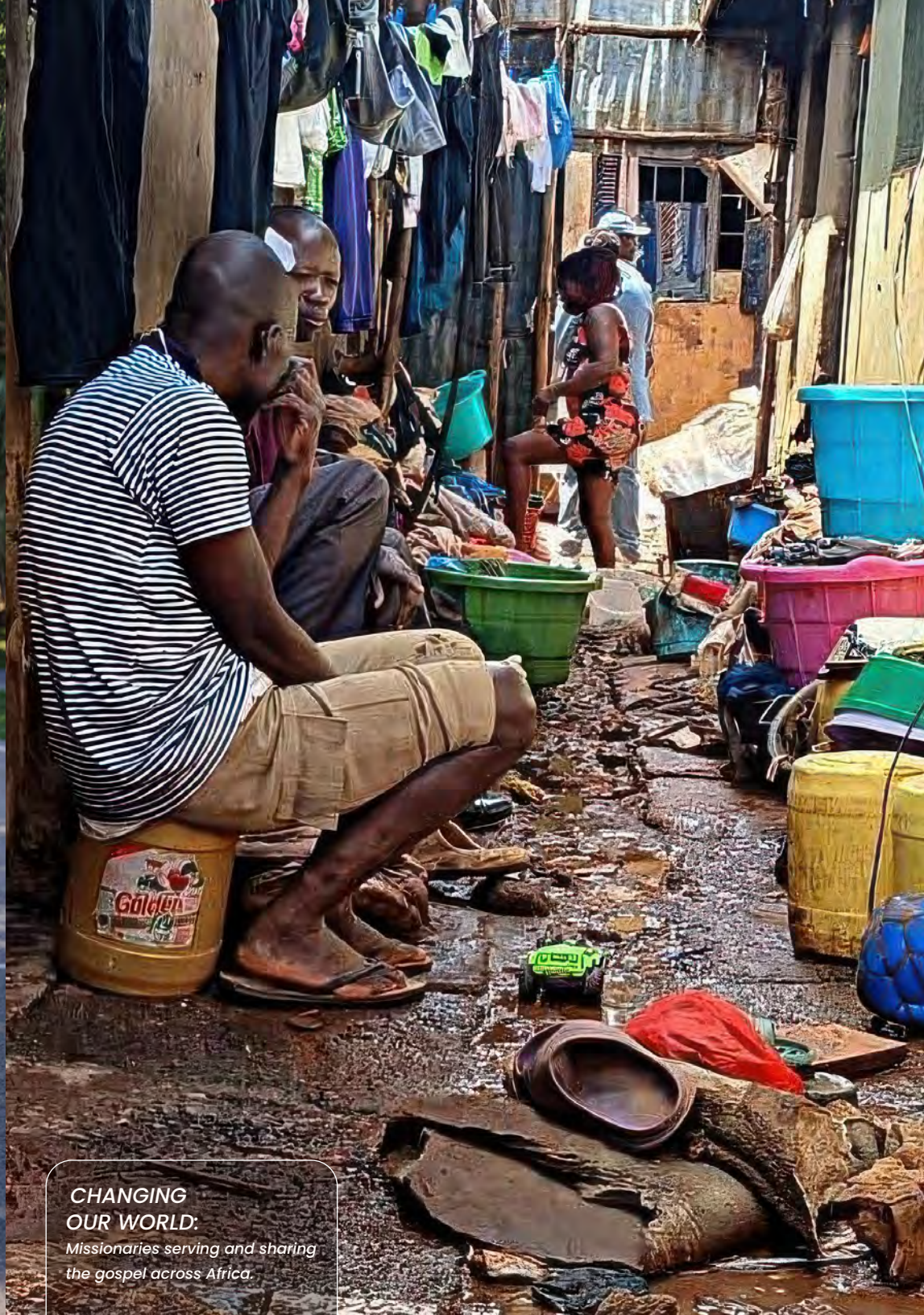
CHANGING OUR WORLD: Missionaries serving and sharing the gospel across Africa.