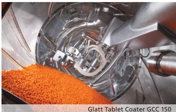
Glatt Tablet Coater GCC 150

Coating protects the API, individualizes the tablet and can modify the release profile.