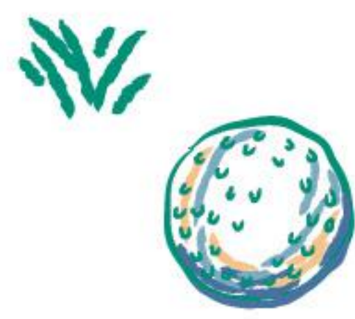
2-Club Icon or Golf Ball