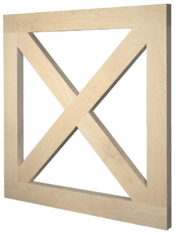
Part #213458 Square Wooden Kitchen Island End Panel 34 1/2" x 1 3/4"

Part #5290004000 Mitered Square Dining Table Leg with Rounded Corners 29" x 4"