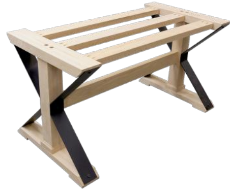
Part #379999 Slater Cross Beam Pedestal Base Kit