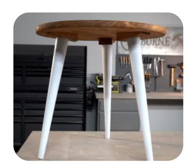
Part #3911 | 1 9/16" x 2 3/4" x 5" Single Leg Mounting Cleat