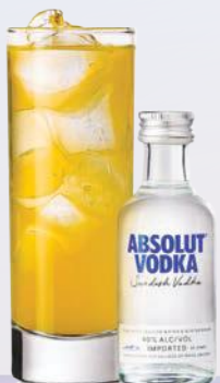
Vodka & Orange €9.50