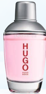
HUGO BOSS Energise EdT 75ml

Cool Water, the aromatic essence of masculine vitality, power and seduction.