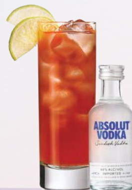
Bloody Mary €9.50