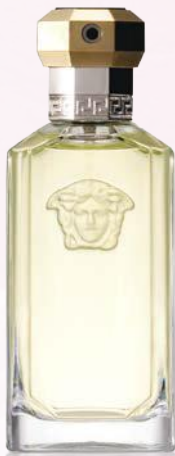
VERSACE The dreamer EdT 50ml

HUGO Energise is a source of vitality for men who want to move on their own terms.