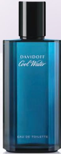
DAVIDOFF Cool Water EdT 75ml