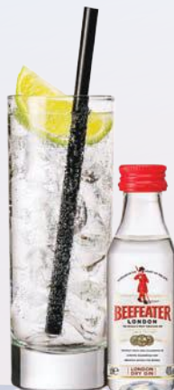
Gin & Tonic €9.50