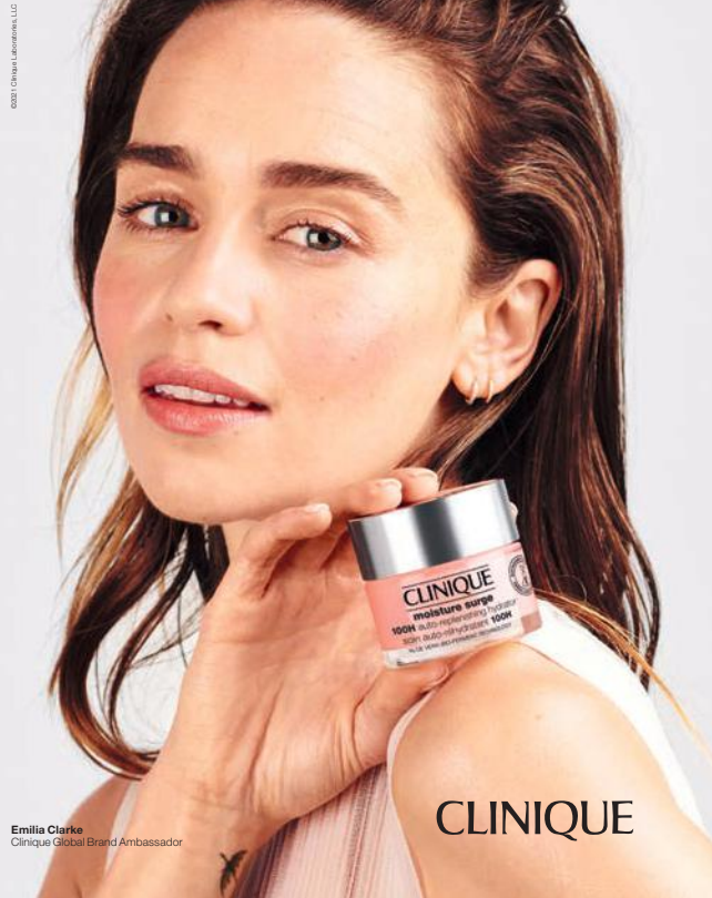
Emilia Clarke Clinique Global Brand Ambassador

Air travel dehydrates the skin – here's everything you need to arrive hydrated and refreshed. Moisture Surge™ 100-Hour Auto Replenishing Hydration 75ml, Face Spray 30ml, All About Eyes Serum 15ml. The product packaging does not contain cellophane.