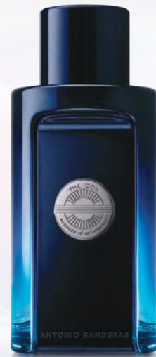
ANTONIO BANDERAS Icon EdT 100ml

Versace Dreamer is a transparent perfume, warm and fresh at the same time.