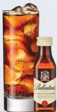
Whisky & Coke €9.50