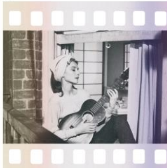
Breakfast at Tiffany's (1961)

In the bustling metropolis of New York City, a timeless tale unfolds with music, magic, and a touch of Southern charm. Audrey Hepburn's captivating rendition of 'Moon River' in 'Breakfast at Tiffany's' epitomizes its essence. Despite doubts about her singing voice, Henry Mancini tailored the melody perfectly. Inspired by a scene from 'Funny Face,' Mancini composed the enchanting notes in just half an hour. Johnny Mercer's lyrical prowess painted a nostalgic ode to the South, completing the masterpiece. Paramount executives considered cutting the scene, but Hepburn's insistence preserved its place. 'Moon River' became the heart of the film, resonating across generations. Henry Mancini noted that Hepburn's rendition remains definitive, encapsulating the song's timeless charm. Every listen reminds us of cinema's magic and the enduring legacy of a song that dared to dream.