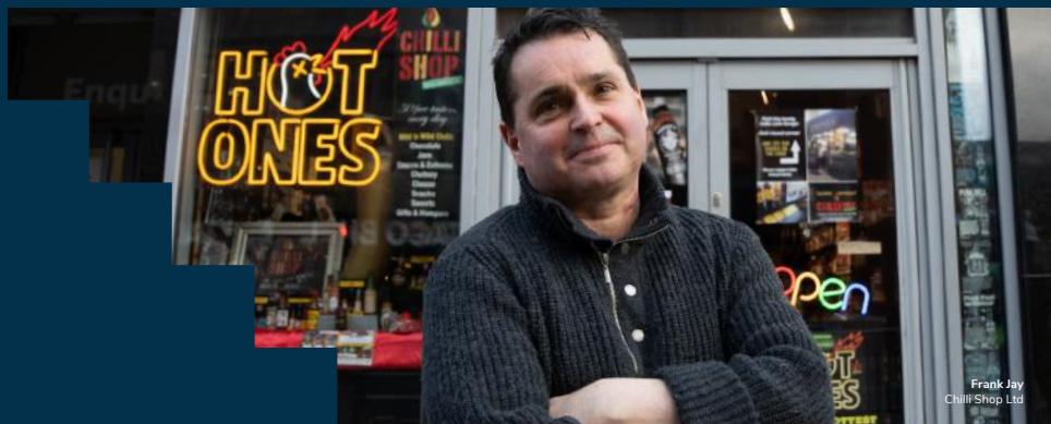
Frank Jay Chill Shop Ltd