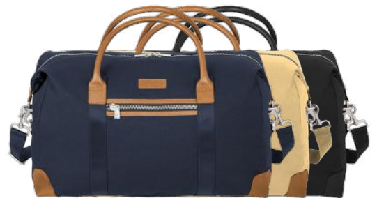
BROOKS BROTHERS Wells Duffel BB18880 3 colors

Heat Transfer is the most effective technique for these styles