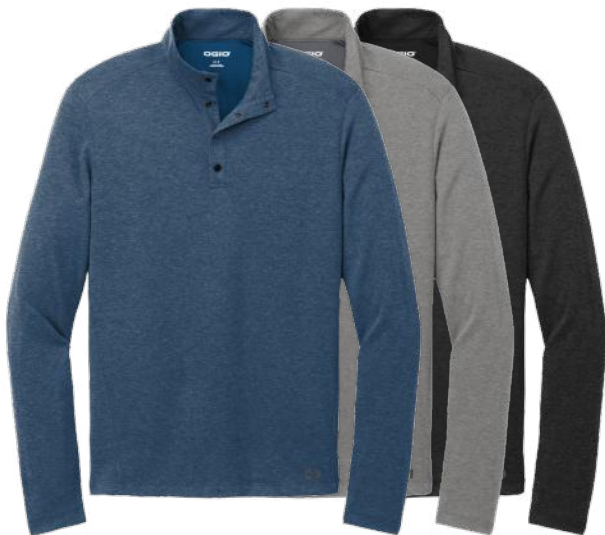
OGIO Command 1/4-Snap OG151 Adult Sizes: XS-4XL | 3 colors