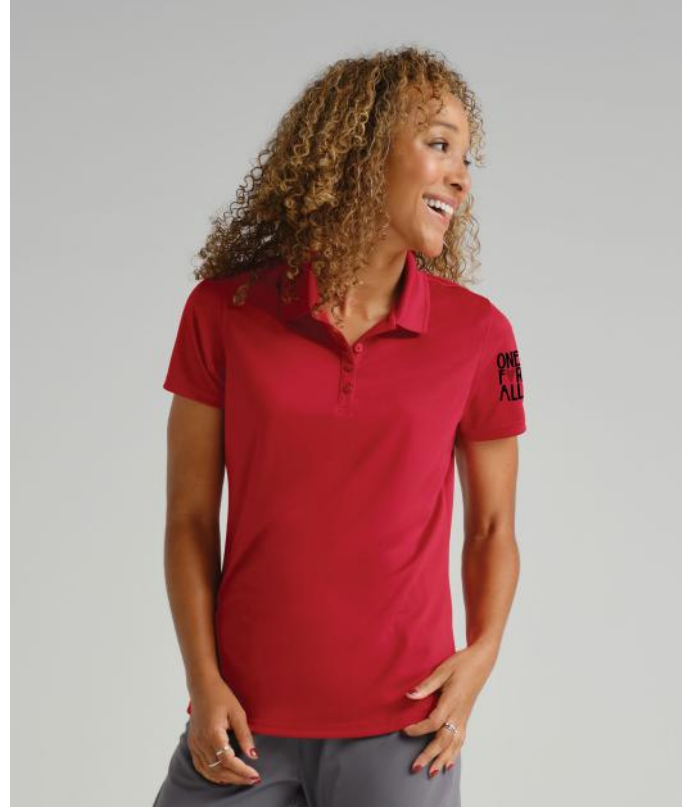
PORT AUTHORITY Ladies Dry Zone UV Micro-Mesh Polo LK110 Women's Sizes: XS-4XL | 16 colors