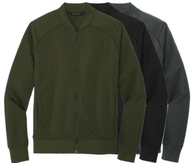
MERCER + METTLE Double-Knit Bomber MM3000 Adult Sizes: XS-4XL | 4 colors