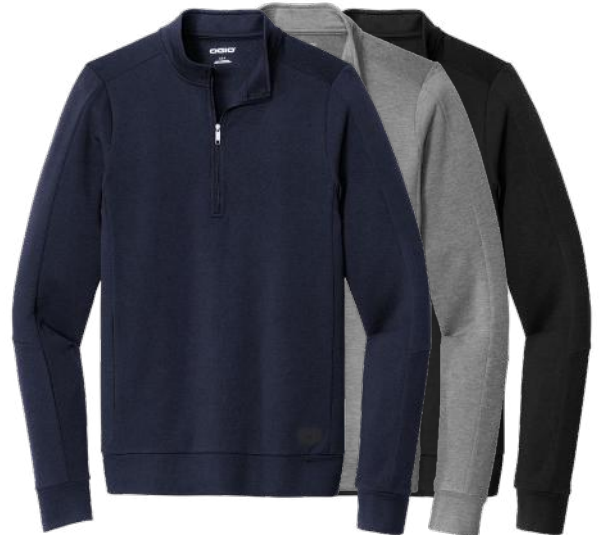
OGIO Luuma 1/2-Zip Fleece OG813 Adult Sizes: XS-4XL | 3 colors