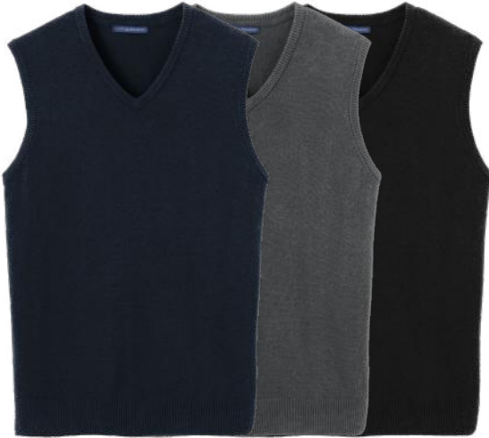
PORT AUTHORITY Sweater Vest SW286 Adult Sizes: XS-4XL | 3 colors