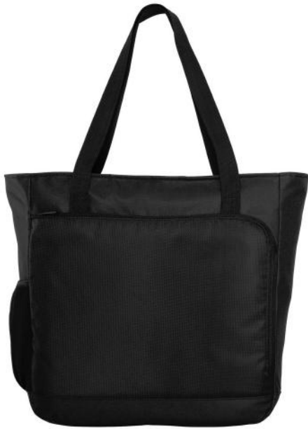
PORT AUTHORITY City Tote BG422 1 color