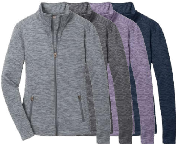
PORT AUTHORITY Ladies Digi Stripe Fleece Jacket L231 Women's Sizes: XS-4XL | 4 colors