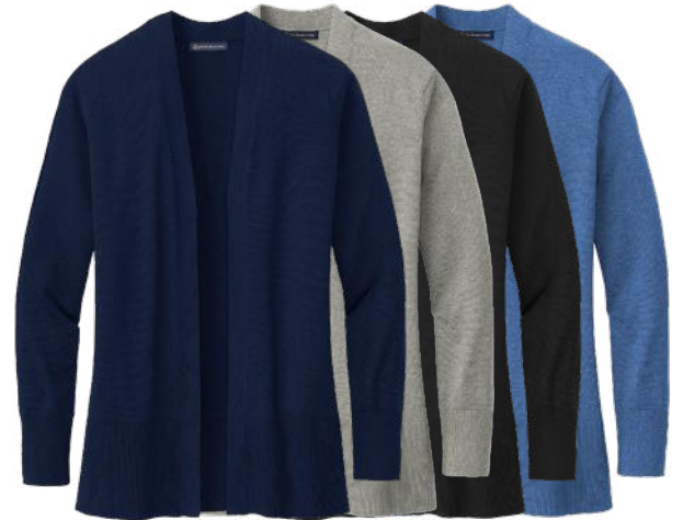
BROOKS BROTHERS Women's Cotton Stretch Long Cardigan Sweater BB18403 Women's Sizes: XS-4XL | 4 colors