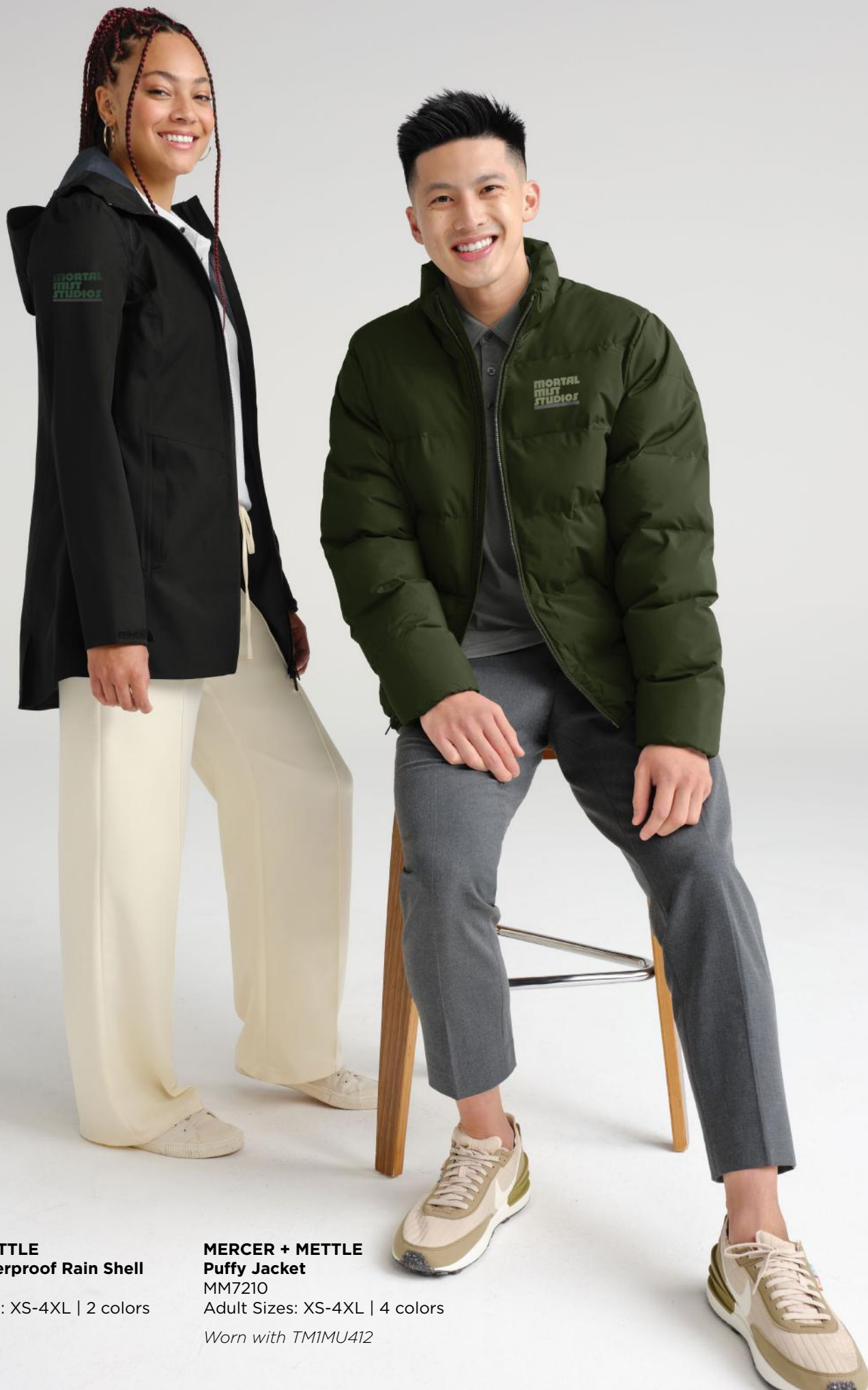
MERCER + METTLE Women's Waterproof Rain Shell MM7001 Women's Sizes: XS-4XL | 2 colors