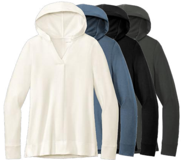
PORT AUTHORITY Ladies Microterry Pullover Hoodie LK826 Women's Sizes: XS-4XL | 4 colors