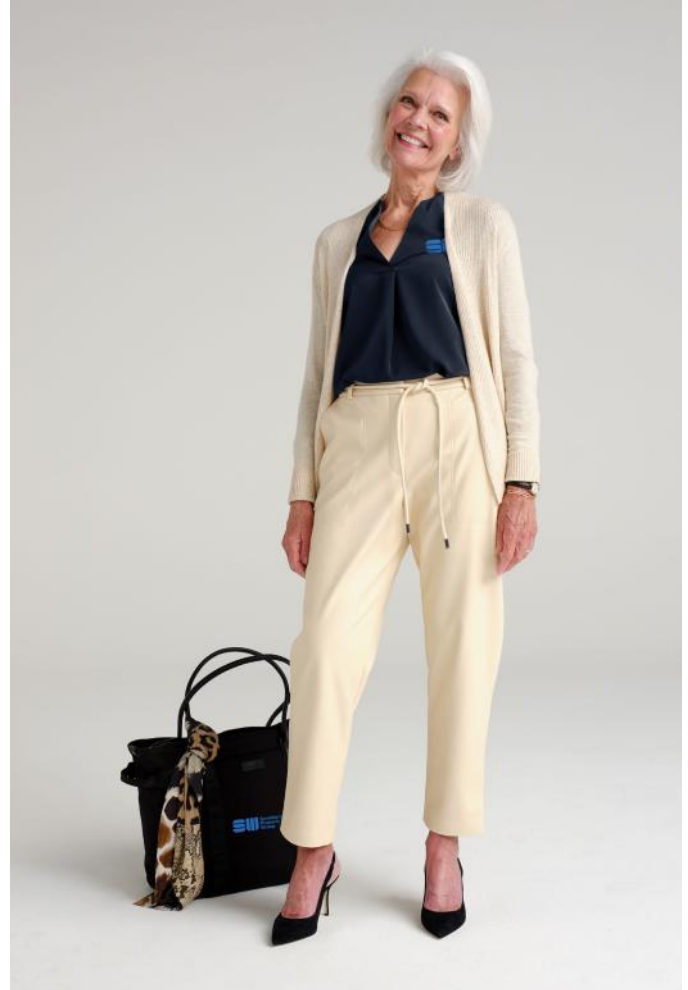
BROOKS BROTHERS Wells Laptop Tote BB18840 2 colors Worn with BB18009, LSW289