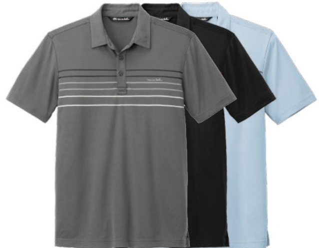
TRAVISMATHEW Coto Performance Chest Stripe Polo TM1MY400 Adult Sizes: S-3XL | 3 colors