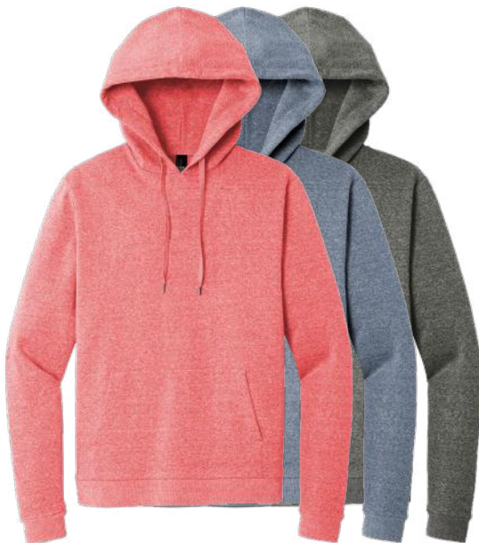
DISTRICT Perfect Tri Fleece Pullover Hoodie DT1300 Adult Sizes: XS-4XL | 12 colors