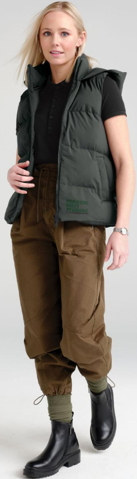
MERCER + METTLE Women's Stretch Heavyweight Pique Polo MM1001 Women's Sizes: XS-4XL | 8 colors