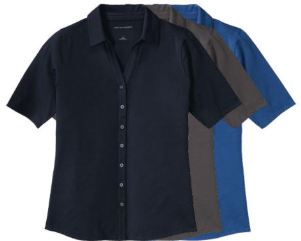
PORT AUTHORITY Ladies City Stretch Top LK682 Women's Sizes: XS-4XL | 5 colors