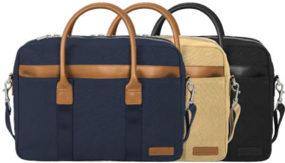
BROOKS BROTHERS Wells Briefcase BB18830 3 colors