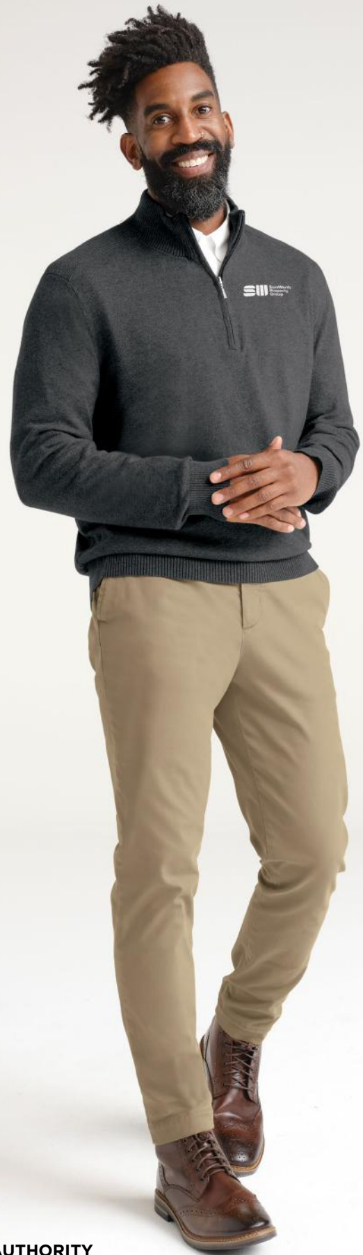
PORT AUTHORITY 1/2-Zip Sweater SW290 Adult Sizes: XS-4XL | 3 colors Worn with BB18002