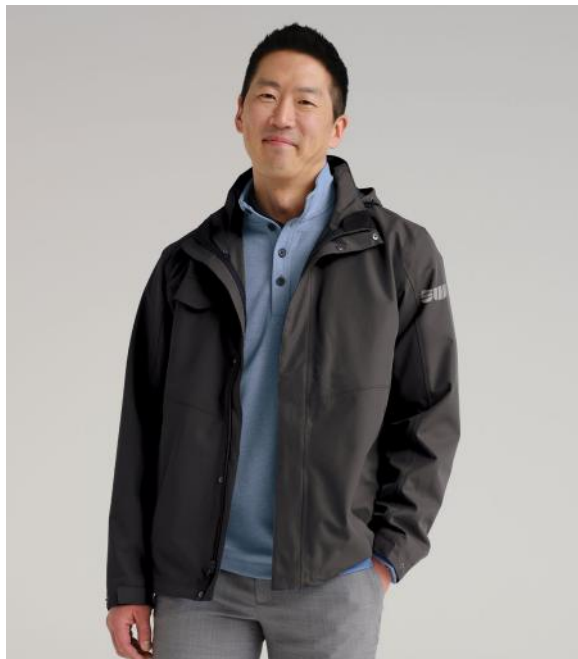
PORT AUTHORITY Collective Outer Shell Jacket J900 Adult Sizes: XS-4XL | 4 colors Worn with NKDC2104, BB18202