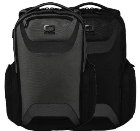
OGIO Connected Pack 91008 2 colors