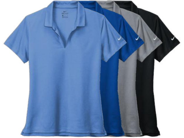
NIKE Ladies Dri-FIT Micro Pique 2.0 Polo NKDC1991 Women's Sizes: S-2XL | 20 colors