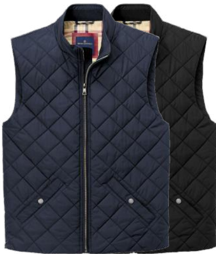
BROOKS BROTHERS Quilted Vest BB18602 Adult Sizes: XS-4XL | 2 colors