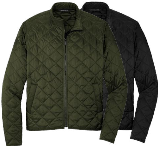
MERCER + METTLE Quilted Full-Zip Jacket MM7200 Adult Sizes: XS-3XL | 2 colors