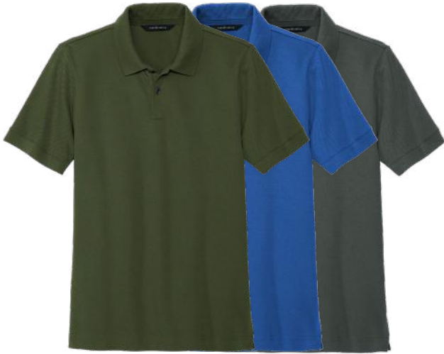
MERCER + METTLE Stretch Heavyweight Pique Polo MM1000 Adult Sizes: XS-4XL | 8 colors