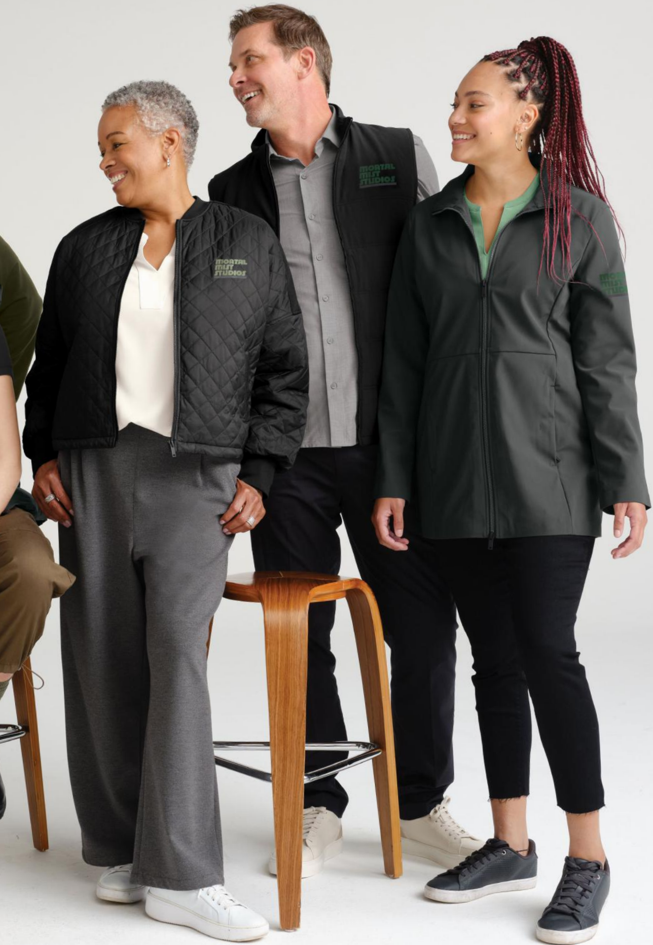
LEFT TO RIGHT: MM1006 MM3000 OG826 MM1001 MM7217 MM7201 MM2011 MM2000 TMIMW453 MM7101 MM2011