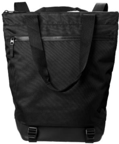
MERCER + METTLE Convertible Tote MMB202 1 color