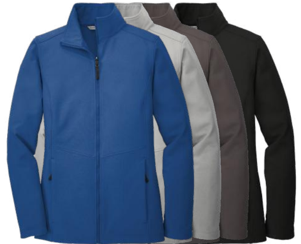
PORT AUTHORITY Ladies Collective Soft Shell Jacket L901 Women's Sizes: XS-4XL | 5 colors