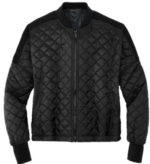
MERCER + METTLE Women's Boxy Quilted Jacket MM7201 Women's Sizes: XS-4XL | 1 color