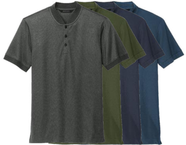
MERCER + METTLE Stretch Pique Henley MM1008 Adult Sizes: XS-4XL | 7 colors