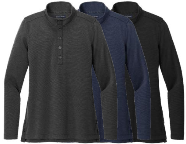
BROOKS BROTHERS Women's Mid-Layer Stretch 1/2 Button BB18203 Women's Sizes: XS-4XL | 3 colors