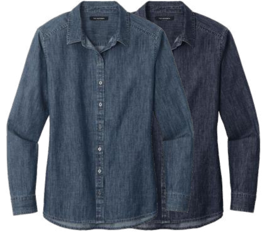
PORT AUTHORITY Ladies Long Sleeve Perfect Denim Shirt LW676 Women's Sizes: XS-4XL | 2 colors