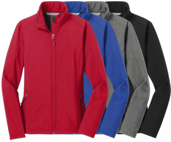
PORT AUTHORITY Ladies Core Soft Shell Jacket L317 Women's Sizes: XS-4XL | 10 colors