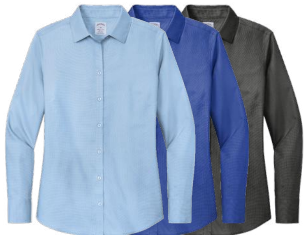
BROOKS BROTHERS Wrinkle Free Women's Stretch Nailhead Shirt BB18003 Women's Sizes: XS-4XL | 6 colors