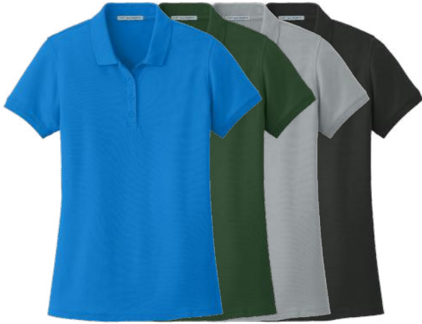
PORT AUTHORITY Ladies Core Classic Pique Polo L100 Women's Sizes: XS-6XL | 13 colors