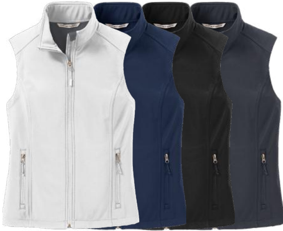
PORT AUTHORITY Ladies Core Soft Shell Vest L325 Women's Sizes: XS-4XL | 5 colors