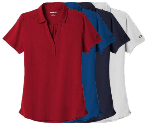
OGIO Ladies Limit Polo LOG138 Women's Sizes: XS-4XL | 7 colors