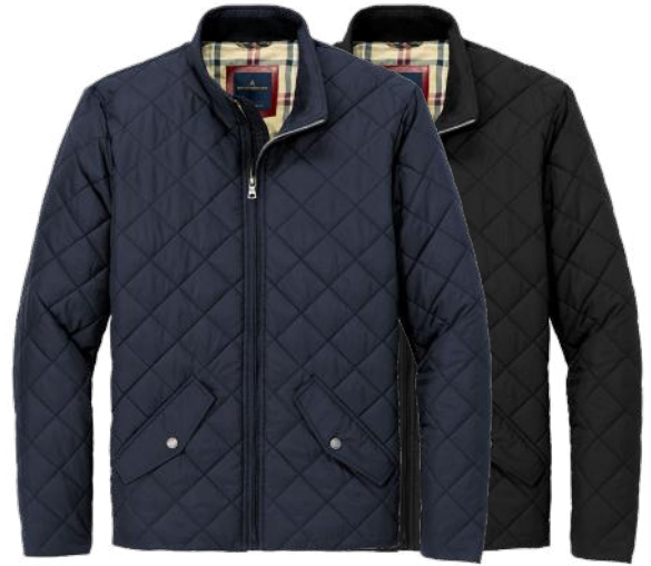
BROOKS BROTHERS Quilted Jacket BB18600 Adult Sizes: XS-4XL | 2 colors