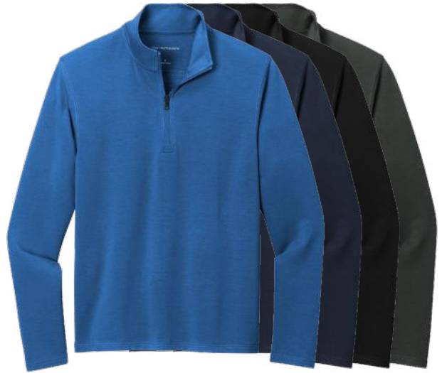
PORT AUTHORITY Microterry 1/4-Zip Pullover K825 Adult Sizes: XS-4XL | 4 colors