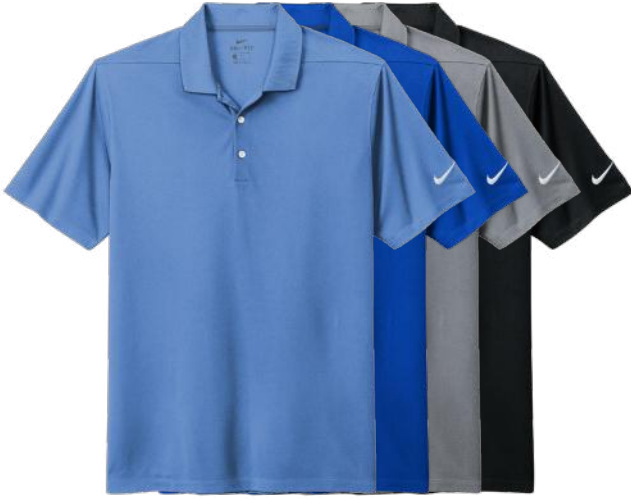
NIKE Dri-FIT Micro Pique 2.0 Polo NKDC1963 Adult Sizes: XS-4XLT | 20 colors