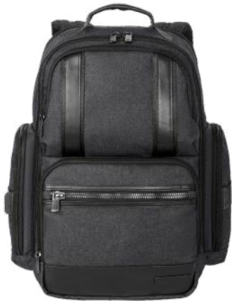
BROOKS BROTHERS Grant Backpack BB18820 1 color