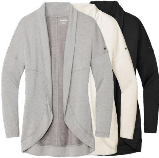
OGIO Ladies Luuma Coccoon Fleece LOG811 Women's Sizes: XS-4XL | 3 colors