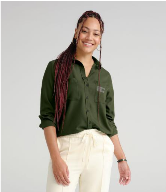
MERCER + METTLE Women's Stretch Crepe Long Sleeve Camp Blouse MM2013 Women's Sizes: XS-4XL | 4 colors