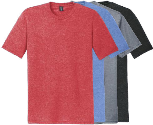
DISTRICT Perfect Tri Tee DM130 Adult Sizes: XS-4XL | 35 colors