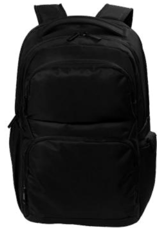
PORT AUTHORITY Transit Backpack BG224 1 color