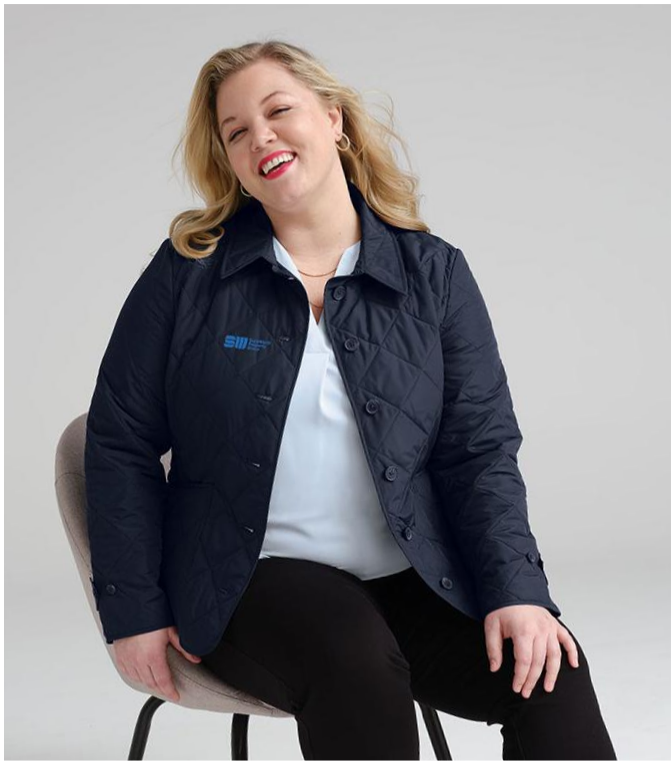
BROOKS BROTHERS Women's Quilted Jacket BB18601 Women's Sizes: XS-4XL | 2 colors Worn with BB18009