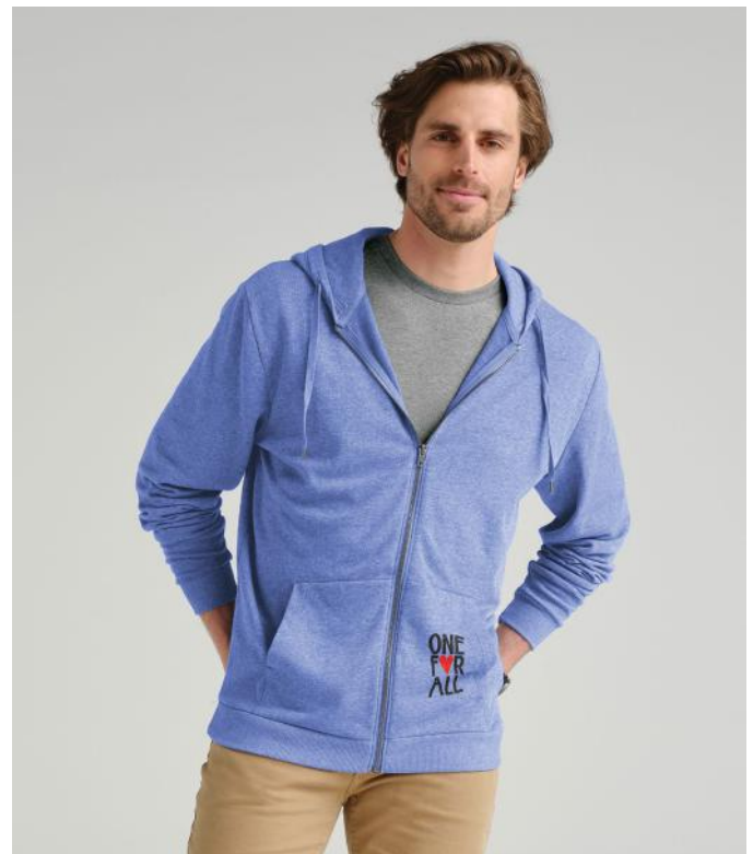
DISTRICT Perfect Tri Fleece Full-Zip Hoodie DT1302 Adult Sizes: XS-4XL | 6 colors Worn with DM130