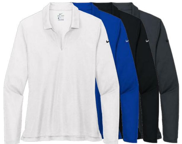
NIKE Ladies Dri-FIT Micro Pique 2.0 Long Sleeve Polo NKDC2105 Women's Sizes: S-2XL | 7 colors