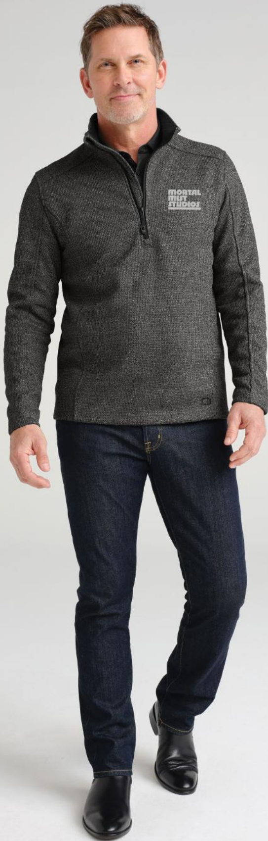
OGIO Grit Fleece 1/2-Zip OG729 Adult Sizes: XS-4XL | 2 colors Worn with TM1MY399