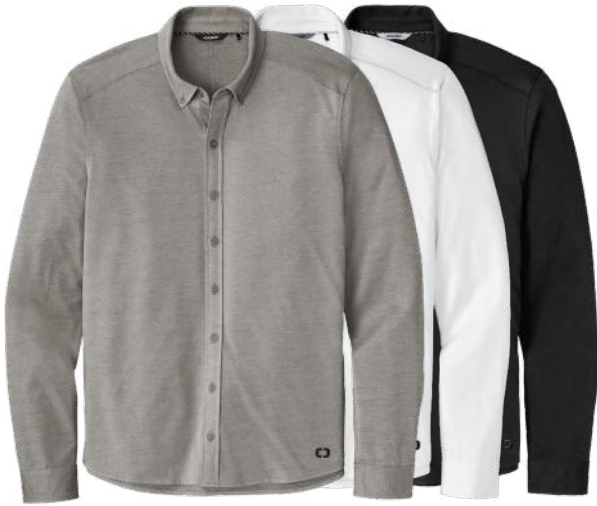
OGIO Code Stretch Long Sleeve Button-Up OG145 Adult Sizes: XS-4XL | 3 colors