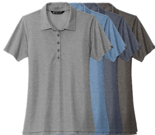
TRAVISMATHEW Ladies Oceanside Heather Polo TM1WW002 Women's Sizes: S-2XL | 6 colors