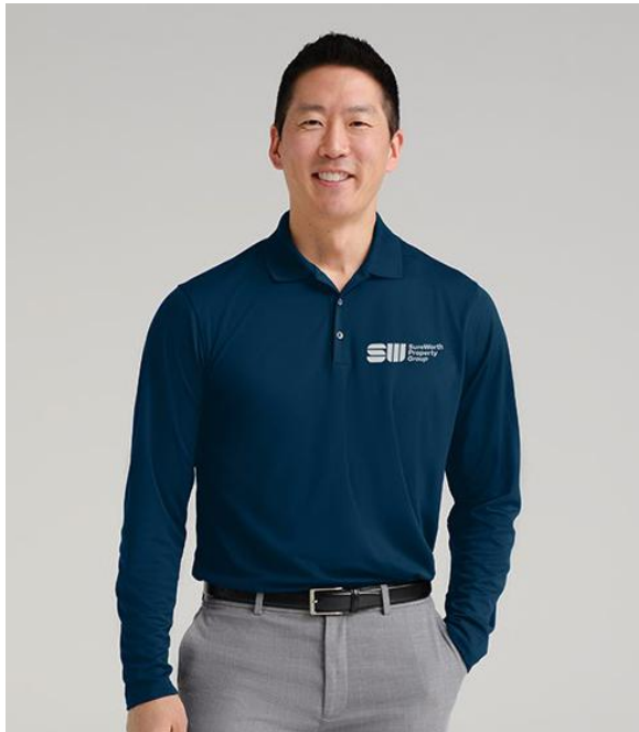
NIKE Dri-FIT Micro Pique 2.0 Long Sleeve Polo NKDC2104 Adult Sizes: XS-4XL | 7 colors