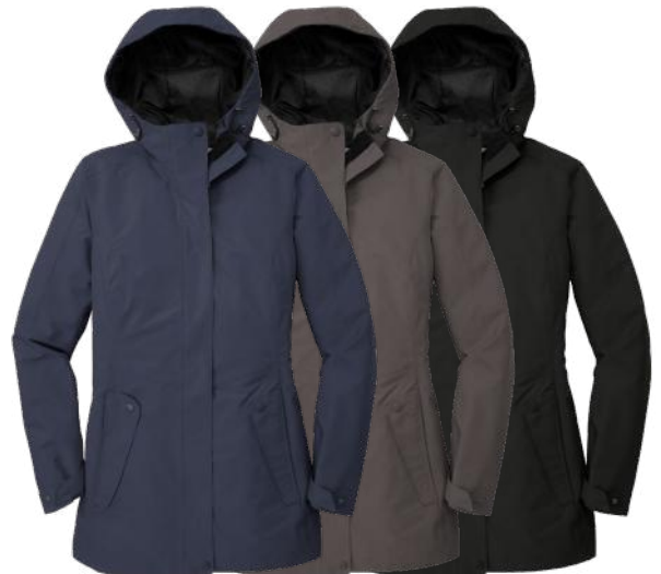
PORT AUTHORITY Ladies Collective Outer Shell Jacket L900 Women's Sizes: XS-4XL | 4 colors