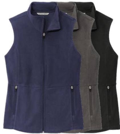
PORT AUTHORITY Ladies Accord Microfleece Vest L152 Women's Sizes: XS-4XL | 3 colors