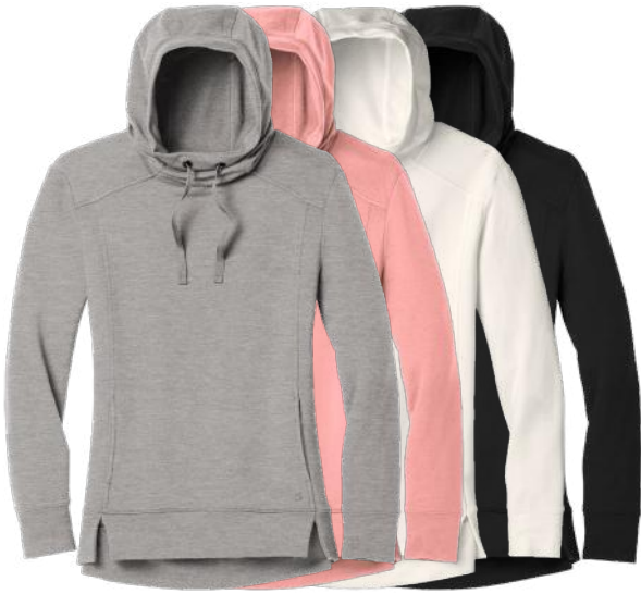
OGIO Ladies Luuma Pullover Fleece Hoodie LOG810 Women's Sizes: XS-4XL | 4 colors