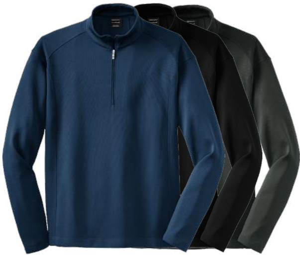
NIKE Sport Cover-Up 400099 Adult Sizes: XS-4XL | 3 colors