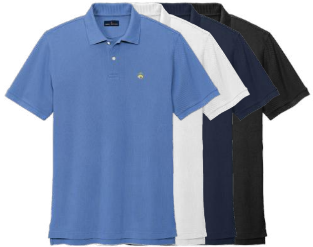
BROOKS BROTHERS Pima Cotton Pique Polo BB18200 Adult Sizes: XS-4XL | 6 colors