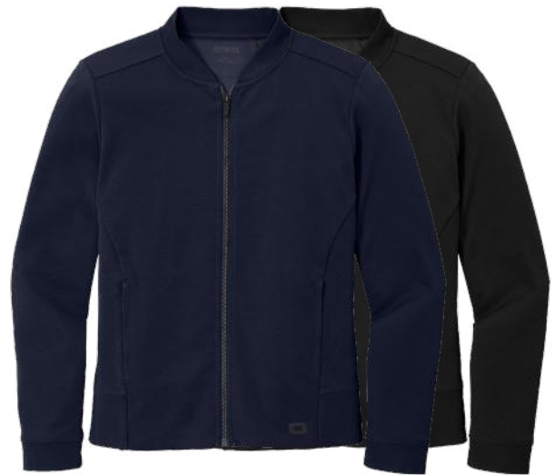
OGIO Ladies Hinge Full-Zip LOG820 Women's Sizes: XS-4XL | 3 colors