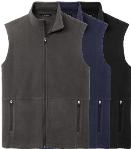
PORT AUTHORITY Accord Microfleece Vest F152 Adult Sizes: XS-4XL | 3 colors