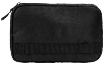
MERCER + METTLE Utility Case MMB700 1 color