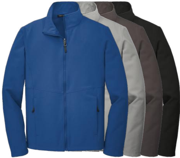
PORT AUTHORITY Collective Soft Shell Jacket J901 Adult Sizes: XS-4XL | 5 colors