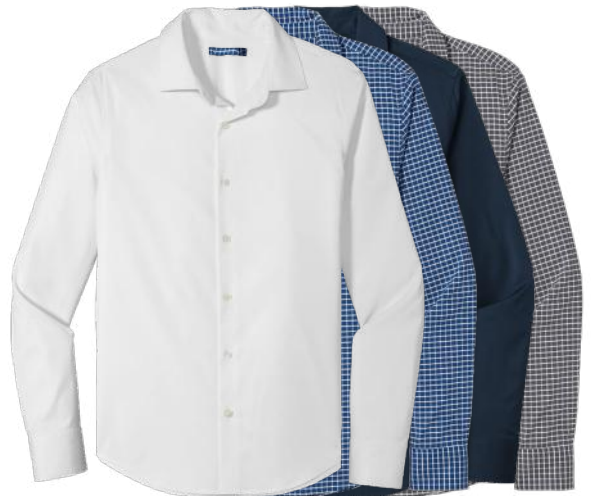
PORT AUTHORITY City Stretch Shirt W680 Adult Sizes: XS-4XL | 5 colors