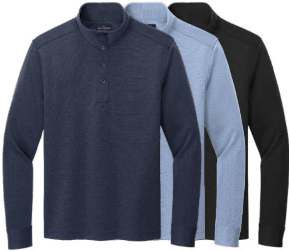
BROOKS BROTHERS Mid-Layer Stretch 1/2 Button BB18202 Adult Sizes: XS-4XL | 5 colors