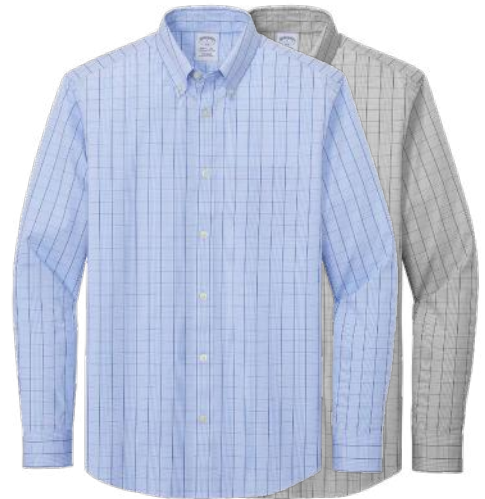
BROOKS BROTHERS Wrinkle Free Stretch Patterned Shirt BB18008 Adult Sizes: XS-4XL | 2 colors

Buttoned-up should not mean boring. A true classic look brings the team together with a sense of professionalism and pride.