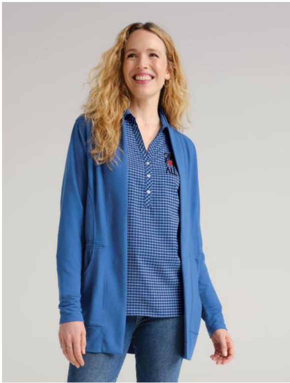
PORT AUTHORITY Ladies Microterry Cardigan LK825 Women's Sizes: XS-4XL | 4 colors Worn with LW680