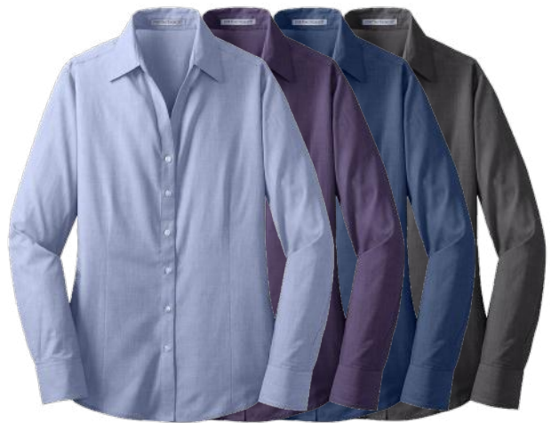
PORT AUTHORITY Ladies Crosshatch Easy Care Shirt L640 Women's Sizes: XS-4XL | 4 colors