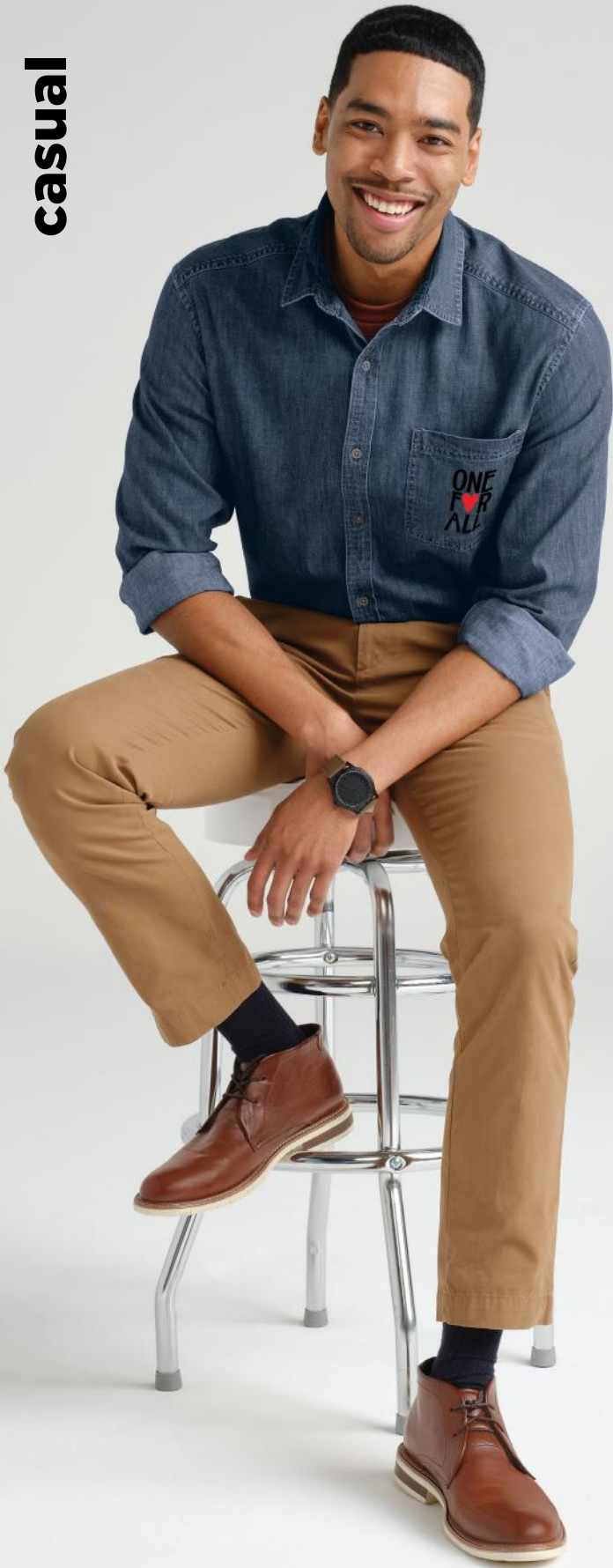
PORT AUTHORITY Long Sleeve Perfect Denim Shirt W676 Adult Sizes: XS-4XL | 2 colors