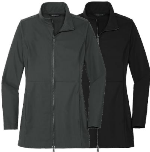
MERCER + METTLE Women's Faillie Soft Shell MM7101 Women's Sizes: XS-4XL | 2 colors