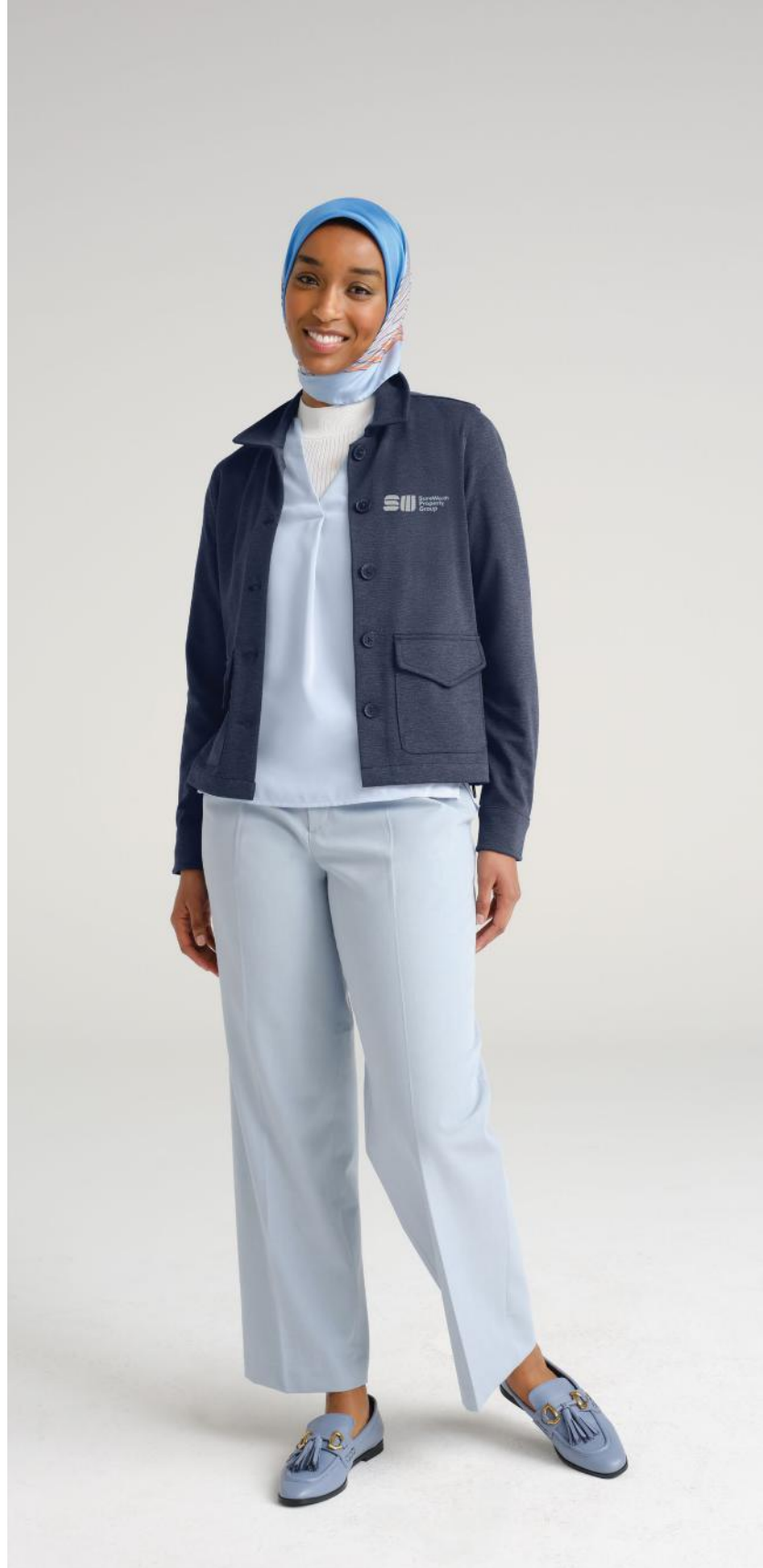
BROOKS BROTHERS Women's Mid-Layer Stretch Button Jacket BB18205 Women's Sizes: XS-4XL | 3 colors Worn with BB18009