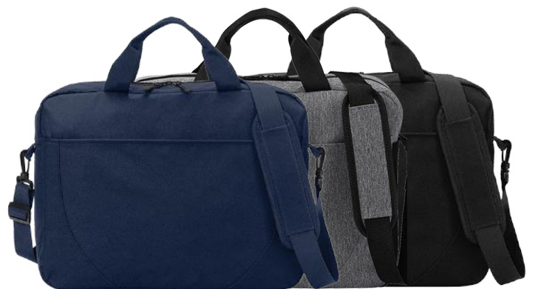
PORT AUTHORITY Access Briefcase BG318 3 colors