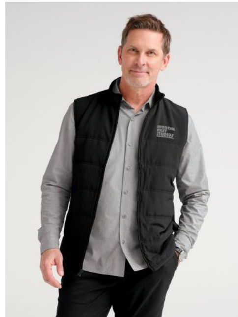
TRAVIS MATHEW Cold Bay Vest TM1MW453 Adult Sizes: S-3XL | 2 colors Worn with MM2000