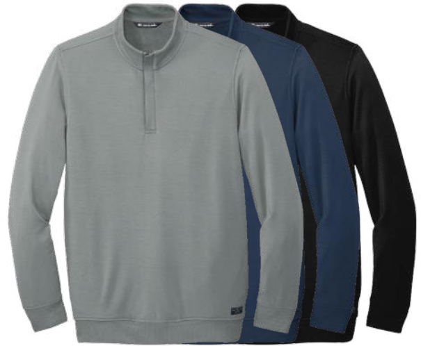
TRAVIS MATHEW Newport 1/4-Zip Fleece TM1MU419 Adult Sizes: S-3XL | 3 colors