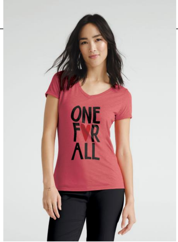
DISTRICT Women's Perfect Tri V-Neck Tee DM1350L Women's Sizes: XS-4XL | 23 colors