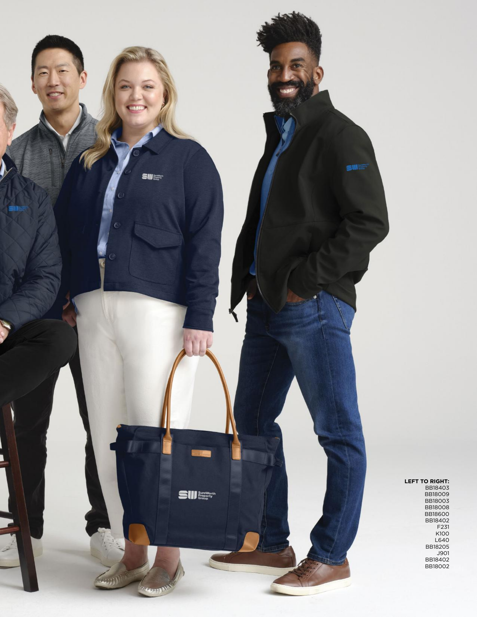
LEFT TO RIGHT: BB18403 BB18009 BB18003 BB18008 BB18600 BB18402 F231 K100 L640 BB18205 J901 BB18402 BB18002