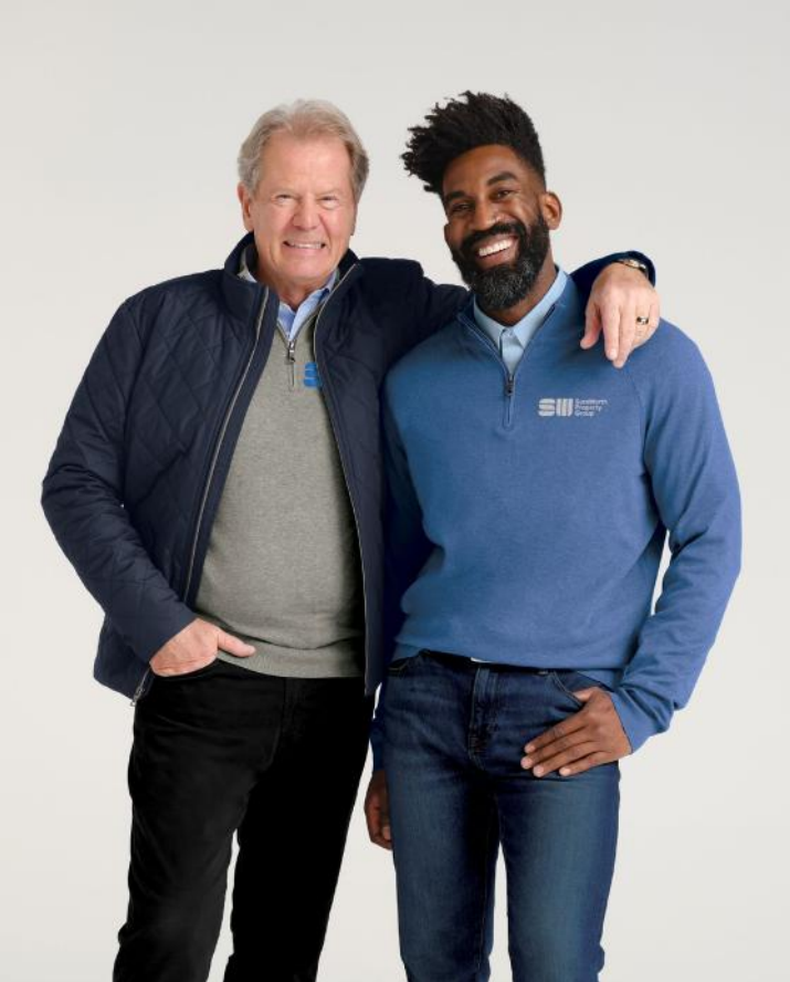
BROOKS BROTHERS Cotton Stretch 1/4-Zip Sweater BB18402 Adult Sizes: XS-4XL | 4 colors