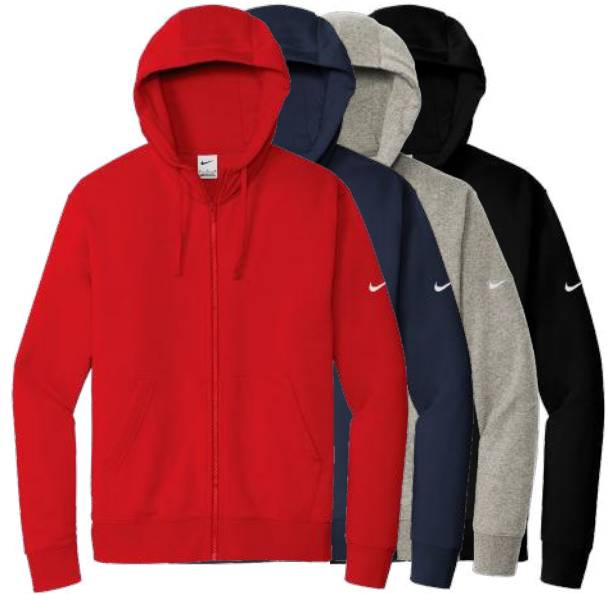
NIKE Club Fleece Sleeve Swoosh Full-Zip Hoodie NKDR1513 Adult Sizes: XS-4XL | 6 colors