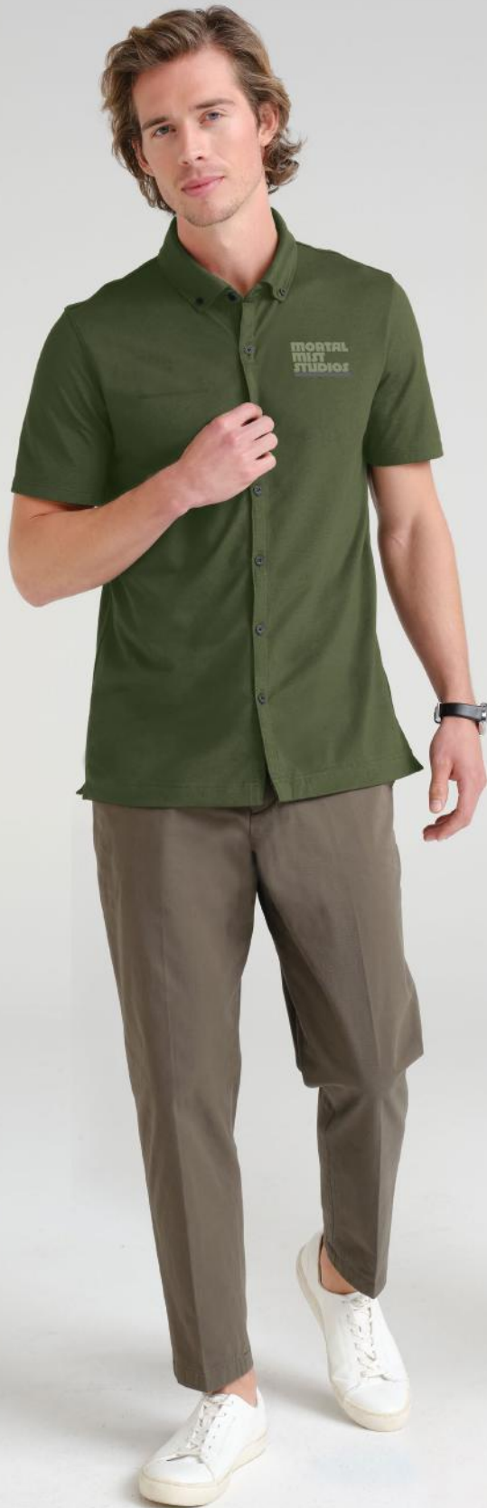
MERCER + METTLE Stretch Pique Full-Button Polo MM1006 Adult Sizes: XS-4XL | 7 colors