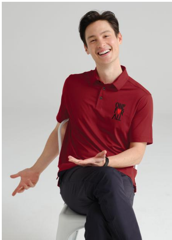
PORT AUTHORITY City Stretch Polo K682 Adult Sizes: XS-4XL | 6 colors