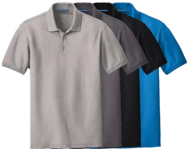
PORT AUTHORITY Core Classic Pique Polo K100 Adult Sizes: XS-6XL | 12 colors