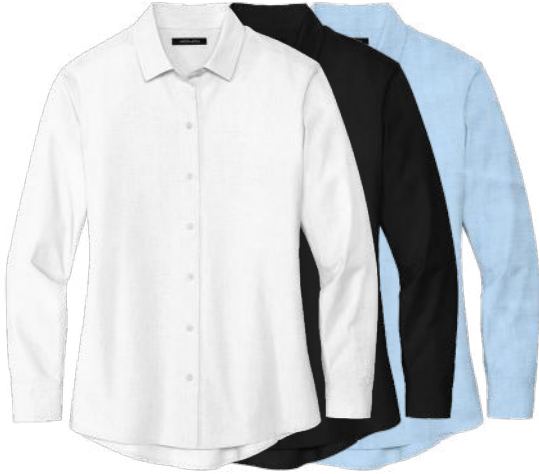
MERCER + METTLE Women's Long Sleeve Stretch Woven Shirt MM2001 Women's Sizes: XS-4XL | 4 colors