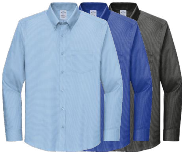
BROOKS BROTHERS Wrinkle Free Stretch Nailhead Shirt BB18002 Adult Sizes: XS-4XL | 6 colors