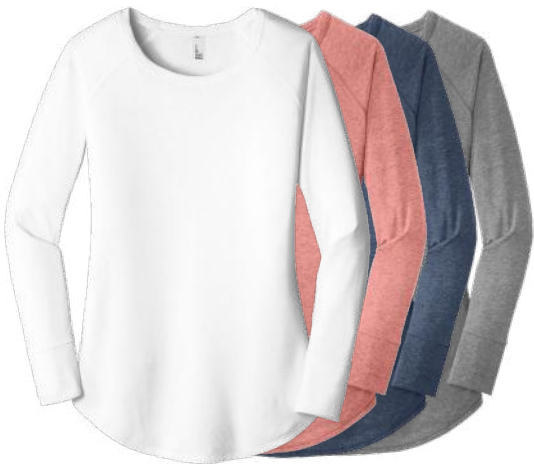
DISTRICT Women's Perfect Tri Long Sleeve Tunic Tee DT132L Women's Sizes: XS-4XL | 5 colors

Uplift the whole team with outfits that speak to a cohesive vision, a laid-back attitude and a clear focus on accomplishing great work together.