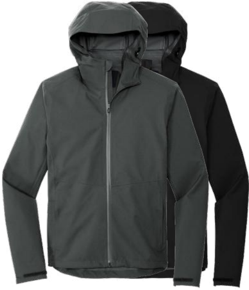
MERCER + METTLE Waterproof Rain Shell MM7000 Adult Sizes: XS-4XL | 2 colors