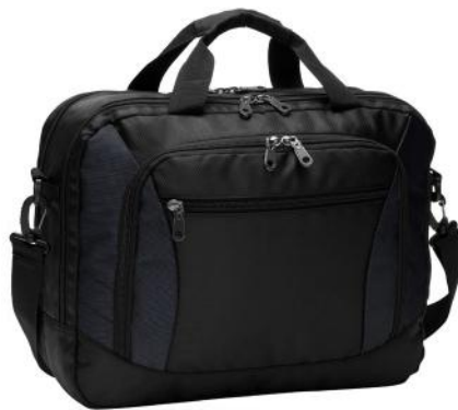
PORT AUTHORITY Commuter Brief BG307 1 color