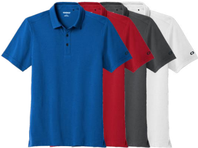
OGIO Limit Polo OG138 Adult Sizes: XS-4XL | 6 colors