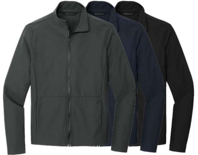
MERCER + METTLE Faillie Soft Shell MM7100 Adult Sizes: XS-4XL | 3 colors