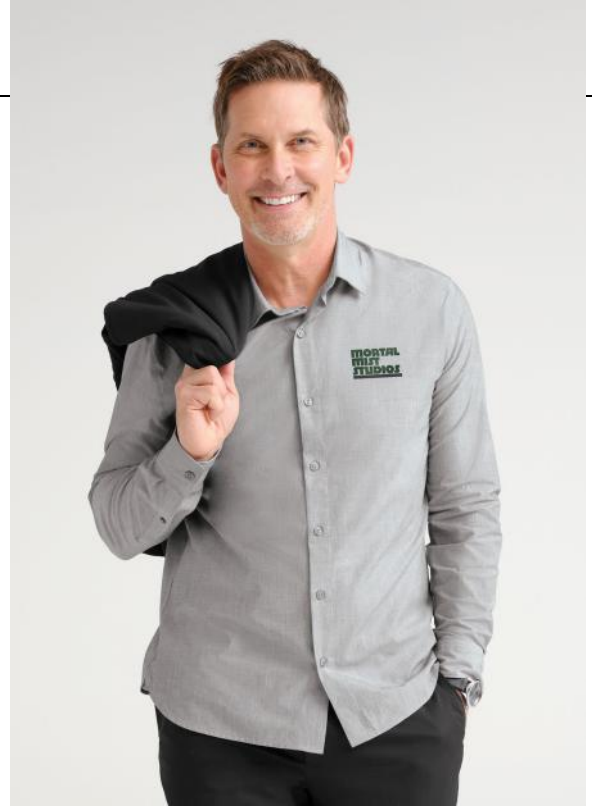
MERCER + METTLE Long Sleeve Stretch Woven Shirt MM2000 Adult Sizes: XS-4XL | 7 colors Worn with TM1MW453