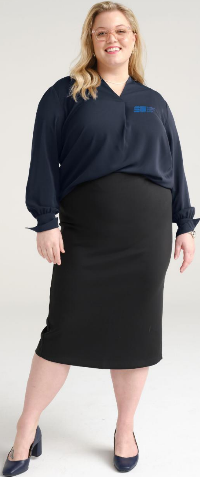
BROOKS BROTHERS Women's Open-Neck Satin Blouse BB18009 Women's Sizes: XS-4XL | 4 colors

Buttoned-up should not mean boring. A true classic look brings the team together with a sense of professionalism and pride.