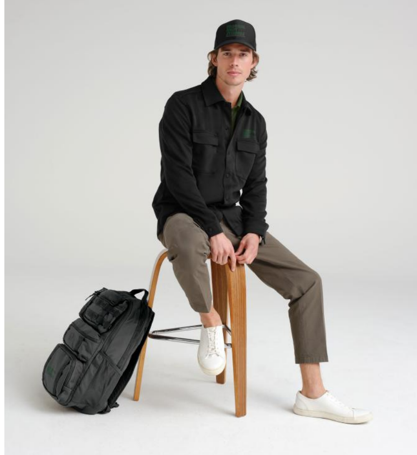
OGIO Utilitarian Modular Pack 91018 2 colors