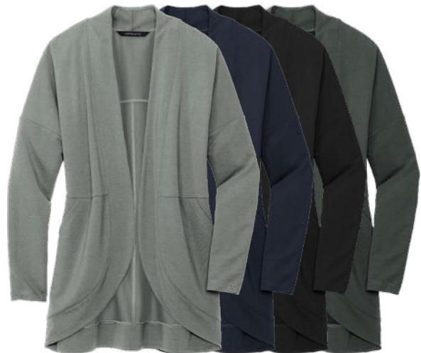
MERCER + METTLE Women's Stretch Open-Front Cardigan MM3015 Women's Sizes: XS-4XL | 4 colors