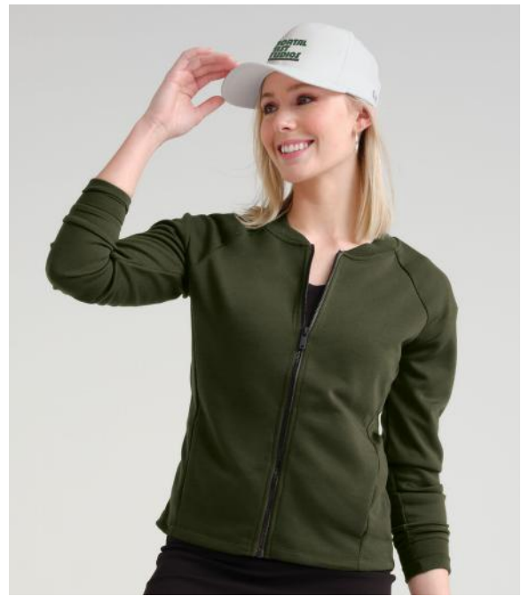
MERCER + METTLE Women's Double-Knit Bomber MM3001 Women's Sizes: XS-4XL | 4 colors Worn with TM1MU426

One size rarely fits all. A modern look represents a cohesive group that gives each member of the team the room to be themselves.