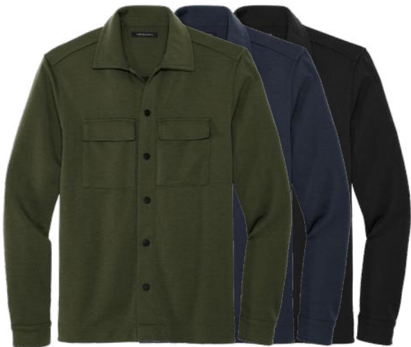
MERCER + METTLE Double-Knit Snap Front Jacket MM3004 Adult Sizes: XS-4XL | 3 colors