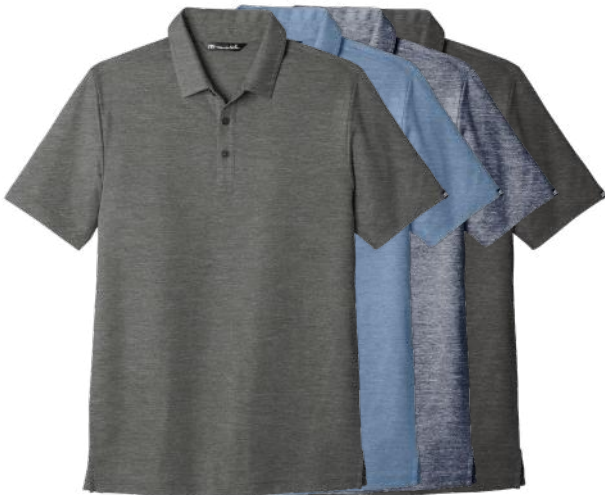
TRAVISMATHEW Oceanside Heather Polo TM1MU412 Adult Sizes: S-3XL | 8 colors