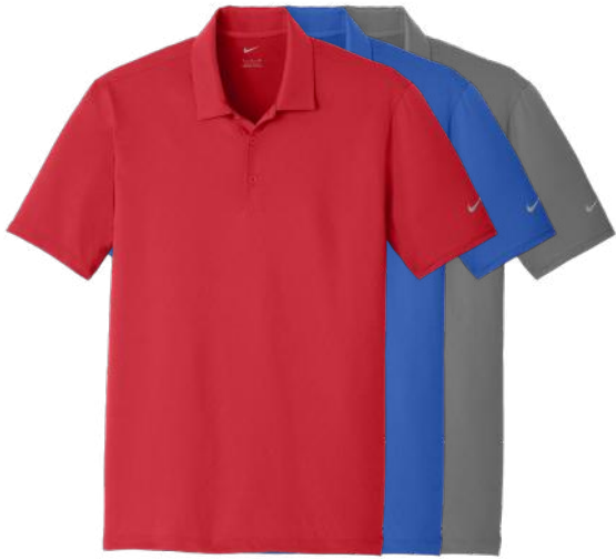
NIKE Dri-FIT Legacy Polo 883681 Adult Sizes: XS-4XL | 6 colors