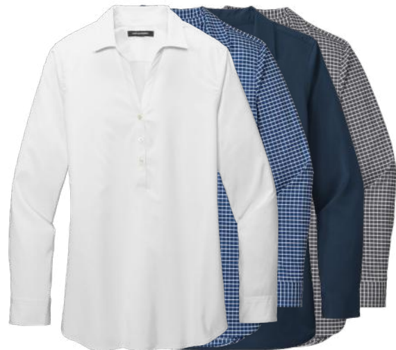
PORT AUTHORITY Ladies City Stretch Tunic LW680 Women's Sizes: XS-4XL | 5 colors