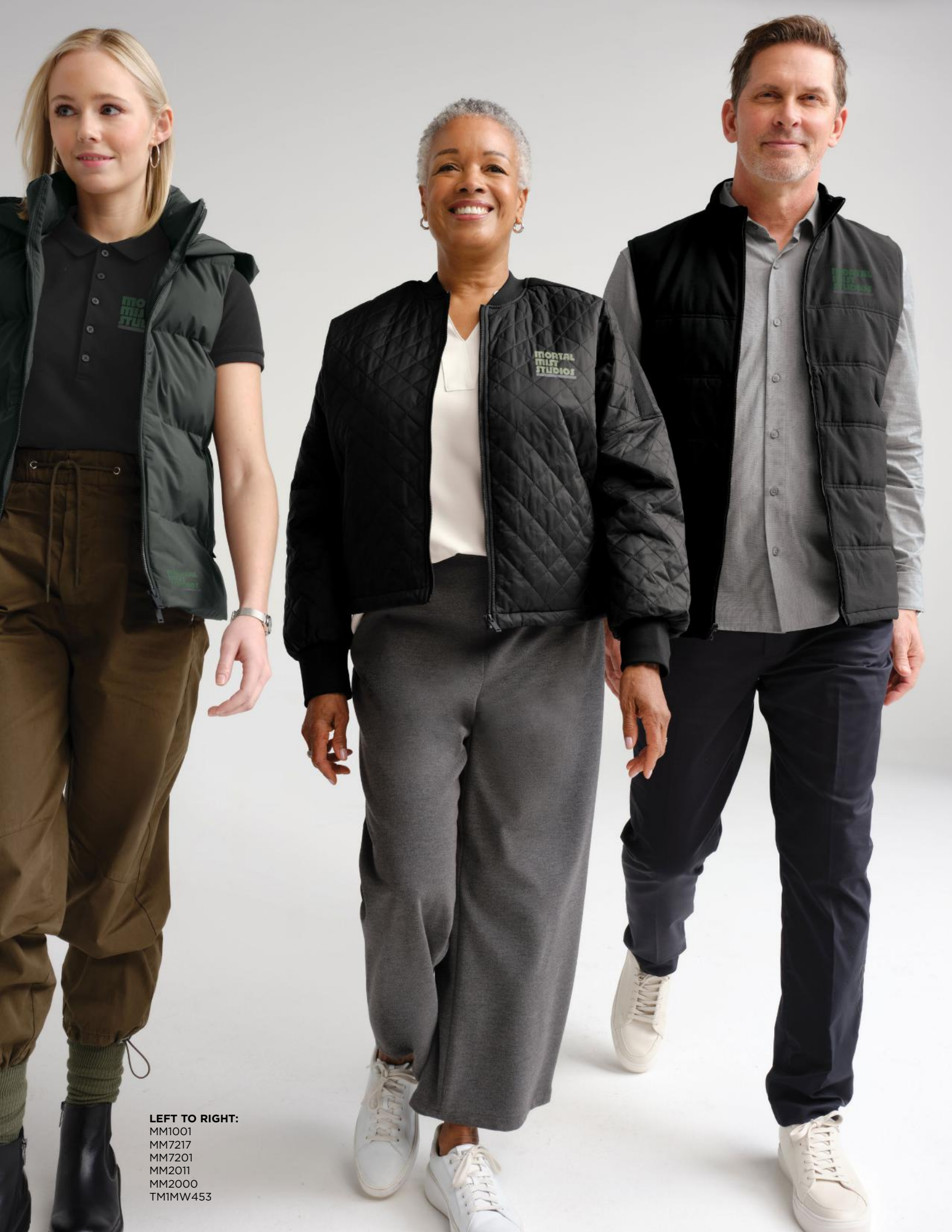
LEFT TO RIGHT: MM1001 MM7217 MM7201 MM2011 MM2000 TMIMW453