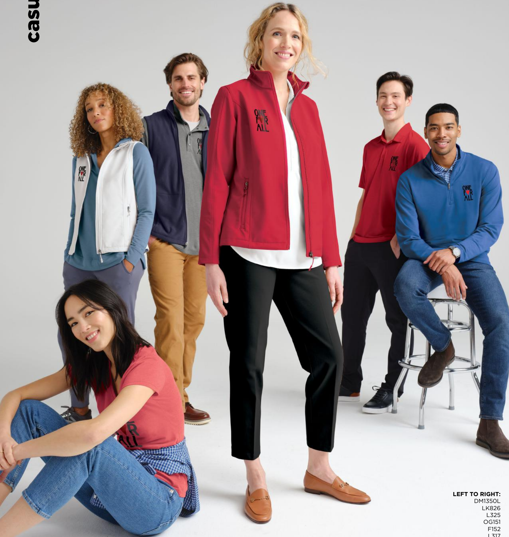
LEFT TO RIGHT: DM1350L LK826 L325 OG151 F152 L317 LW680 883681 K825 W680