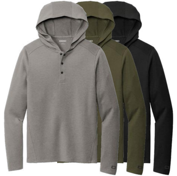
OGIO Luuma Flex Hooded Henley OG826 Adult Sizes: XS-4XL | 3 colors