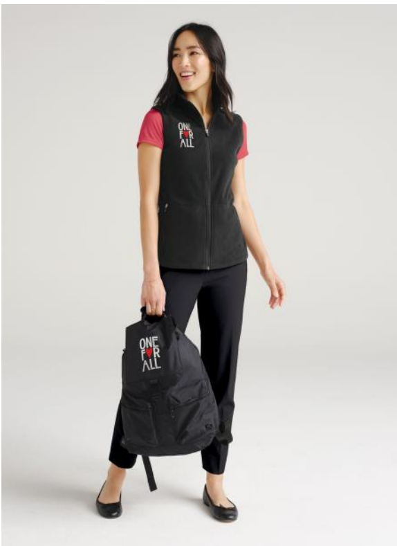
OGIO Evolution Pack 91015 4 colors