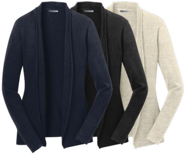
PORT AUTHORITY Ladies Open Front Cardigan Sweater LSW289 Women's Sizes: XS-4XL | 4 colors