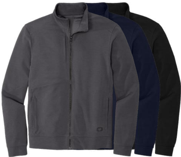
OGIO Hinge Full-Zip OG820 Adult Sizes: XS-4XL | 3 colors