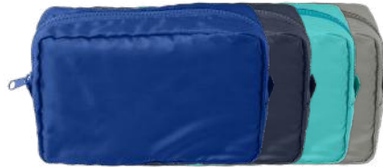
PORT AUTHORITY Stash Dimensional Pouch BG916 6 colors