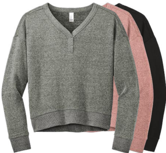
DISTRICT Ladies Perfect Tri Fleece V-Neck Sweatshirt DT1312 Women's Sizes: XS-4XL | 5 colors