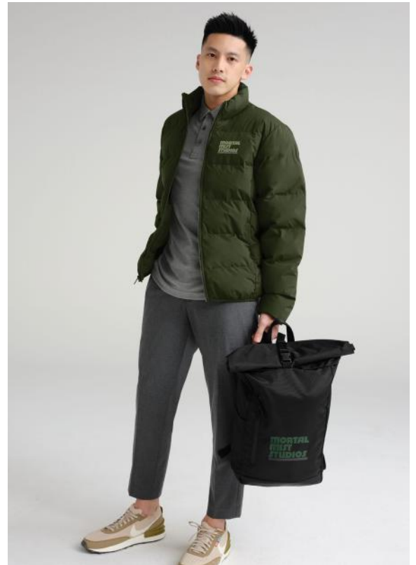
MERCER + METTLE Rucksack MMB201 One Size Fits All | 1 color Worn with TM1MU412, MM7210