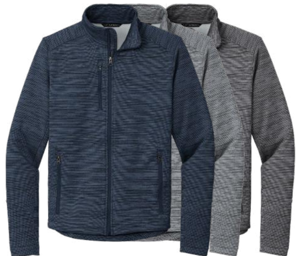
PORT AUTHORITY Digi Stripe Fleece Jacket F231 Adult Sizes: XS-4XL | 3 colors