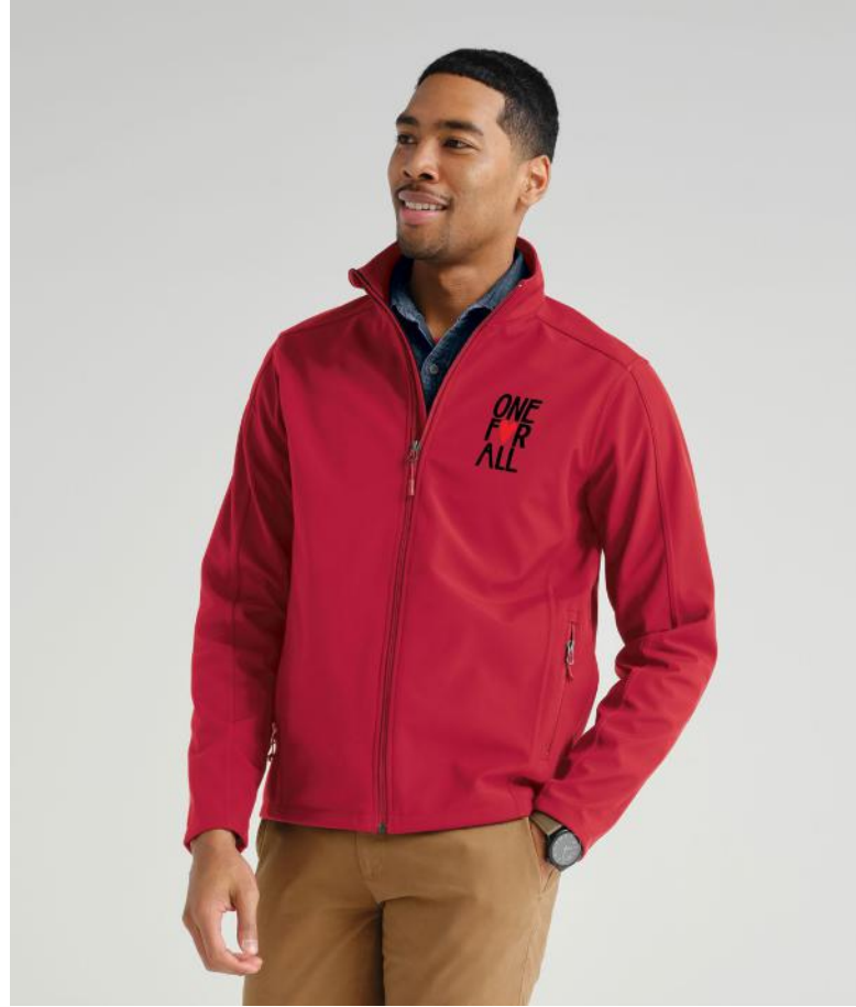
PORT AUTHORITY Core Soft Shell Jacket J317 Adult Sizes: XS-6XL | 11 colors Worn with W676