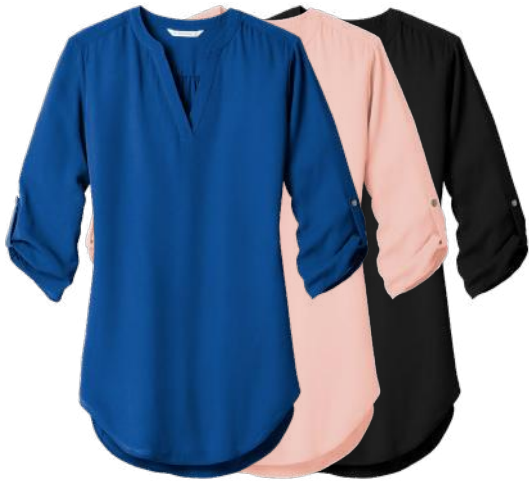
PORT AUTHORITY Ladies 3/4-Sleeve Tunic Blouse LW701 Women's Sizes: XS-4XL | 8 colors

Uplift the whole team with outfits that speak to a cohesive vision, a laid-back attitude and a clear focus on accomplishing great work together.