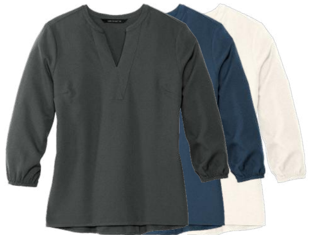
MERCER + METTLE Women's Stretch Crepe 3/4-Sleeve Blouse MM2011 Women's Sizes: XS-4XL | 5 colors