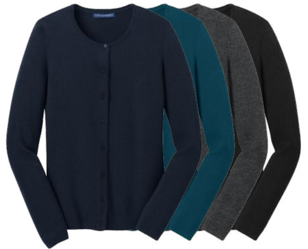
PORT AUTHORITY Ladies Cardigan Sweater LSW287 Women's Sizes: XS-4XL | 3 colors