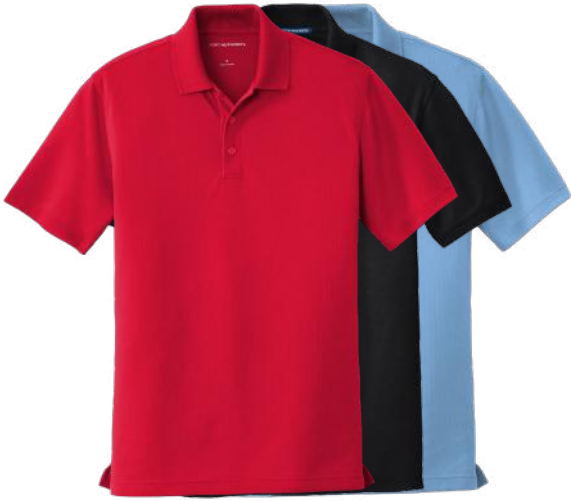
PORT AUTHORITY Dry Zone UV Micro-Mesh Polo K110 Adult Sizes: XS-6XL | 16 colors