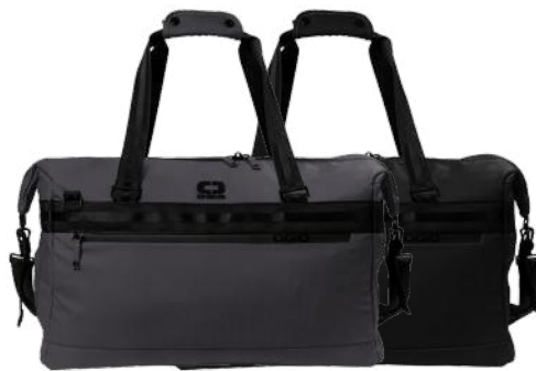
OGIO Commuter Duffel 411098 2 colors