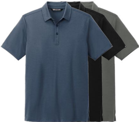
TRAVISMATHEW Bayfront Solid Polo TM1MY399 Adult Sizes: S-3XL | 4 colors