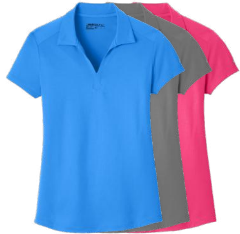
NIKE Ladies Dri-FIT Legacy Polo 838957 Women's Sizes: XS-2XL | 6 colors