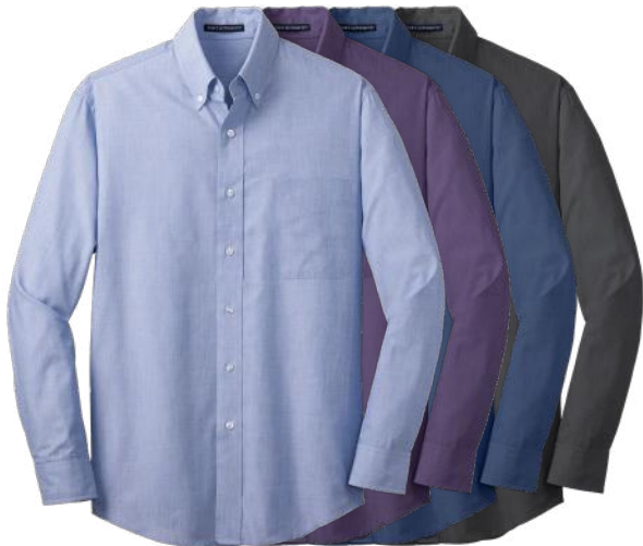
PORT AUTHORITY Crosshatch Easy Care Shirt S640 Adult Sizes: XS-4XL | 4 colors