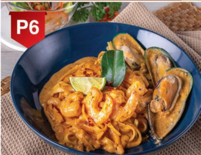
Linguine Creamy Tomyam RM 21.90

Our signature linguine creamy tomyam is a tantalizing pasta dish that brings together the creamy richness of Italian pasta with the bold and spicy flavours of tomyam. Al dente linguine pasta is tossed in a rich and creamy white sauce and spiked with a generous amount of tomyam paste for a touch of heat. Juicy and plump prawns and mussels add a briny and sweet contrast to the spicy and creamy sauce.