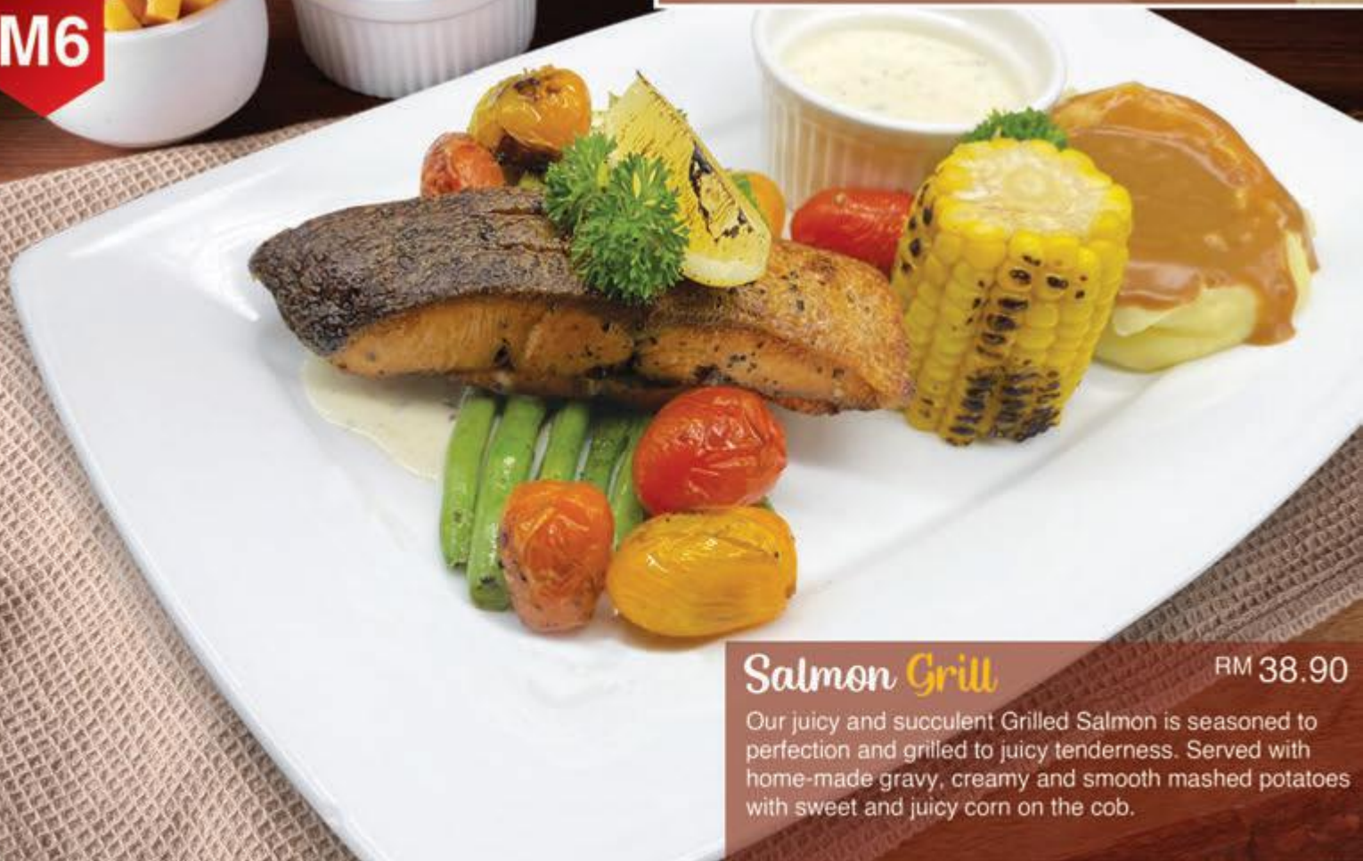
Salmon Grill RM 38.90

Our juicy and succulent Grilled Salmon is seasoned to perfection and grilled to juicy tenderness. Served with home-made gravy, creamy and smooth mashed potatoes with sweet and juicy corn on the cob.