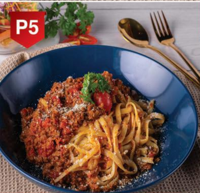
Spaghetti Bolognese RM 19.90

Our Spaghetti Bolognese is a hearty and satisfying pasta dish that brings together tender linguine pasta, juicy and flavourful minced beef, fragrant Italian herbs, and rich and tangy tomato paste.