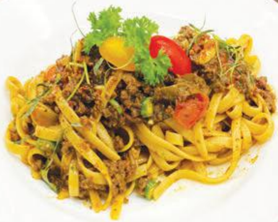
Kam Heong Linguine RM 22.00

Our Kam Heong Linguine is made with perfectly cooked linguine pasta and tossed with a fragrant and flavourful special Kam Heong sauce which a blend of curry leaf, dried shrimps and citrus hystrix leaf with ground beef which give it a unique and asian authentic flavour.