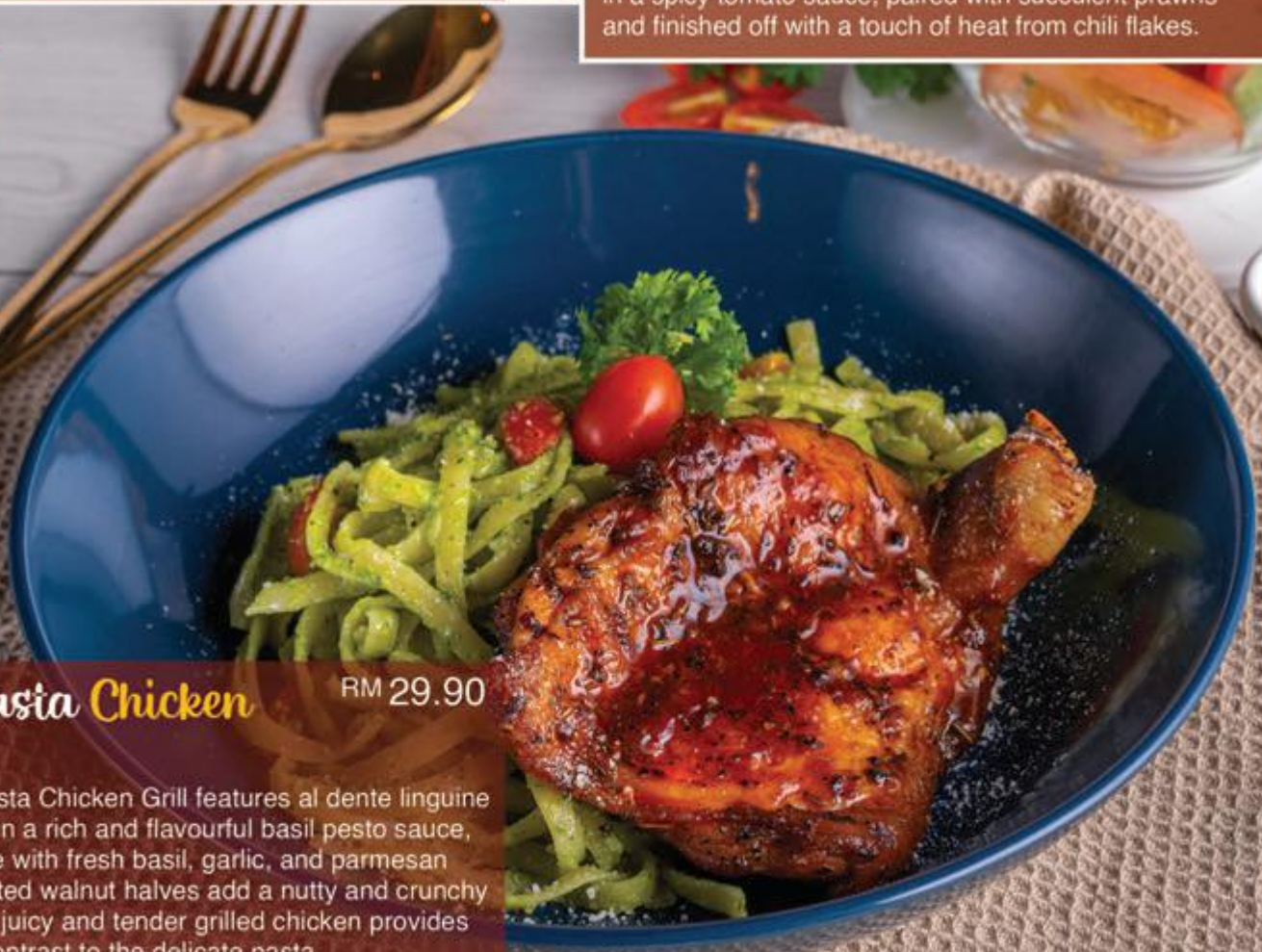
Pesto Pasta Chicken Grill RM 29.90

Our Pesto Pasta Chicken Grill features al dente linguine pasta tossed in a rich and flavourful basil pesto sauce, which is made with fresh basil, garlic, and parmesan cheese. Toasted walnut halves add a nutty and crunchy texture, while juicy and tender grilled chicken provides a satisfying contrast to the delicate pasta.