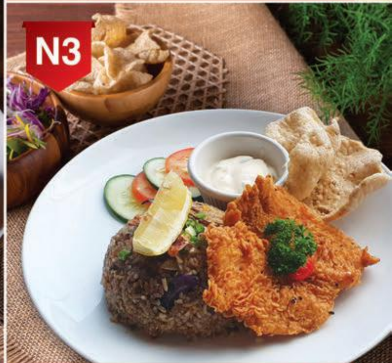
Nasi Goreng Deep Crispy Dory RM 19.90

Our Nasi Goreng Deep Fried Dory is a generous serving of fluffy fried rice, mixed with a touch of spicy sambal paste, and topped with a crispy Deep-fried Dory Fish which is expertly seasoned and fried to golden perfection.