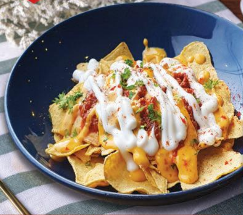
Nachos With Bolognese Sause RM 15.90