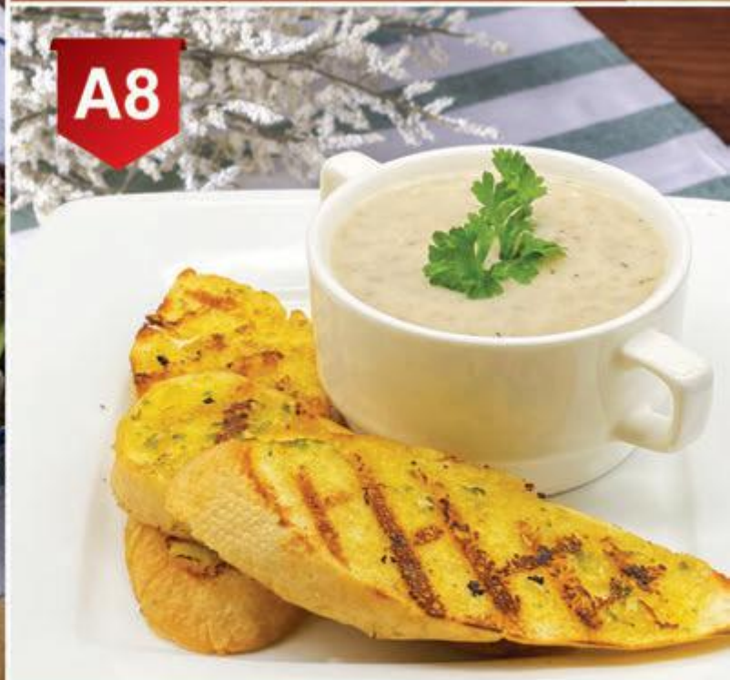
Home Made Mushroom Soup With Garlic