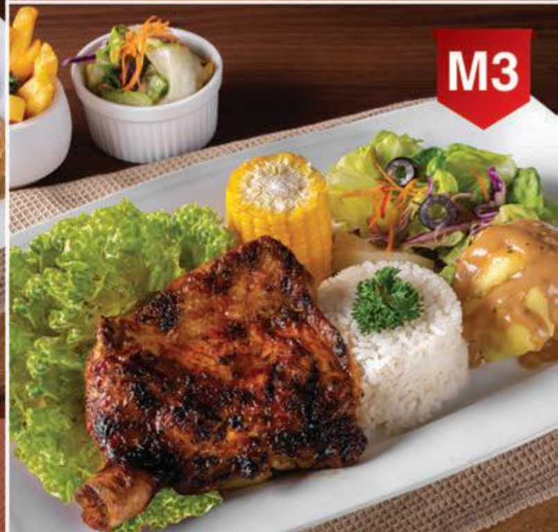
Grilled Chicken Chop RM 24.90

Our juicy and tender Grilled Chicken Chop is seasoned to perfection and grilled to juicy tenderness. Served with a side of fluffy and buttery rice, fresh and crisp salad, sweet and juicy corn on the cob with creamy and smooth mashed potatoes.