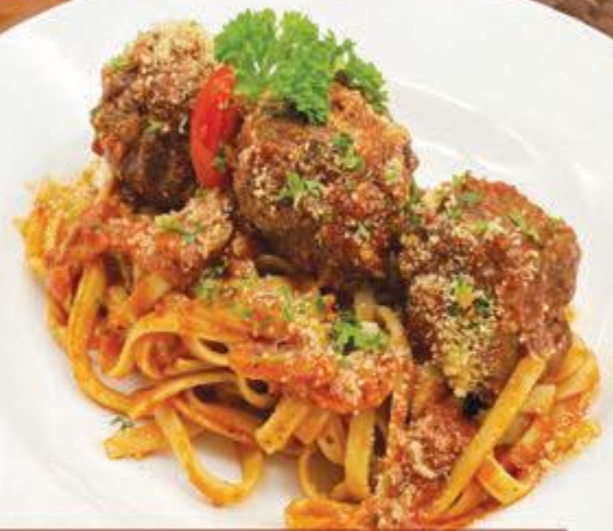
Linguine Polpette RM 23.90

Our Meat Balls Polpette is a classic Italian dish made with perfectly seasoned ground beef meatballs and served over a bed of al dente linguine pasta tossed in a light and flavourful sauce made with fresh tomatoes, garlic, and herbs. The home-made meatballs are made with a blend of ground beef, herbs, and spices, which are combined and rolled into a tender and juicy perfectly-sized balls.