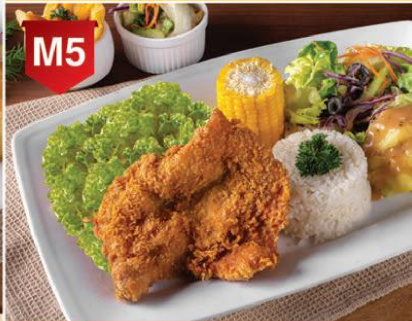
Deep Fried Chicken Chop RM 25.90

Our juicy and crispy Deep-fried Chicken Chop is seasoned to perfection and fried to golden crispiness. Served with a side of fluffy and buttery rice, fresh and crisp salad, sweet and juicy corn on the cob with creamy and smooth mashed potatoes.