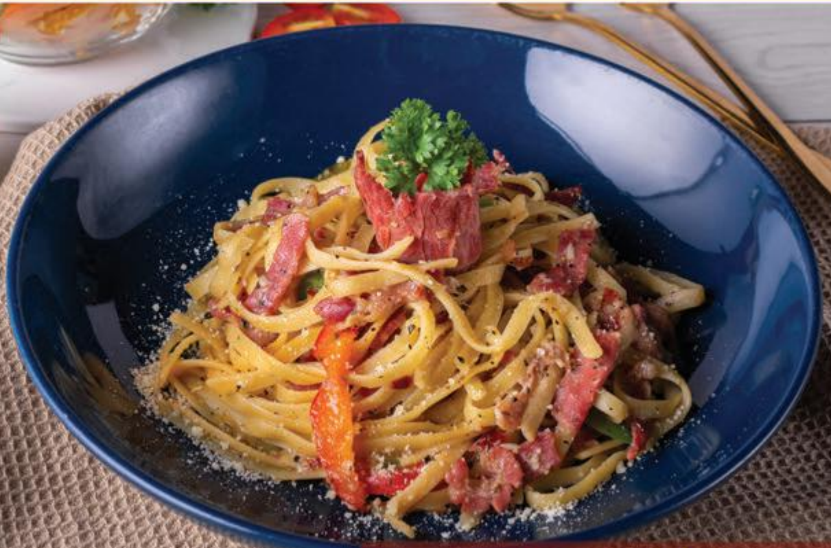
Linguine Aglio Olio Beef RM 21.90

Our linguine Aglio Olio Beef is a simple yet delectable combination of al dente linguine pasta, sweet and crunchy capsicums, fragrant Italian herbs, and smoky beef bacon. Enjoy this flavour-packed pasta feast today!