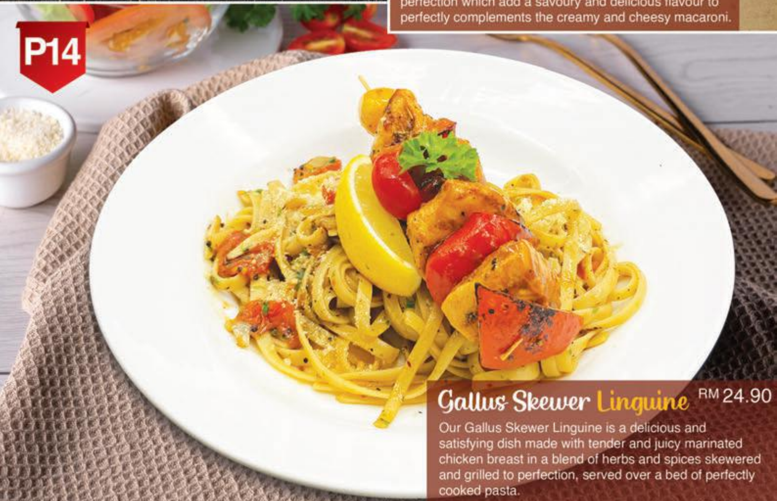
Gallus Skewer Linguine RM 24.90

Our Gallus Skewer Linguine is a delicious and satisfying dish made with tender and juicy marinated chicken breast in a blend of herbs and spices skewered and grilled to perfection, served over a bed of perfectly cooked pasta.