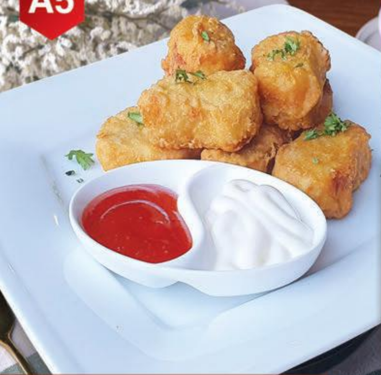
Chicken Tempura Nugget