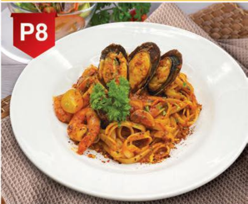
Linguine Carbonara Seafood RM 22.90

Indulge in the rich and savoury flavours of our Linguine Carbonara Seafood, featuring perfectly cooked linguine pasta coated in a creamy white sauce made with a blend of high-quality cream and parmesan cheese infused with just the right amount of garlic and black pepper, this dish is elevated with the addition of prawns that add a delicious sweetness to the dish and tender, briny mussels.