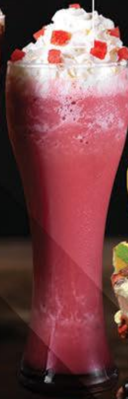
F9 Melon Bubblegum Latte Frappe