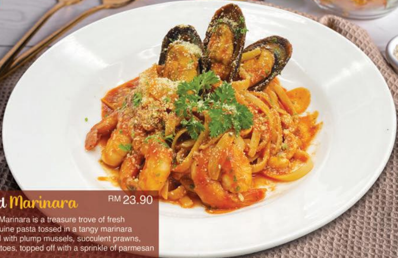
Seafood Marinara RM 23.90

Our Seafood Marinara is a treasure trove of fresh seafood! Linguine pasta tossed in a tangy marinara sauce, loaded with plump mussels, succulent prawns, and ripe tomatoes, topped off with a sprinkle of parmesan cheese.