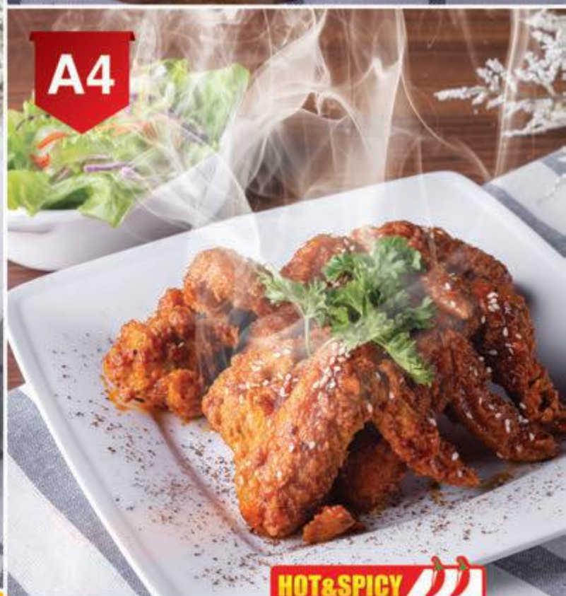
Buffalo Wing Hot & Spicy