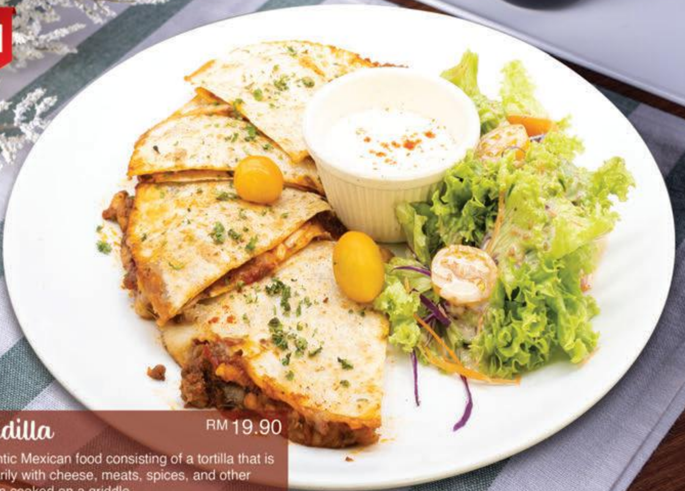
Quesadilla RM 19.90

The authentic Mexican food consisting of a tortilla that is filled primarily with cheese, meats, spices, and other fillings. then cooked on a griddle.