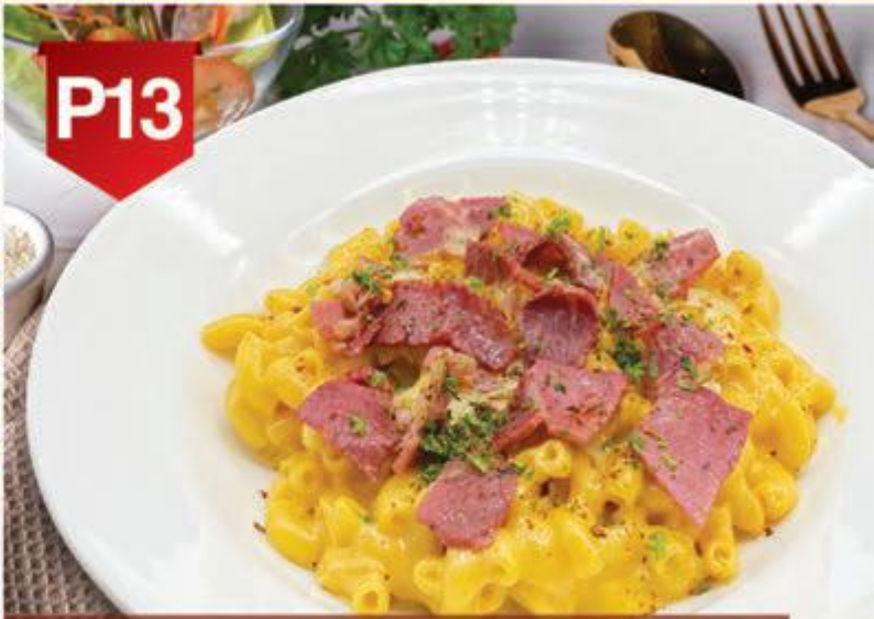
Macaroni And Cheese RM 19.90 with Beef Strips

Our Macaroni and Cheese with Beef Strips is all-time favourite dish made with perfectly cooked macaroni pasta and smothered in a rich and creamy cheese sauce with tender and flavourful beef strips that are cooked to perfection which add a savoury and delicious flavour to perfectly complements the creamy and cheesy macaroni.