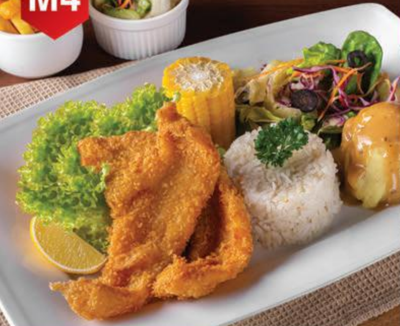
Deep Fried Dorry Fish RM 23.90

Our succulent and crispy Deep-fried Dorry Fish is expertly seasoned and fried to golden perfection. Served with a side of fluffy and buttery rice, fresh and crisp salad, sweet and juicy corn on the cob with creamy and smooth mashed potatoes.