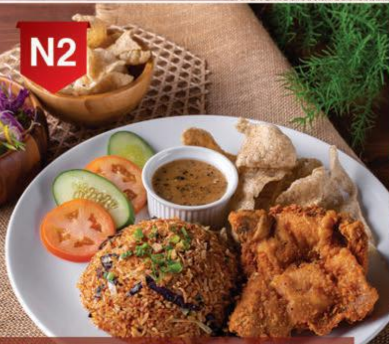
Nasi Goreng Crispy Chicken RM 20.90

Experience the fusion of East and West with our Nasi Goreng Crispy Chicken! A generous serving of fluffy fried rice, mixed with a touch of spicy sambal paste, and topped with a crisp and juicy deep fried chicken chop.