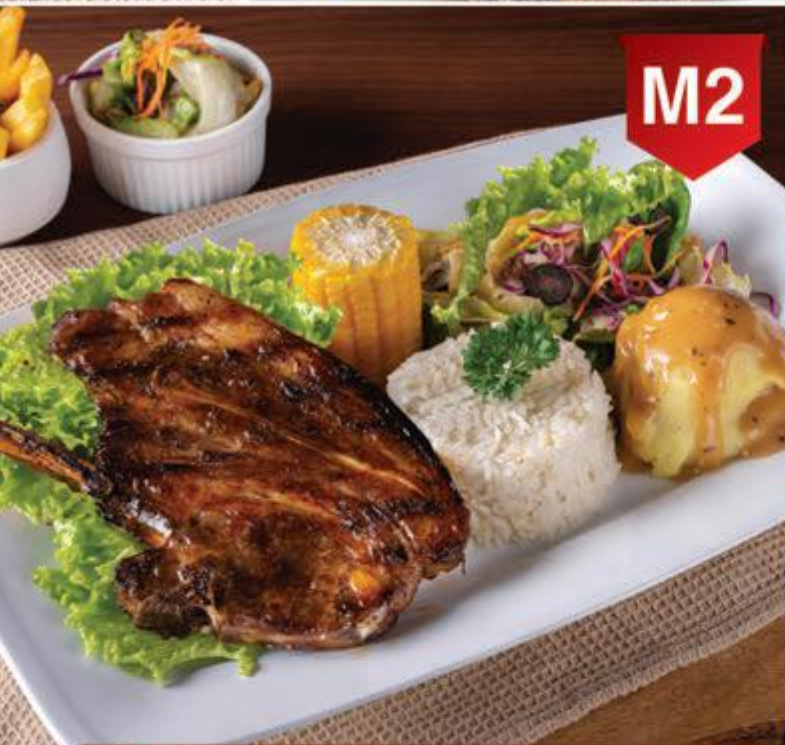
Grilled Lamb RM 33.90

Our juicy and tender Grilled Lamb is seasoned to perfection and grilled to juicy tenderness. Served with a side of fluffy and buttery rice, fresh and crisp salad, sweet and juicy corn on the cob with creamy and smooth mashed potatoes.