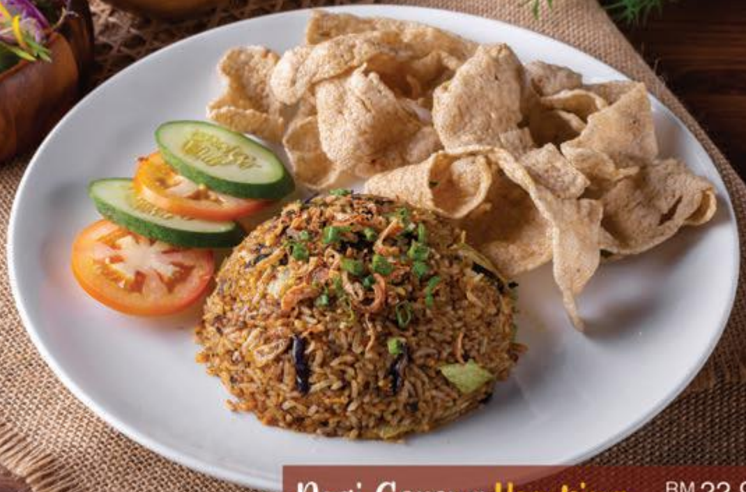
Nasi Goreng Kambing RM 22.90

Treat yourself to the aromatic and flavourful taste of our Nasi Goreng Kambing! This dish is made with a generous portion of tender and savoury fried rice, mixed with eggs, special paste and a homemade spicy mutton curry.