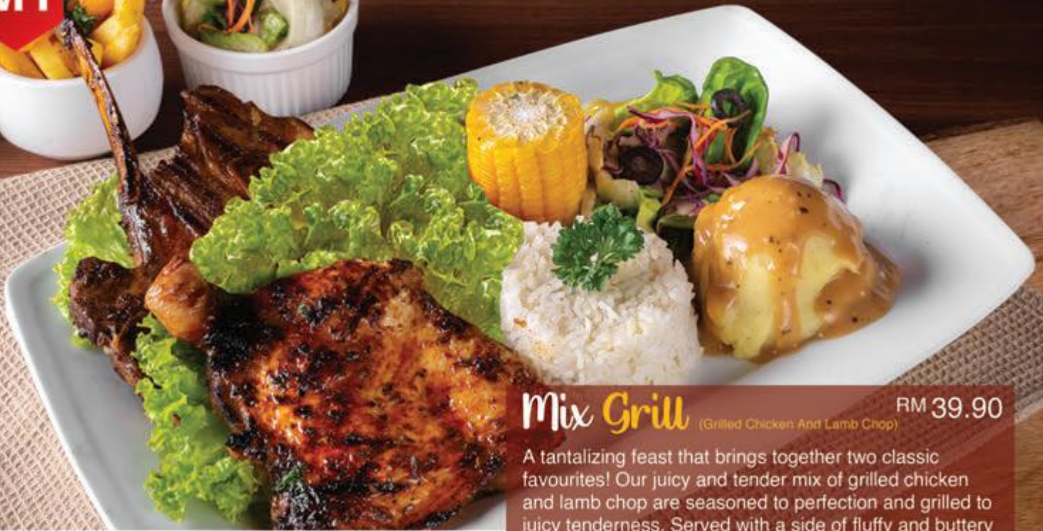
Mix Grill (Grilled Chicken And Lamb Chop) RM 39.90

A tantalizing feast that brings together two classic favourites! Our juicy and tender mix of grilled chicken and lamb chop are seasoned to perfection and grilled to juicy tenderness. Served with a side of fluffy and buttery rice, fresh and crisp salad, sweet and juicy corn on the cob with creamy and smooth mashed potatoes provide a satisfying contrast to the bold flavours of the chicken and lamb. Enjoy the best of both worlds today!