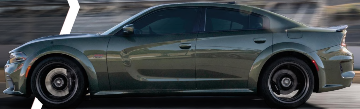
Photo may vary from actual unit.