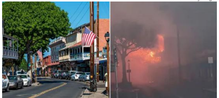
This is the same street corner in Lahaina before and after the fire.