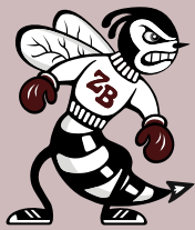
The new Zee-Bee logo

On August 17th, the school unveiled its newly designed logo, colors, and district seal. Look for more information about these changes in the next issue of the Stinger in October!