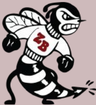
The previous Zee-Bee logo