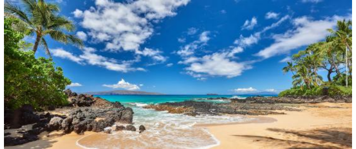
The island of Maui is renown for its natural tropical beauty.

For example, AP News reports that "across the United States, the number of acres burned by wildfires about tripled from the 1980s to now, with a drier climate from global warming a factor, according to the federal government's National Climate Assessment and the National Inter-agency Fire Center. In Hawaii, the burned area increased more than five times from the 1980s to now, according to figures from the University of Hawaii Manoa." Due to the dry climate, these fires are thriving and spreading faster as time goes on. (apnews.com)