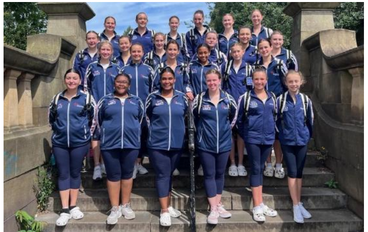
The Razzle Dazzles pose as a team in a park in Liverpool, England.