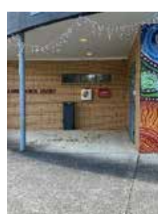
Hesse Rural Health 8 Gosney Street