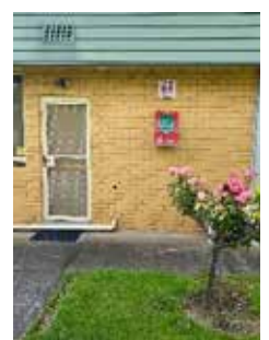
Senior Citizens 36 Harding Street