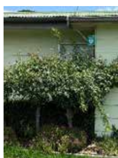
Winchelsea Golf Club 13 Anderson Street