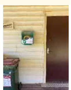
Wurdale Memorial Hall 220 Wurdale Road