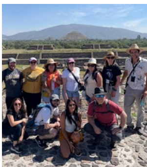
G-FLI participants explore the Jewish-Mexican culture

The Greensboro Federation Leadership Institute (G-FLI) centers on providing leadership opportunities to develop the next generation of the Greensboro Jewish community. Ten participants of the third G-FLI cohort spent 18 months engaging in immersive experiential education and graduated in June of this fiscal year.