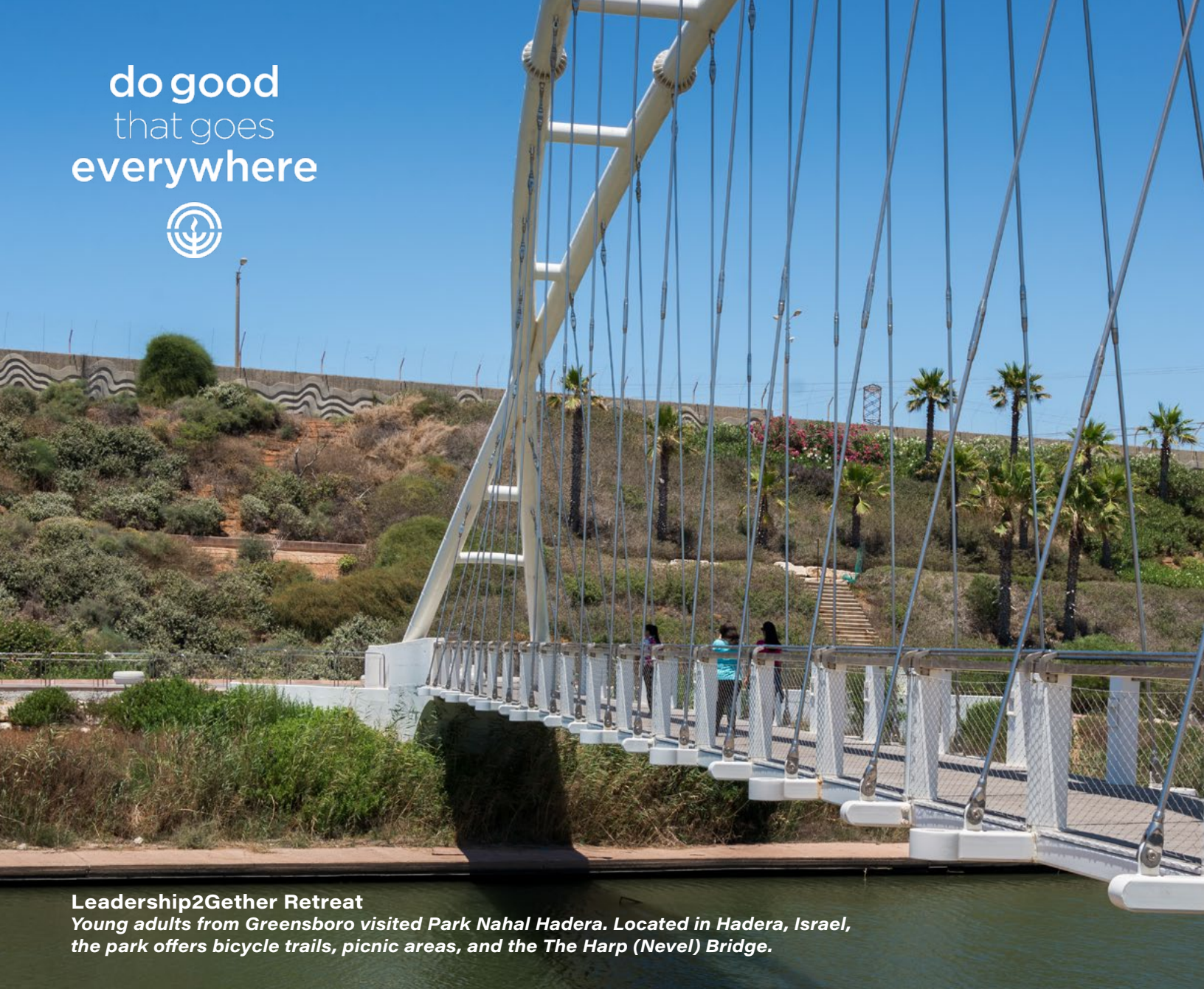
Leadership2Gether Retreat Young adults from Greensboro visited Park Nahal Hadera. Located in Hadera, Israel, the park offers bicycle trails, picnic areas, and the The Harp (Nevel) Bridge.