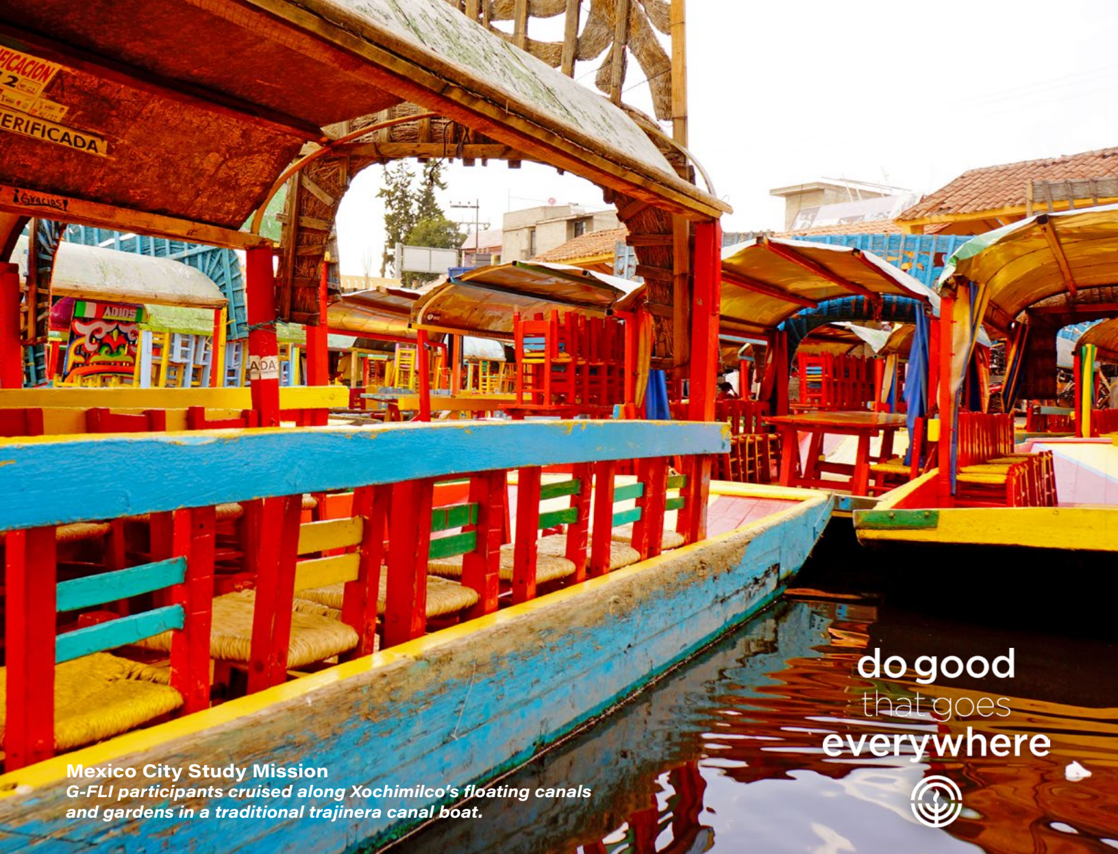
Mexico City Study Mission G-FLI participants cruised along Xochimilco's floating canals and gardens in a traditional trajinera canal boat.