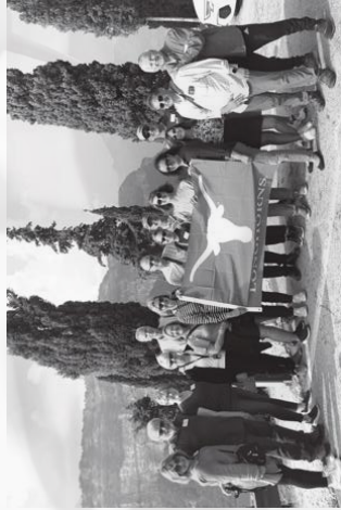
Texas Exes on Orbridge's Flavors of Northern Italy 2023 travel program.

PRSRT STD U.S. POSTAGE PAID PERMIT NO. 825 SAN DIEGO, CA