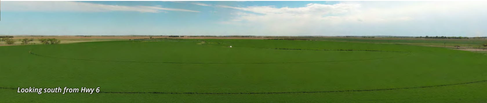
Looking south from Hwy 6