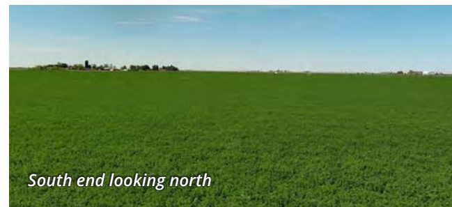
South end looking north