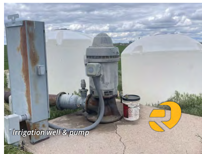
Irrigation well & pump