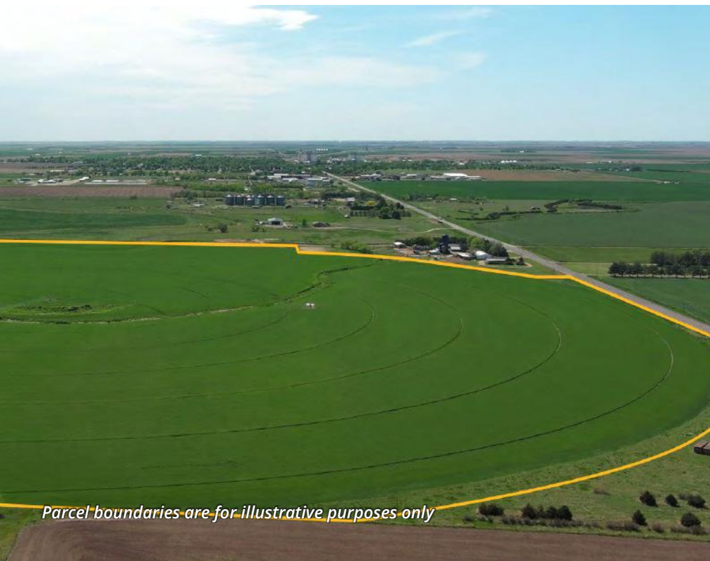
Parcel boundaries are for illustrative purposes only