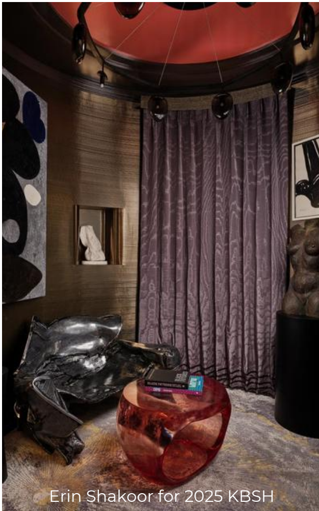
Erin Shakoor for 2025 KBSH

Interior Designer, Erin Shakoor, showed us a intriguing display of material and texture combinations in a powder room at this year's Kips Bay Decorators Show House, telling Veranda, "I want them to have a sense of curiosity and wonder and be inspired to look at things from a perspective of opposites, like, 'what would I normally do and what would be the opposite of that?'" However, the playful element extends beyond unexpected materials and custom finishes.