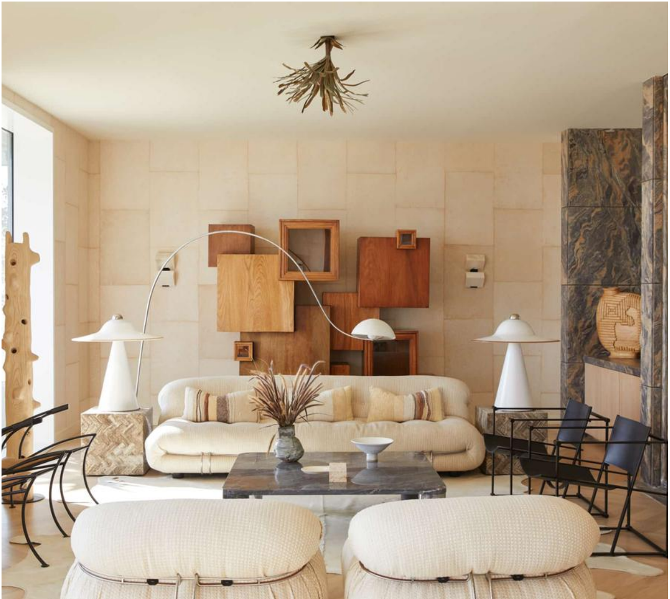
Kelly Wearstler, Malibu Beach