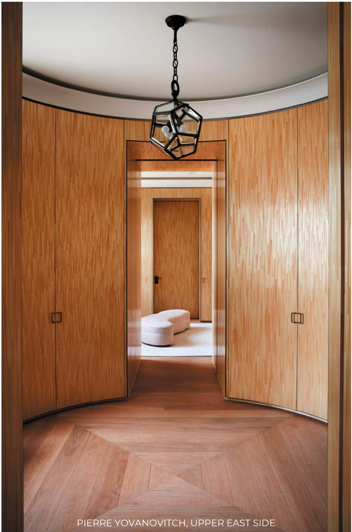
PIERRE YOVANOVITCH, UPPER EAST SIDE