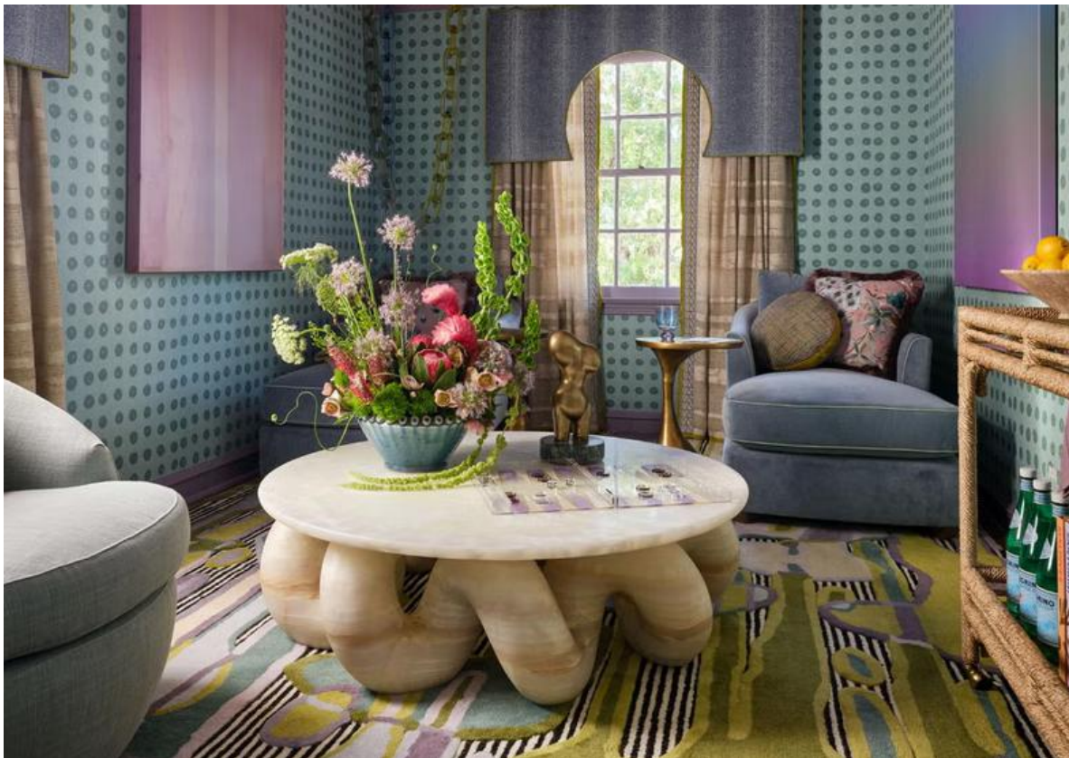
Marie Cloud for 2025 Kips Bay Show House in Palm Beach