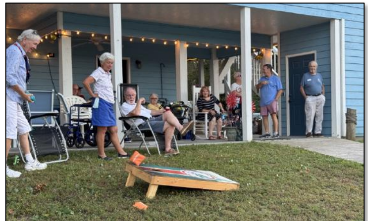
Of course, cornhole was played at the ABC-Charlotte Rendezvous dinner.