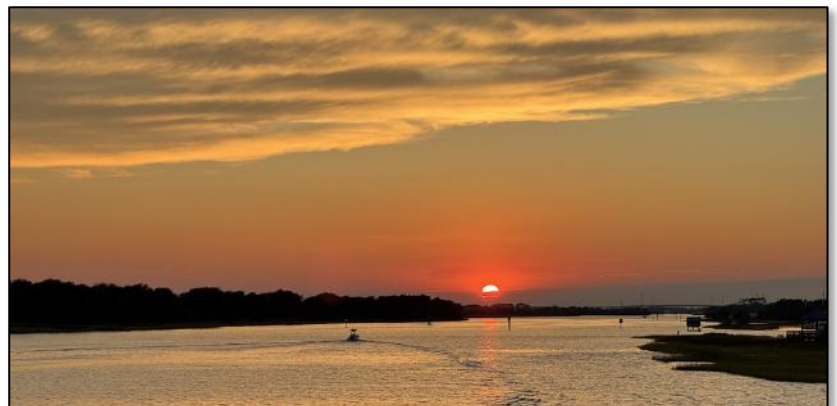
Sunset over the Intercoastal Waterway during the Rendezvous