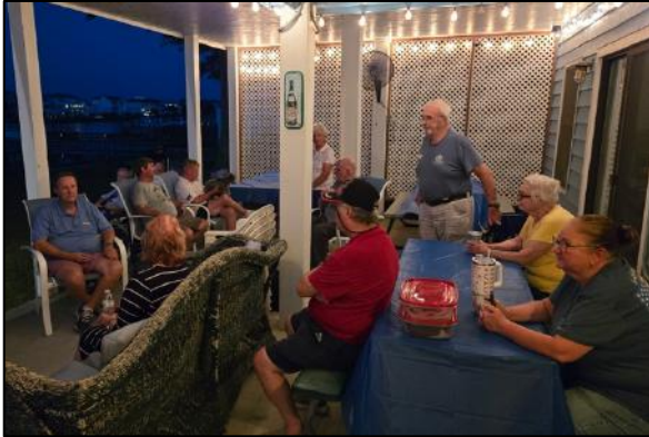
Night falls as Squadron members prepare for dinner at the Blue Crab Shack.