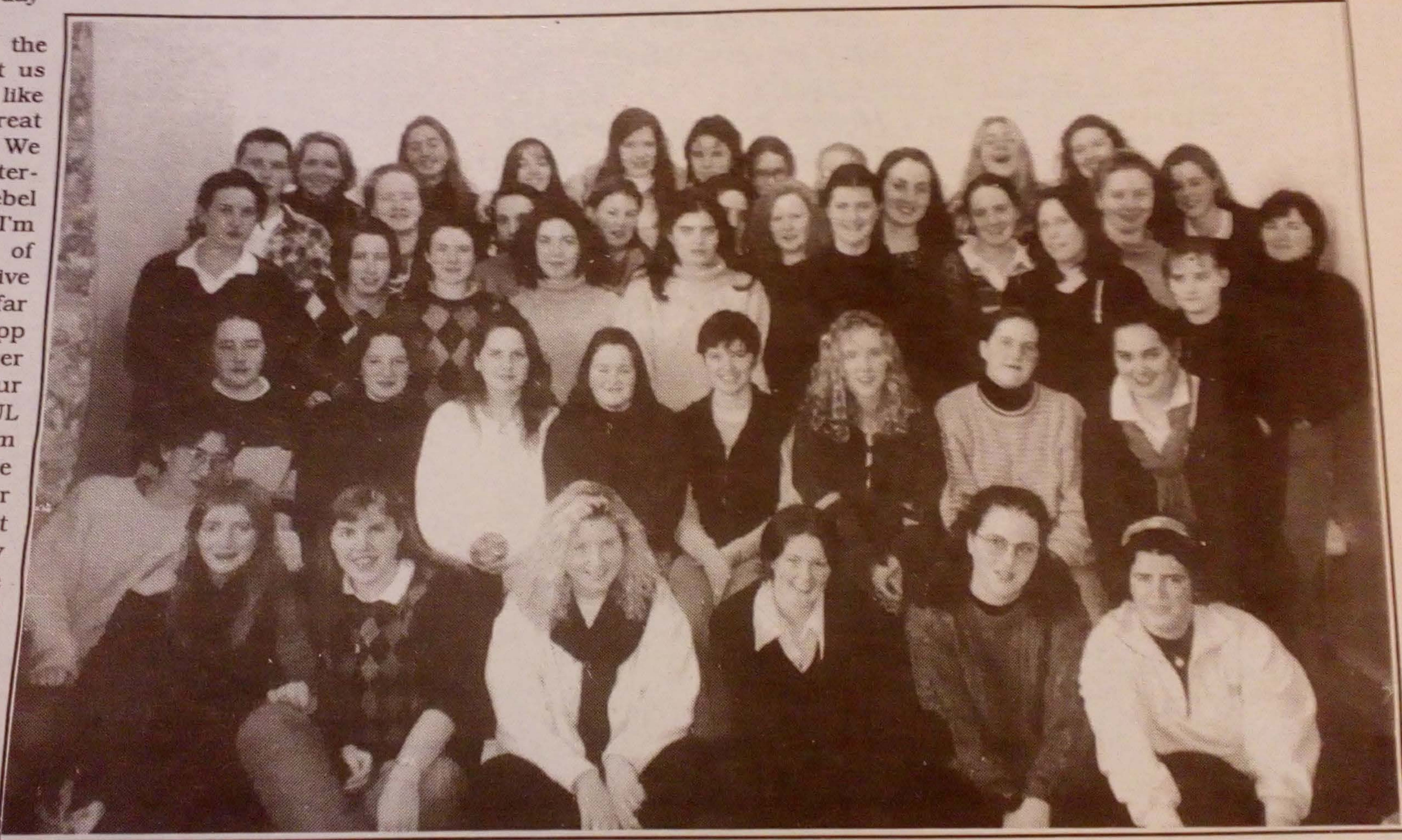
First UL class of Nurses

the ut us I like great We ster- rebel I'm e of tive far ipp ner our UL om he ur nt y e r e