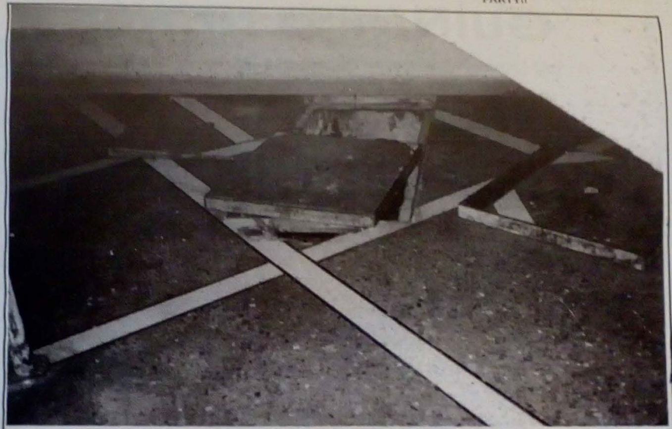
Classroom conditions for Nurses

cracked up to be either!) but alas no free accommodation. But thankfully, unlike "the old way" of training, we have weekends to ourselves, and how precious they are because unlike the rest of students in UL, we only have a weeks holidays- no summer jobs for us, no extra money!