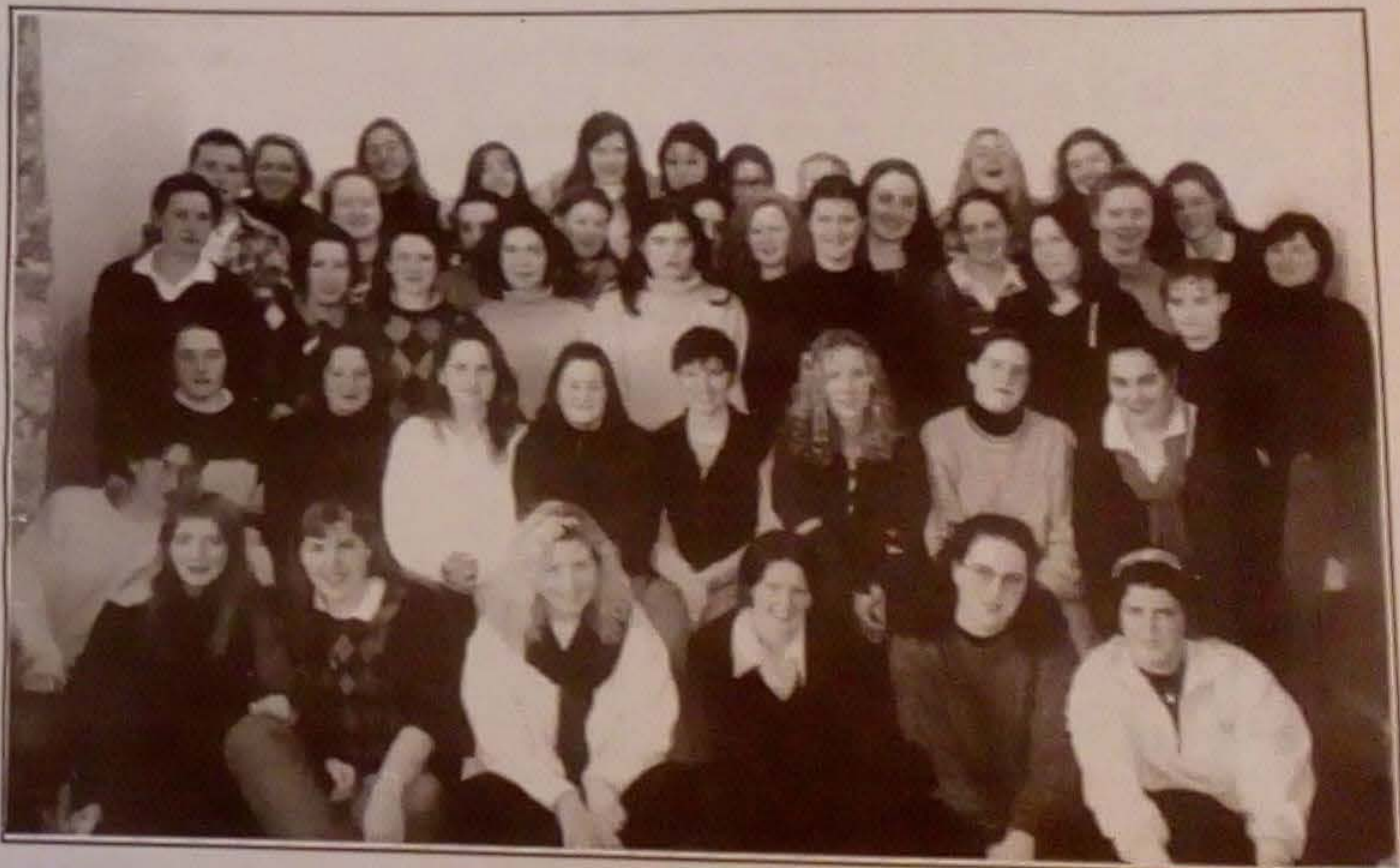
First UL class of Nurses