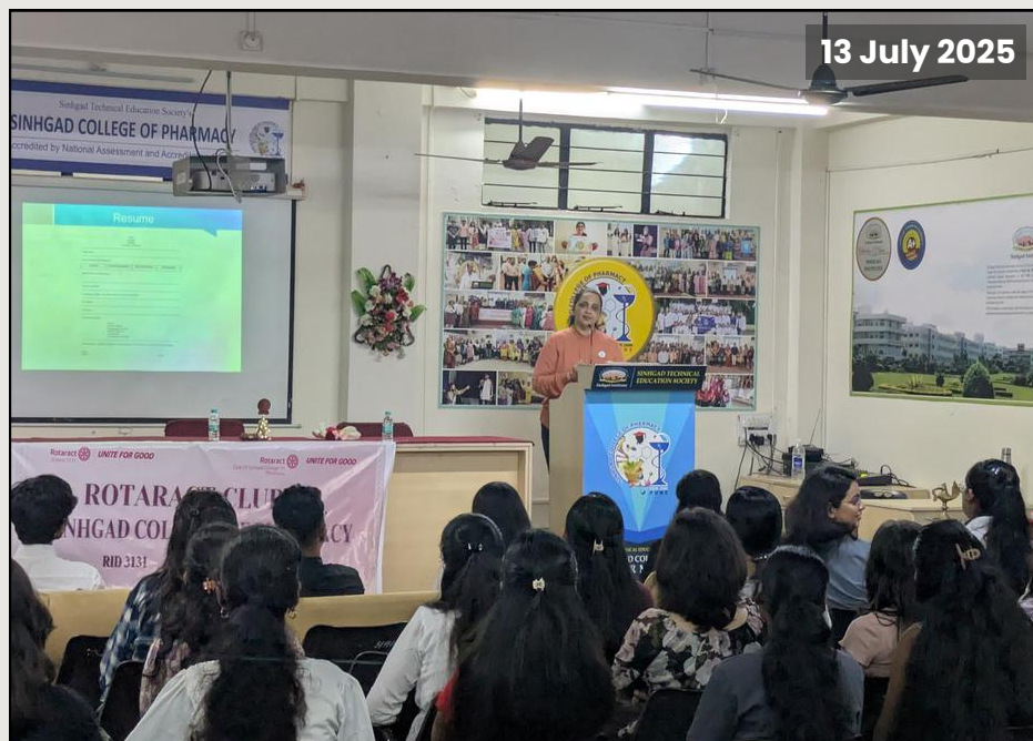
13 July 2025