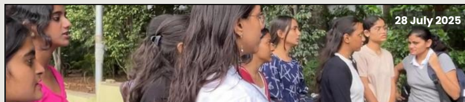
28 July 2025

The Second General Body Meeting marked a significant milestone as club bylaws were officially passed and all necessary information was transparently shared with members. The gathering also featured detailed discussions on upcoming events, fostering a sense of unity and proactive planning as the club moves forward with its annual agenda.