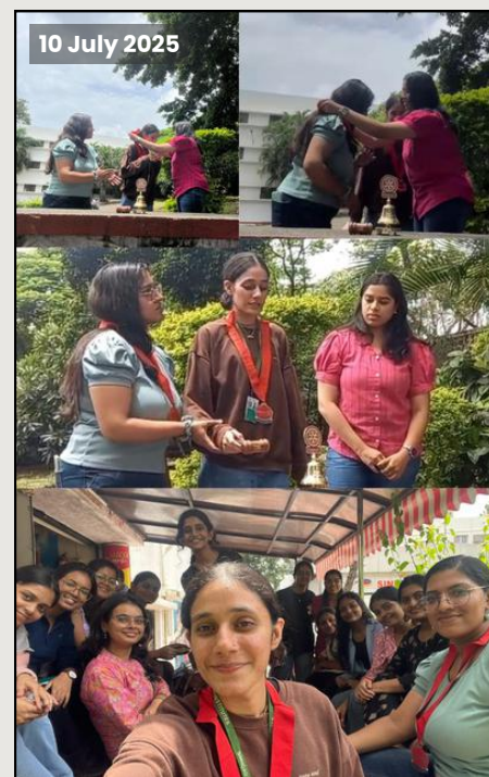
10 July 2025