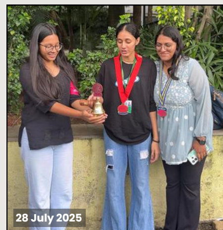
28 July 2025