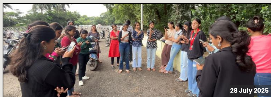
28 July 2025

The first General Body Meeting set the stage for a year of impactful engagement and collaboration. Held in the presence of enthusiastic members and office bearers, the meeting covered essential introductions, outlined the annual agenda, and welcomed new members into the fold. Key committee roles were assigned, with a focus on transparency and collective decision-making. Members actively contributed ideas, ensuring that everyone's voice was heard as we launched into a successful term together.