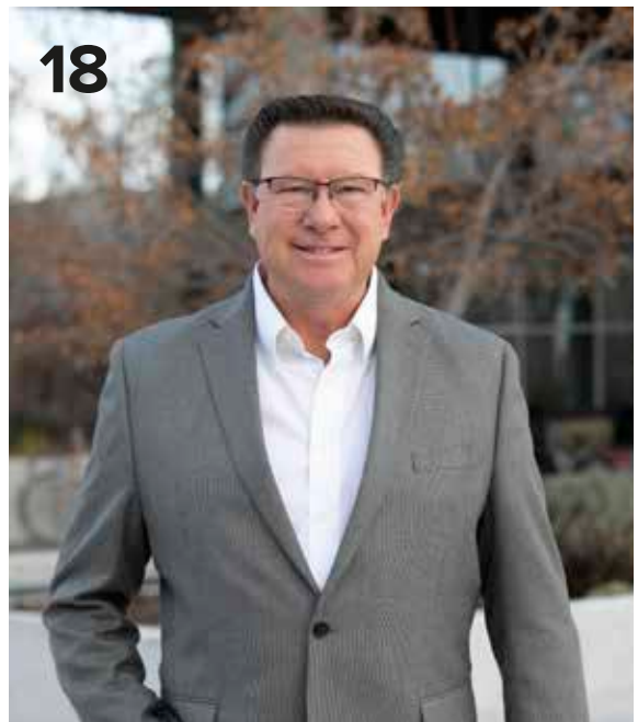
18 Idaho Window Tinting, Inc.