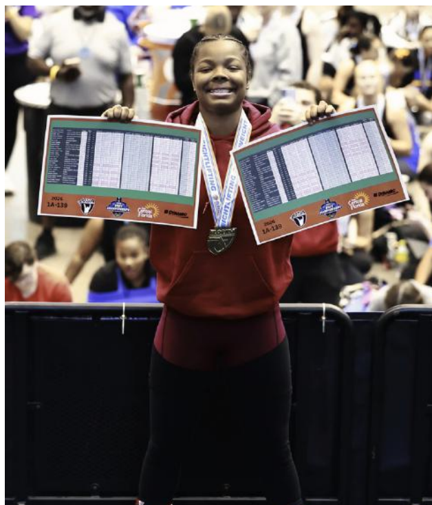
State Champion. Record Breaker. Standard Setter.