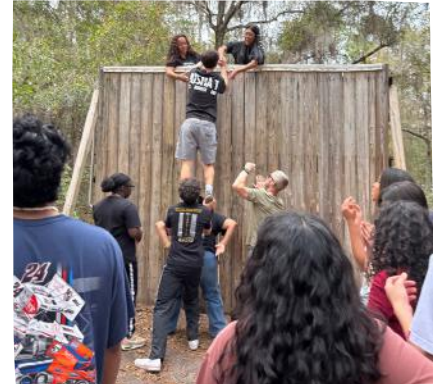
Team Building at the Retreat