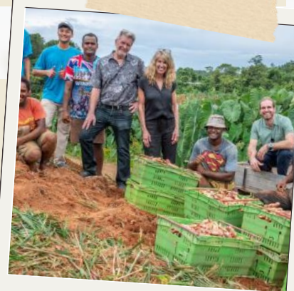
The Ginger People

With a passion for promoting healthy ginger products through sustainable farming practices, The Ginger People produce simple and innovative products using minimal ingredients. Click to read their story.