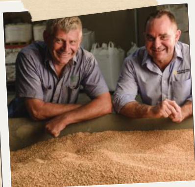
Wholegrain Milling Co.

Based in Gunnedah, NSW, Wholegrain Milling Co. is an Australian Mill that is a supplier of our 100% Certified ASP and organic flours. Click to read their story.