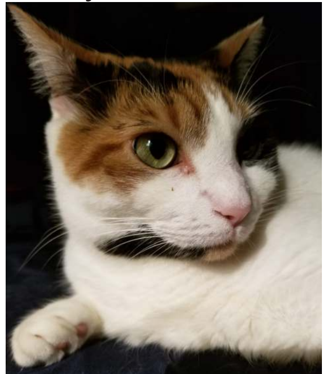
Story continued on page 73

Get noticed. This ad space could be yours. If you were cool, it would be. Don't you want to be cool? Call us today (864) 366-5461 to reserve this spot.