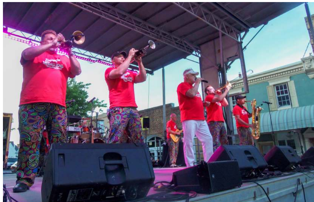
The Swingin' Medallions closed the Abbeville Spring Festival with a show on the evening of Saturday, May 1.