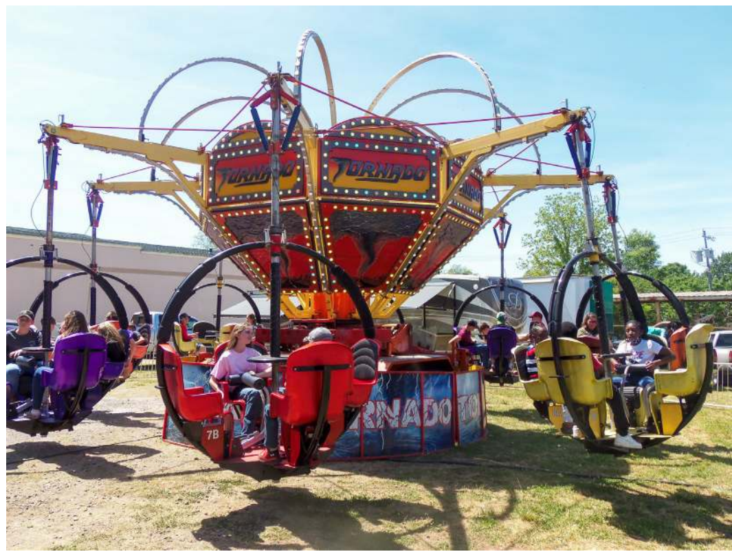
This ride on West Pickens in Abbeville helped spread the joy of the Abbeville Spring Festival, held April 29-May 1. The festival was blessed with fine weather and good attendance.