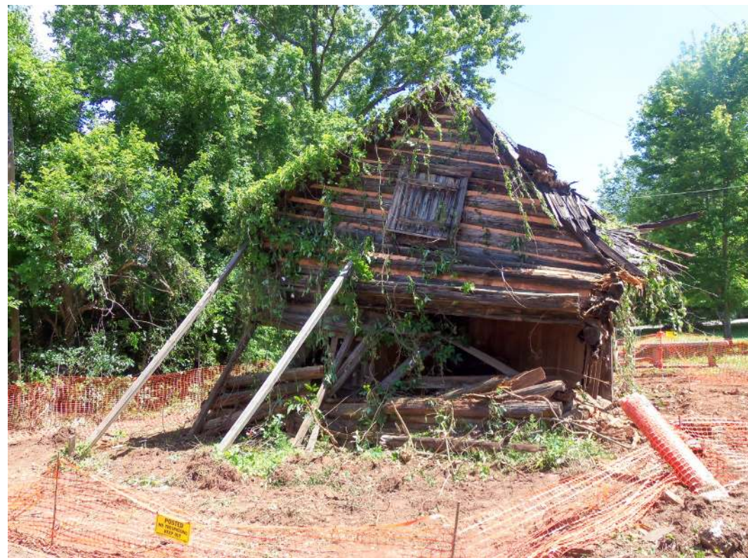
The Abbeville County Historical Society is working to help restore the Creswell Cabin, located next to the Abbeville County Museum in Abbeville.