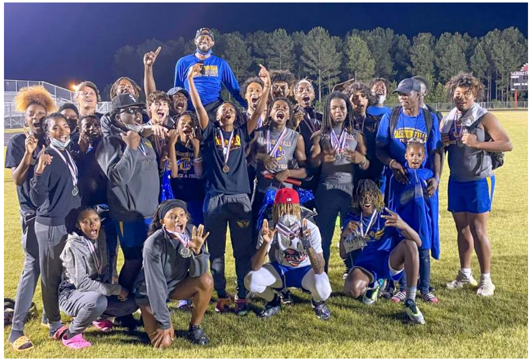
The Calhoun Falls Charter track teams turned in a fine performance at the recent Region track meet.

"We have a talented group of returning players from last year and are hoping to compete for a region title," he said.