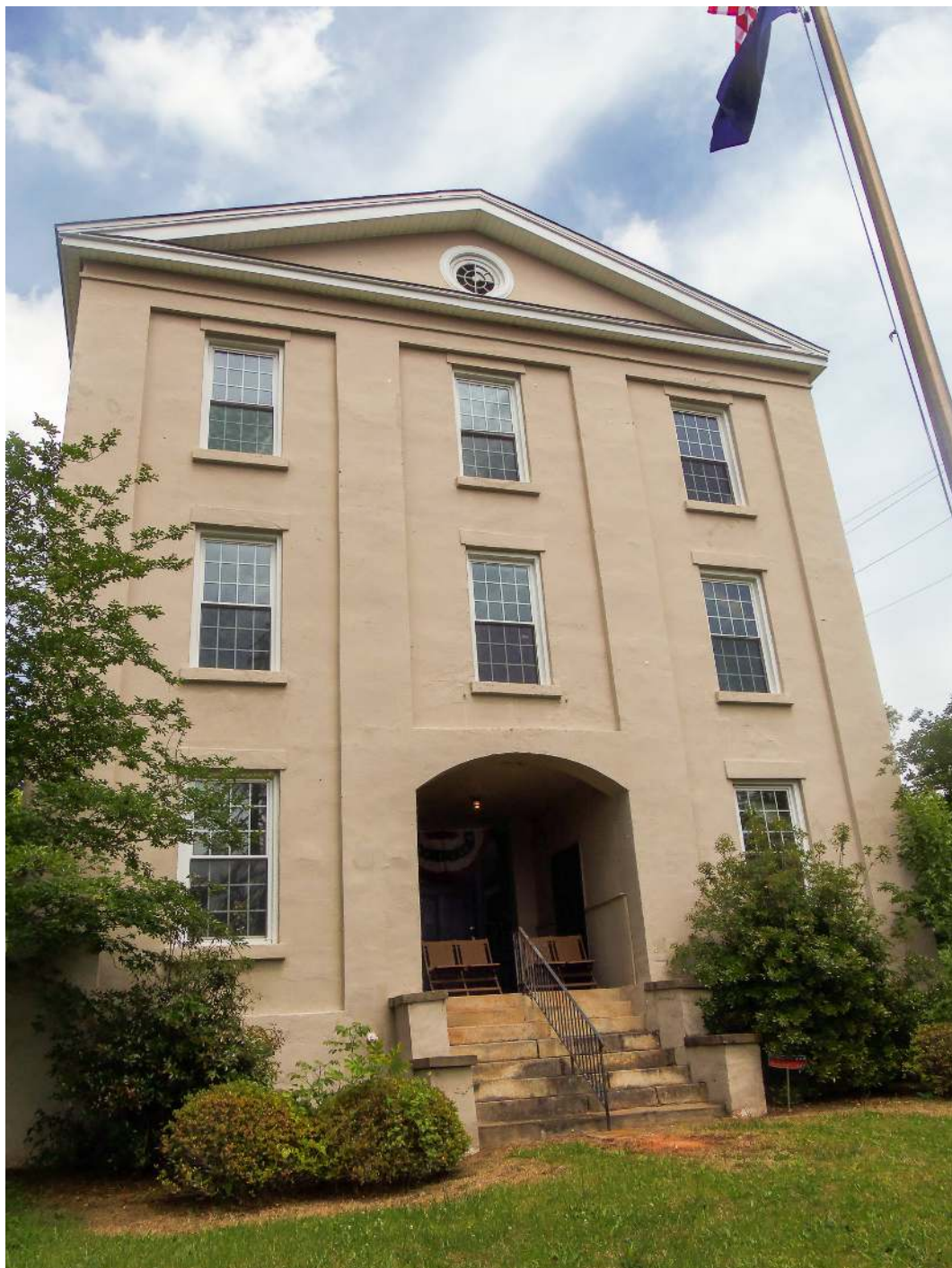
The Abbeville County Museum is housed in a building which used to be a jail, and which dates from the 19th century.