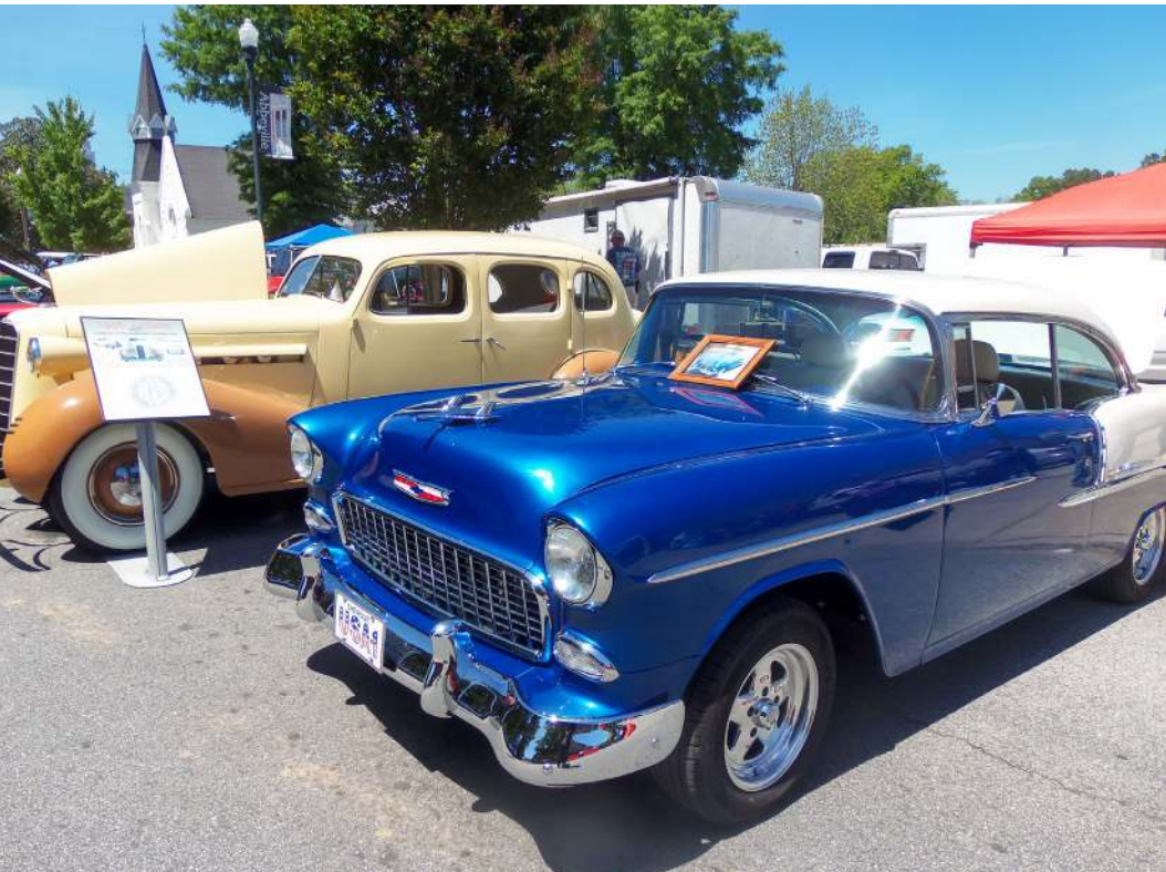
The Wheels of Time Car Show is always a big favorite at the Abbeville Spring Festival, and this year was no exception.

Both appointments and walk-ins are welcome at the clinic. Appointments may be scheduled by calling 864-725-3555.