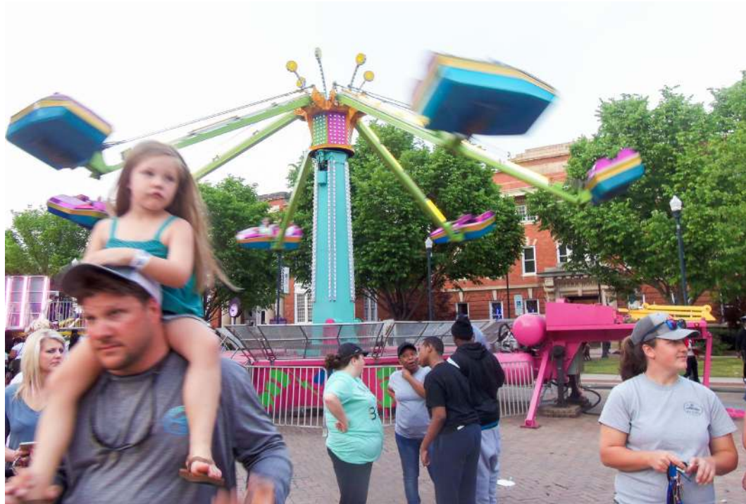
This ride on Abbeville's Court Square helped spread delight during this year's Abbeville Spring Festival in downtown Abbeville.

The Historical Society is in the process of setting up hours for visitors to the Museum.