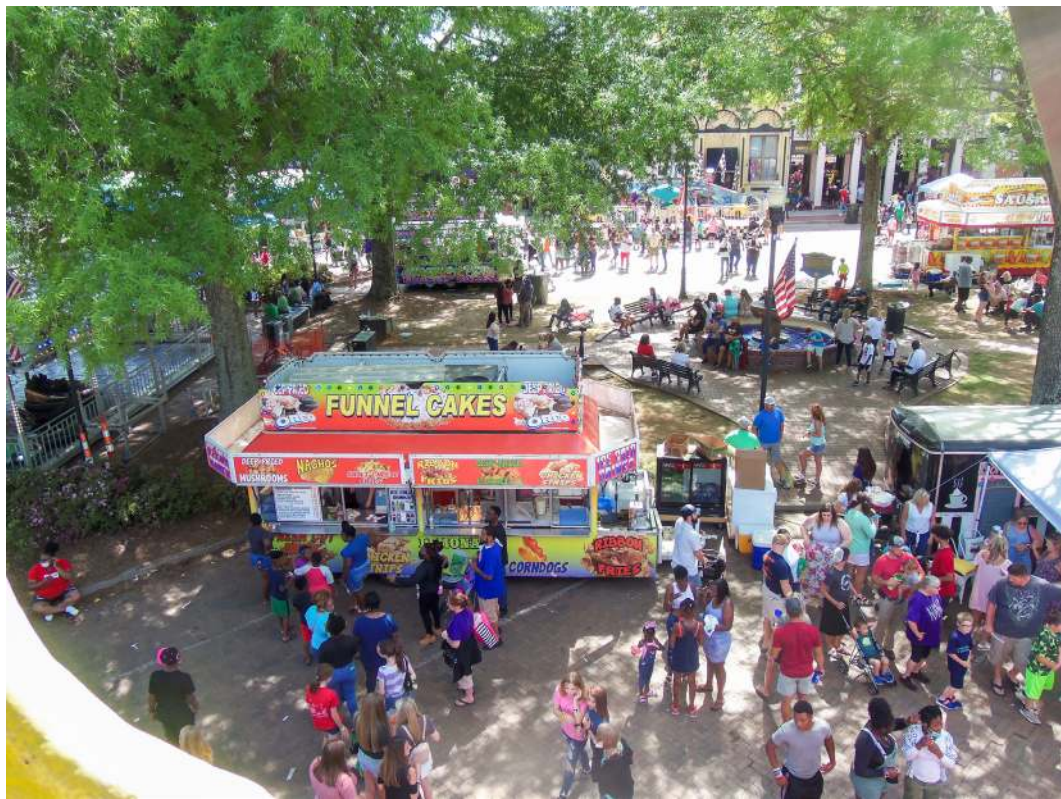
This is a view from the Ferris wheel on Abbeville's Court Square during the Abbeville Spring Festival, held recently in downtown Abbeville. Somewhere down there... someone was eating a funnel cake.