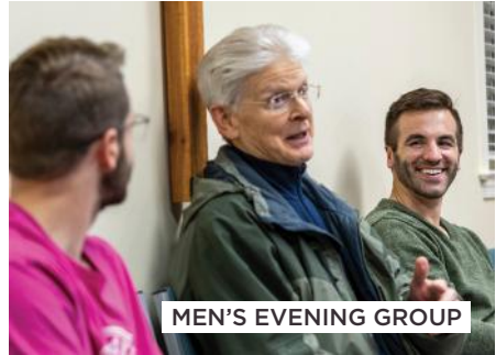
MEN'S EVENING GROUP