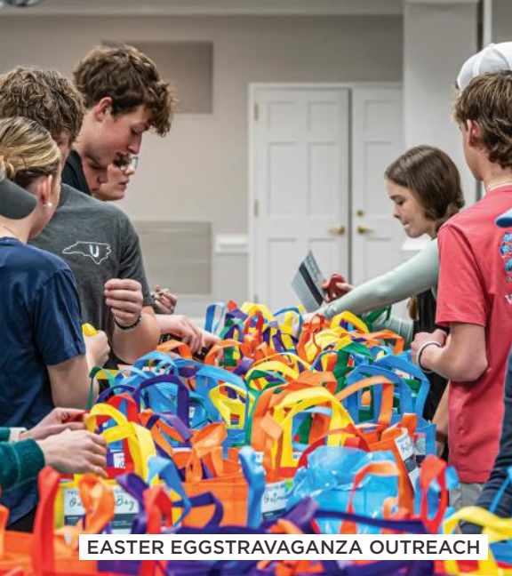
EASTER EGGSTRAVAGANZA OUTREACH