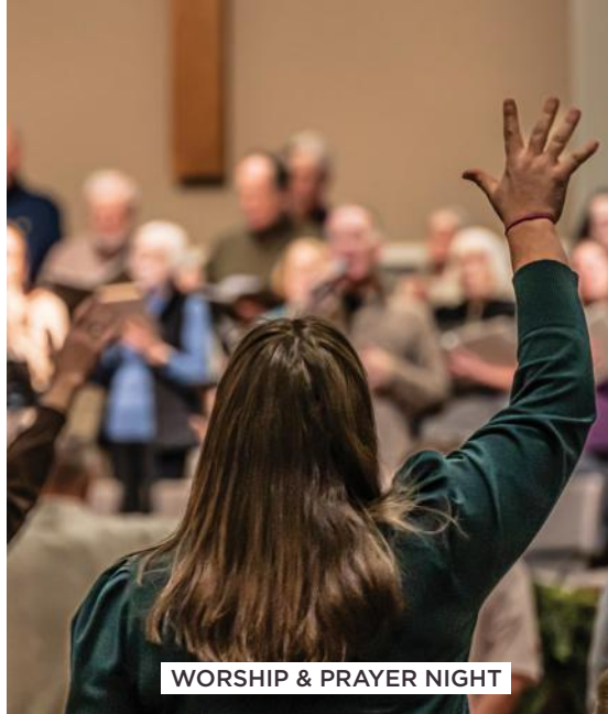
WORSHIP & PRAYER NIGHT