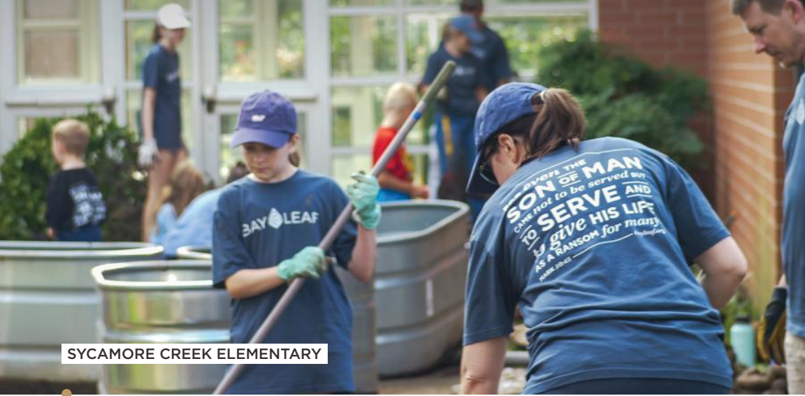
SYCAMORE CREEK ELEMENTARY

AROUND 220 PEOPLE SERVED DURING SERVE NC WEEK THROUGH 14 PROJECTS