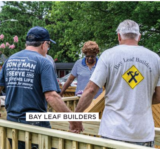
BAY LEAF BUILDERS

OVER 100 GOSPEL CONVERSATIONS in Downtown Raleigh