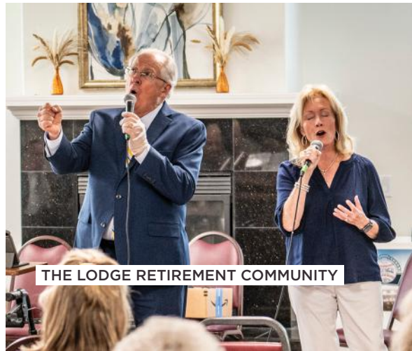
THE LODGE RETIREMENT COMMUNITY