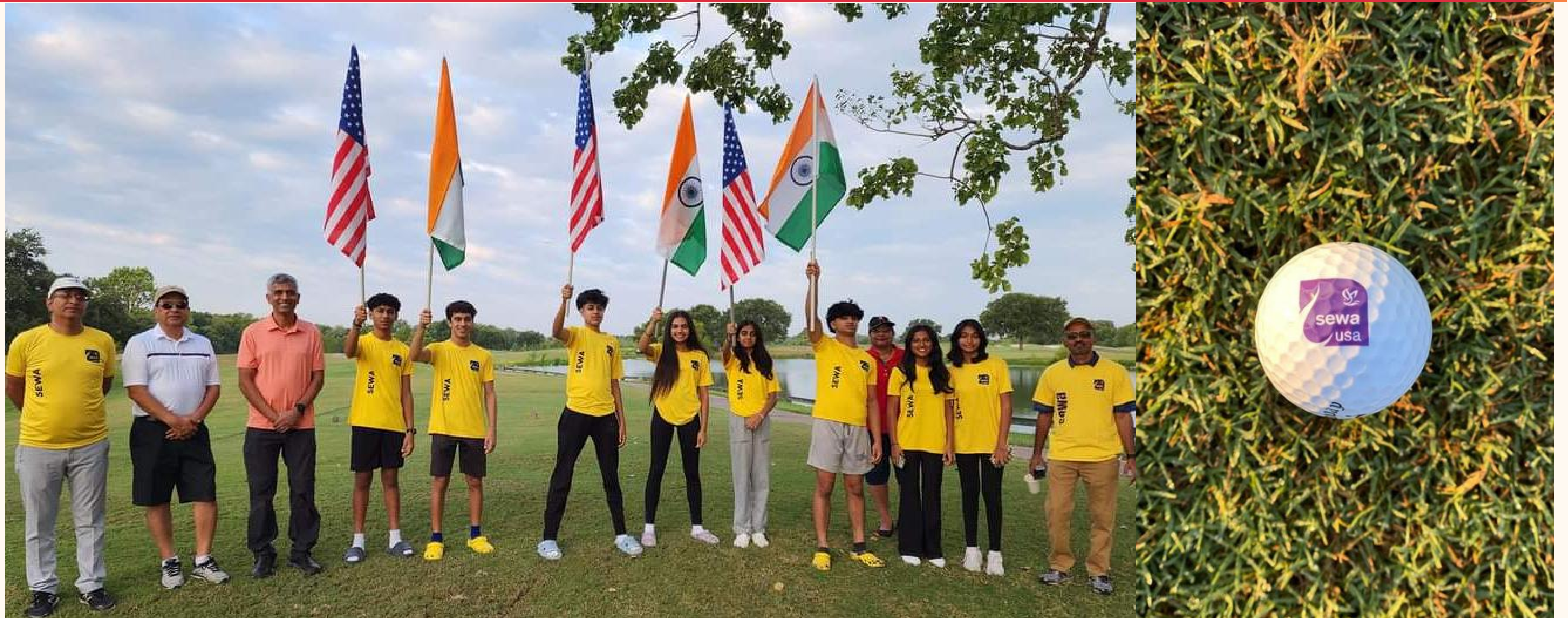
Sewa volunteers at the third annual charity golf event in Pearland, TX. A special golf ball with Sewa logo (right)