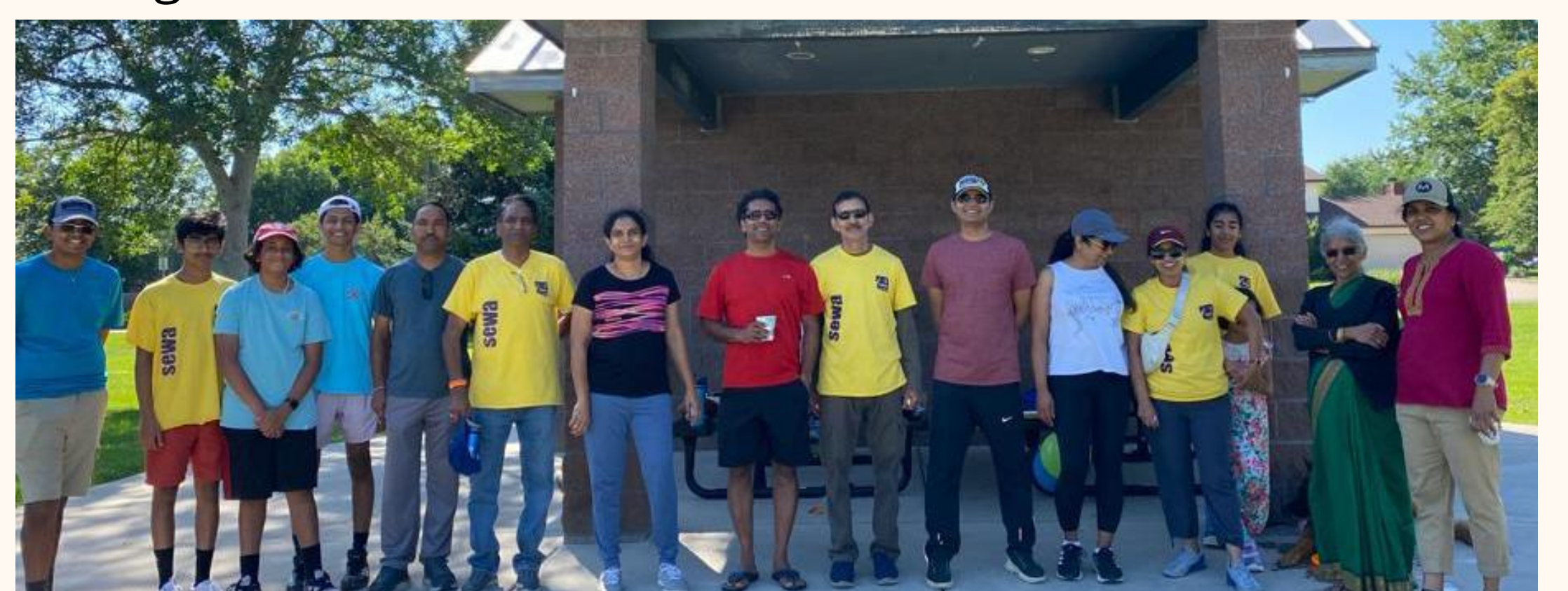
Sewa volunteers participated in the "Hike for Hygiene" event