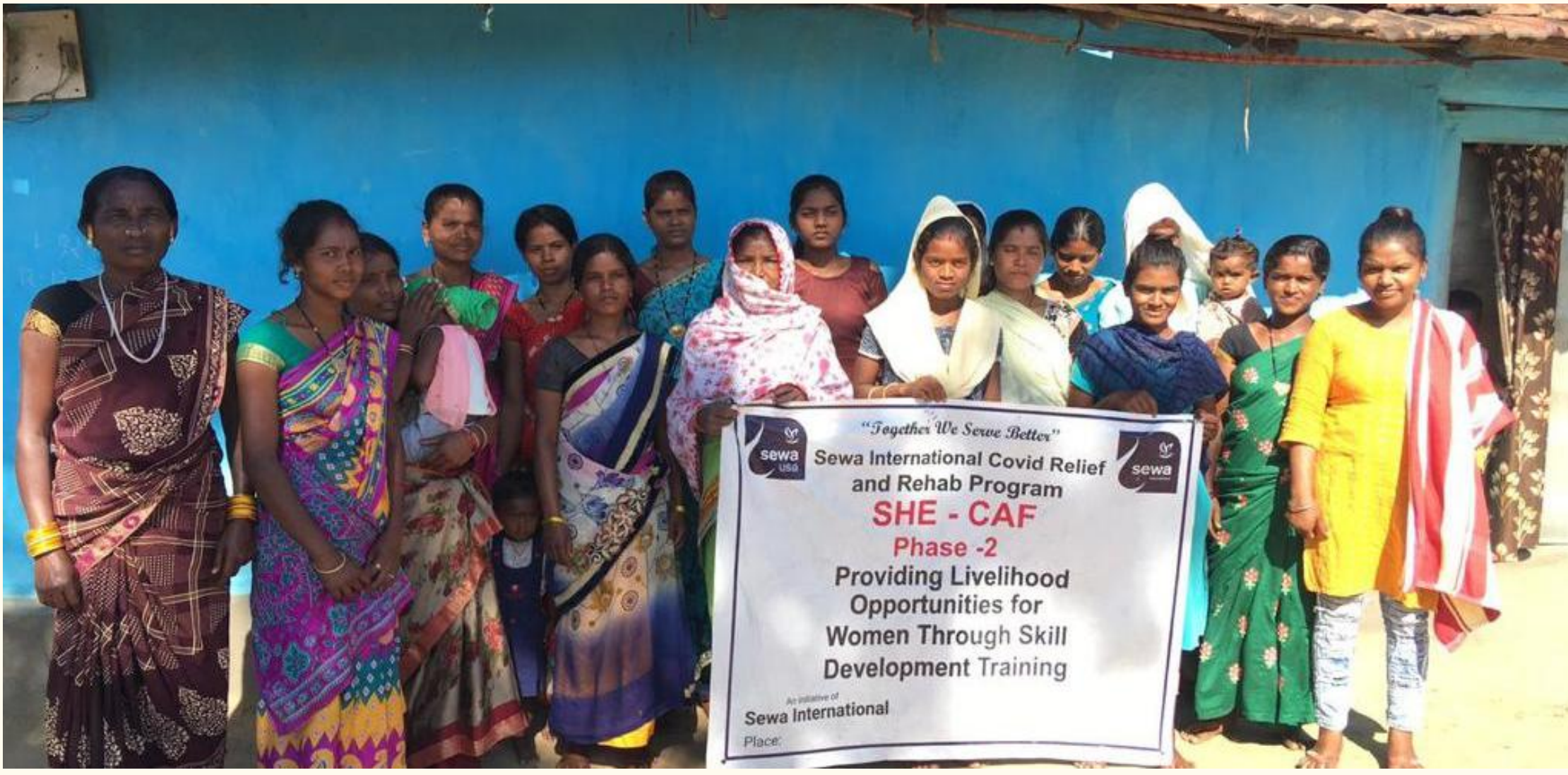
Women beneficiaries of the model village in Durg District, Chhattisgarh

Sewa International has established a model village in Chhattisgarh, India. Currently focused on eight villages in Durg District, Sewa has built twelve school toilets, benefiting over 1,000 students. It has also conducted menstrual awareness sessions for girls and offered yoga and self-defense workshops to enhance their well-being and safety. In rural and tribal regions, Sewa has been running skill development programs, and teaching tribal art, wrought iron work, painting, Tumi art, and jewelry making to women. Sewa also provides training, facilitates market linkages, and helps the women sell their products, boosting their economic prospects. A short video of the model village is available at - https://www.youtube.com/watch?v=hx6fud9Cbyg