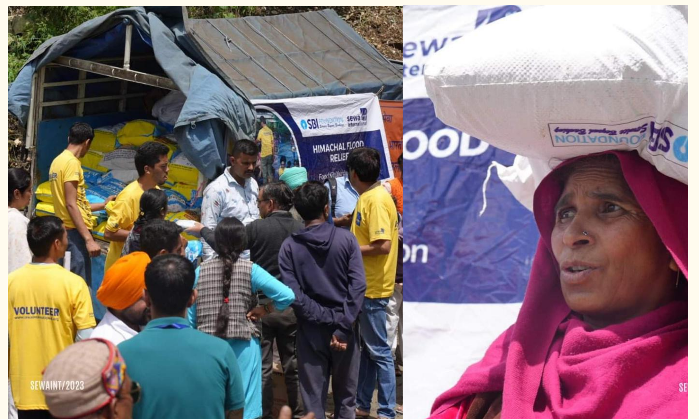
Volunteers providing essential food items to flood victims. A woman beneficiary (right) carrying the items she received