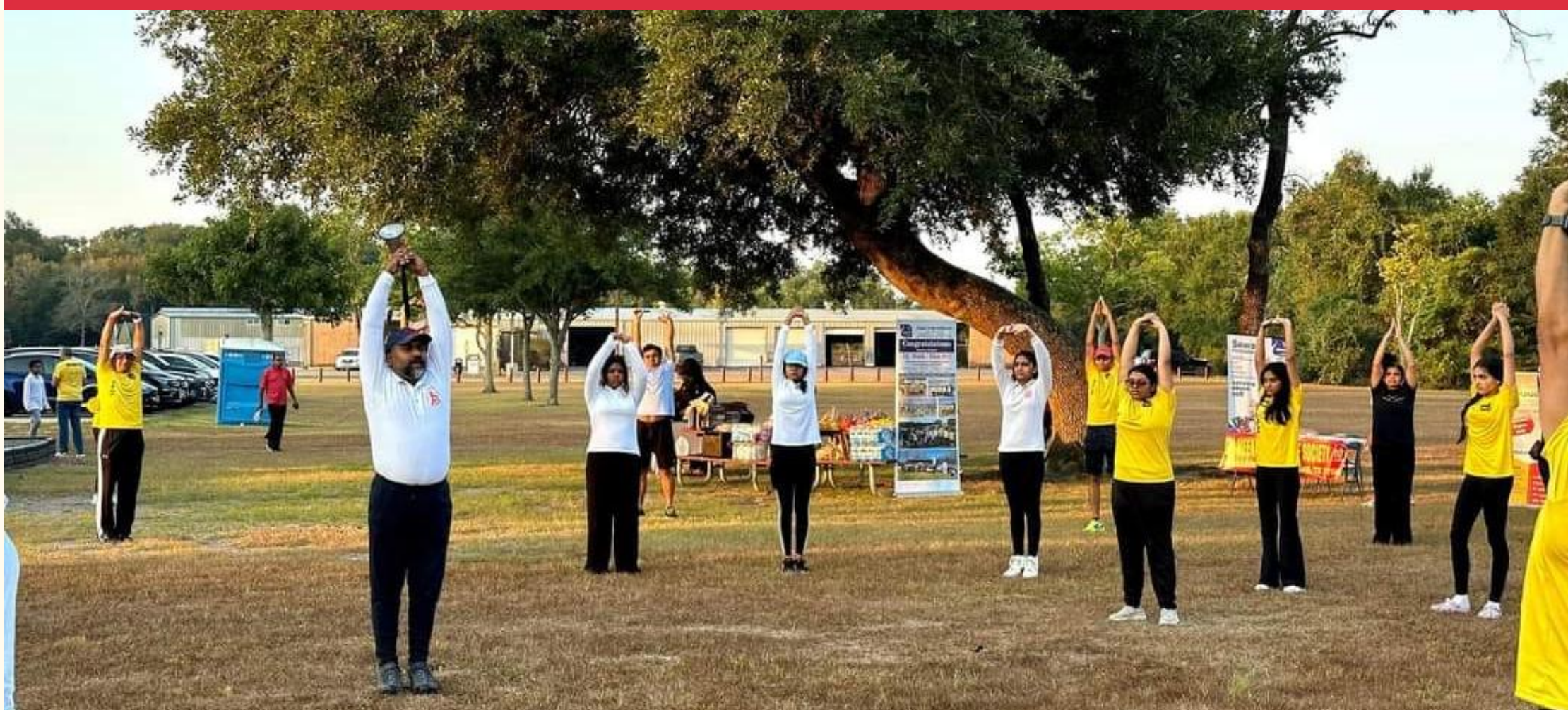
Houston SELF team performing Yoga at Tom Bass Regional Park in Pearland, TX

Sewa International's Houston SELF team celebrated a milestone by organizing their thirtieth annual 5K walk/run event in Pearland on September 2, uniting the community in a day of fitness and companionship. Partnering with Sri Meenakshi Temple Society, Love to Share Foundation America, Hindu Swayamsevak Sangh USA, and Manabadi, the event attracted over 120 participants.