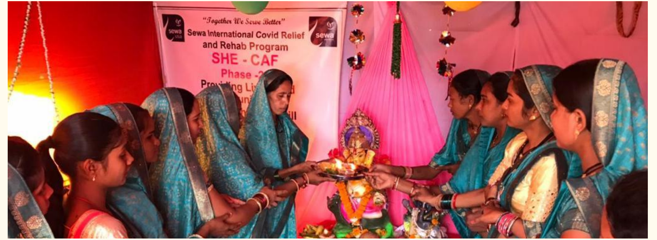
Sewa SHE-CAF team celebrating Ganesh Chaturthi

Around 200 women and student beneficiaries participated in these celebrations.