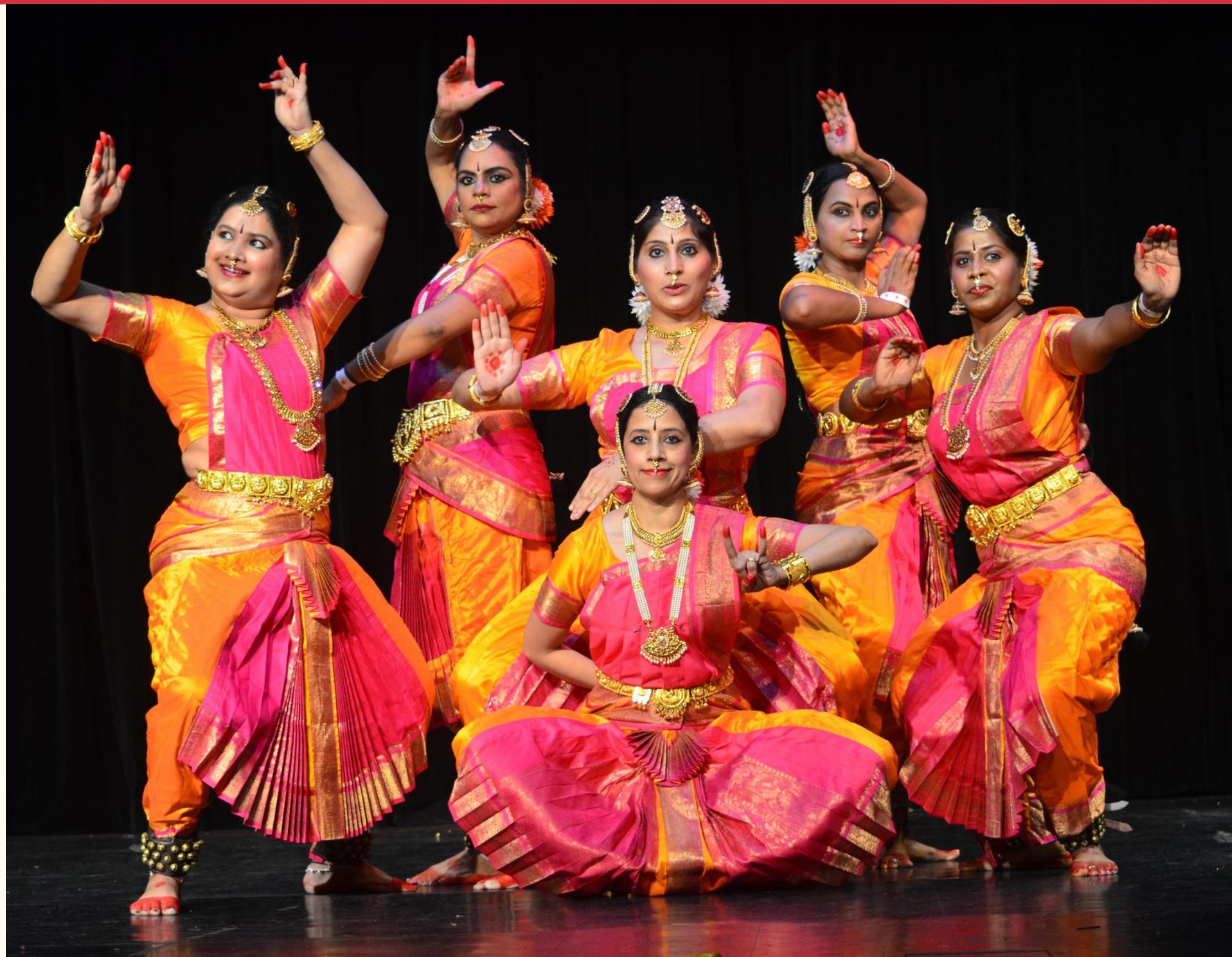
Adult participants from the classical dance category

The Sewa Dancing Stars 2023 event took place on August 26 at the Houston Durga Bari, with over 1,100 attendees braving the heat of the summer. The competition featured more than 500 participants, ranging from 5-year-old children to adults, competing in three distinct genres: classical, folk dances, and Bollywood dancing.