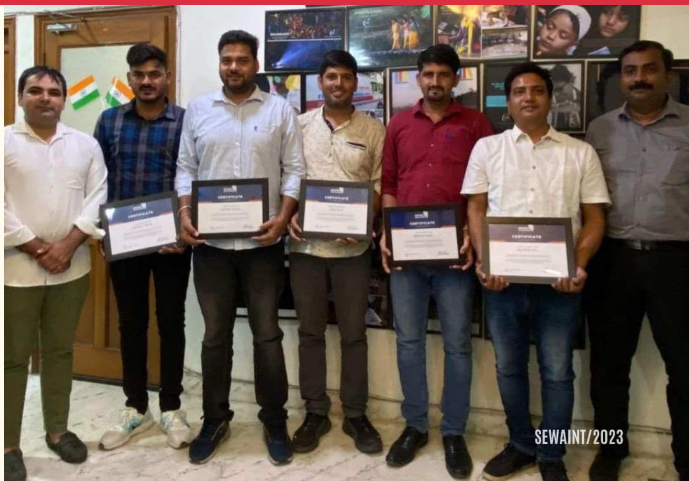
Sewa volunteers served during Delhi & Himachal Pradesh floods

In response to the recent floods in Himachal Pradesh, India, Sewa volunteers demonstrated extraordinary courage by risking their lives to provide essential medical care to those who were stranded by flood waters and were in dire need.