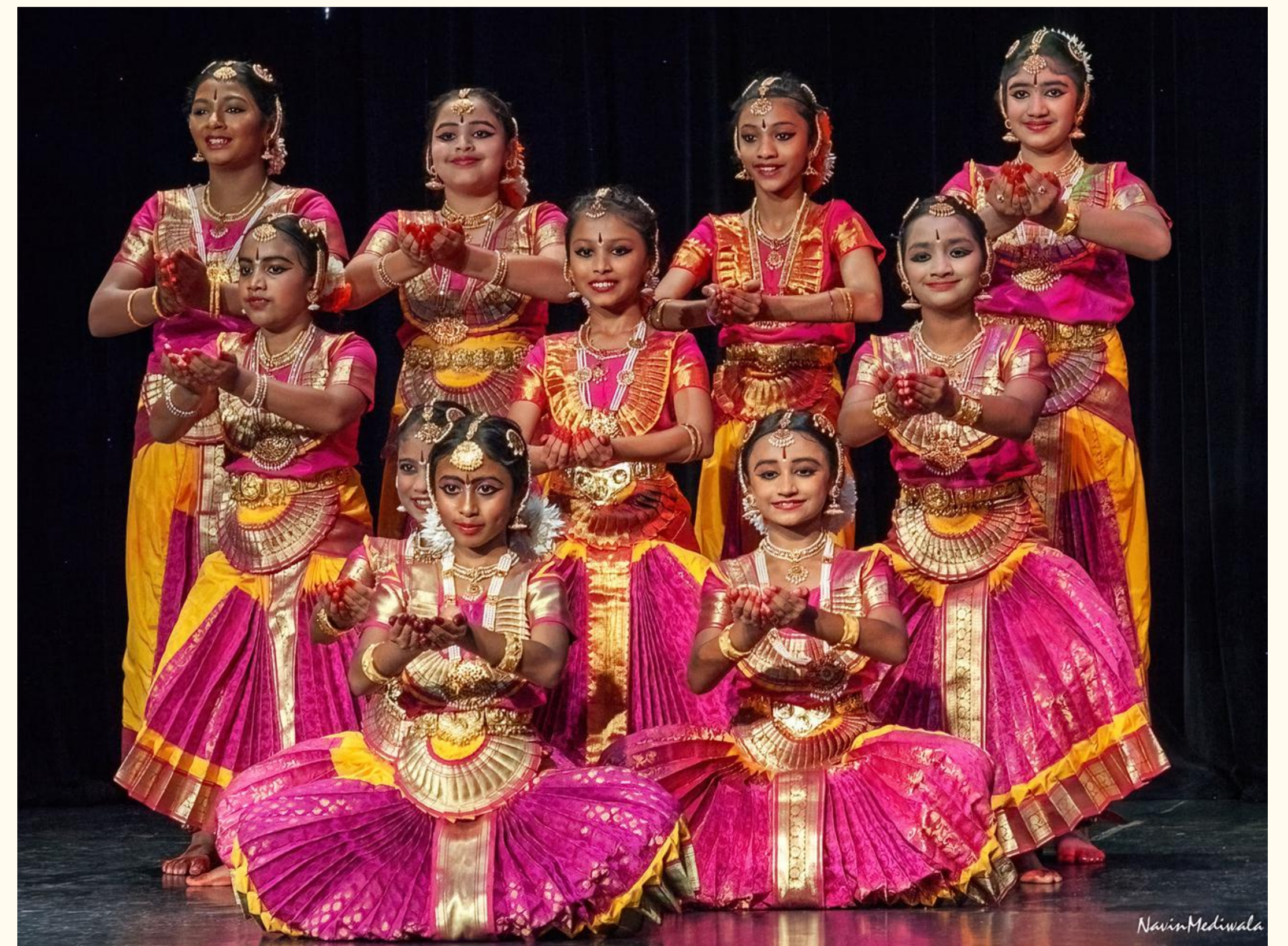
A captivating still from the Children's classical dance performance

Over 60 volunteers, including 20 youth volunteers, contributed more than 7,000 hours of volunteering over the past six months to make the event a success. The event was emceed by Puja Agrawal, Priyanka Jain, and Himi Haridas.