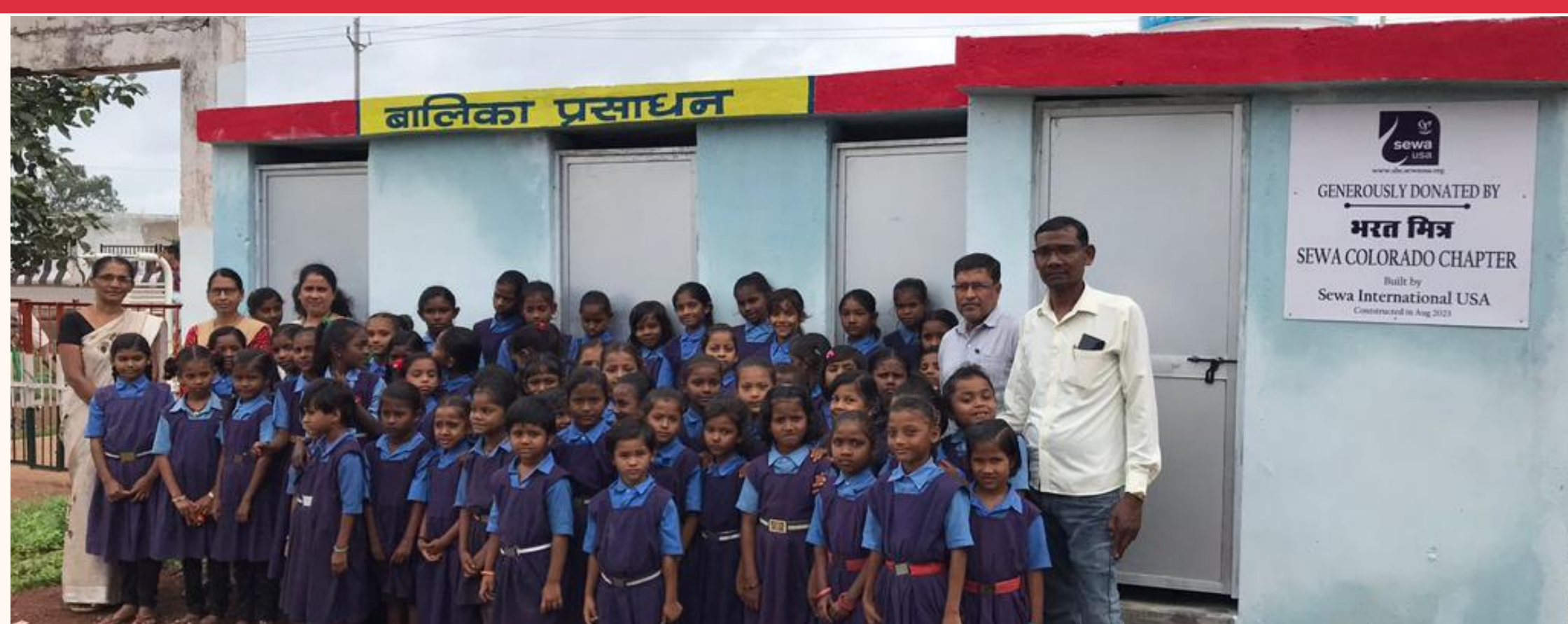
Beneficiaries at the newly constructed toilet funded by the Sewa's Colorado chapter in Sankara village, Chhattisgarh, India

Students in Colorado have successfully raised over $650, channeled into the Sanitation, Hygiene, and Empowerment Projects for the Girl Child (SHE) project, facilitating the construction of a toilet in an underprivileged government school in Sankara village, Chhattisgarh, India.