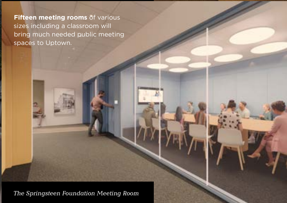
The Springsteen Foundation Meeting Room

Fifteen meeting rooms of various sizes including a classroom will bring much needed public meeting spaces to Uptown.