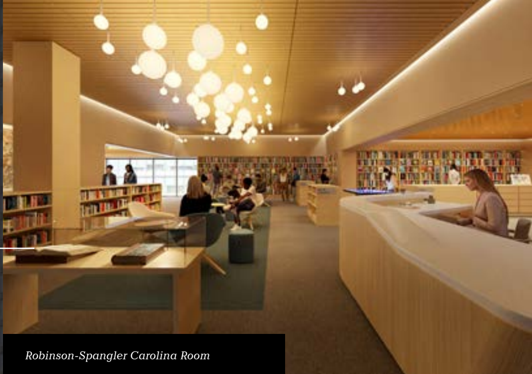
Robinson-Spangler Carolina Room

Bank of America Opportunity Center on the second floor will be a vital hub for students, job seekers, and newcomers. Its programs and resources will support college and career development, while the Newcomer Center will offer guidance to help recent arrivals navigate their new home and feel a sense of belonging.