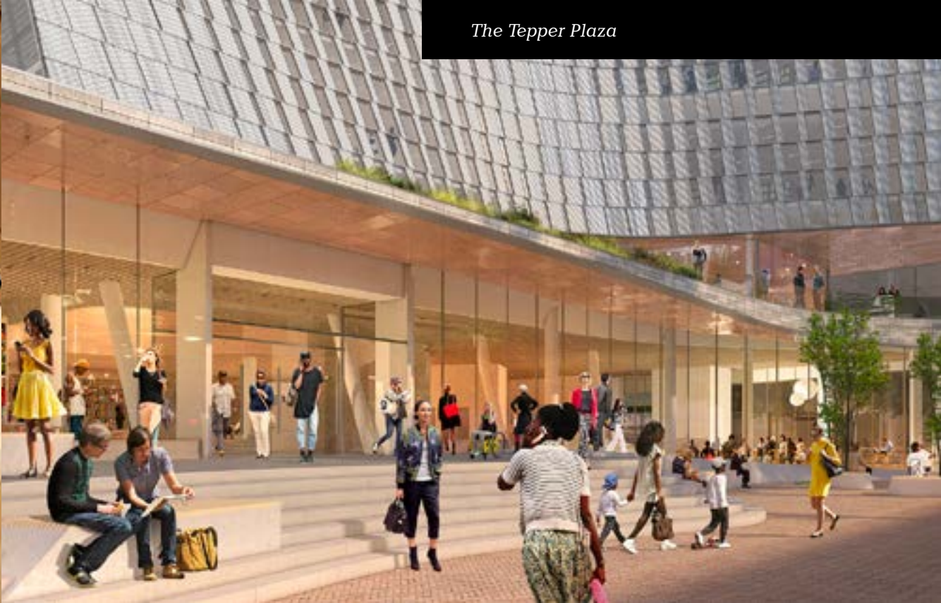
The Tepper Plaza