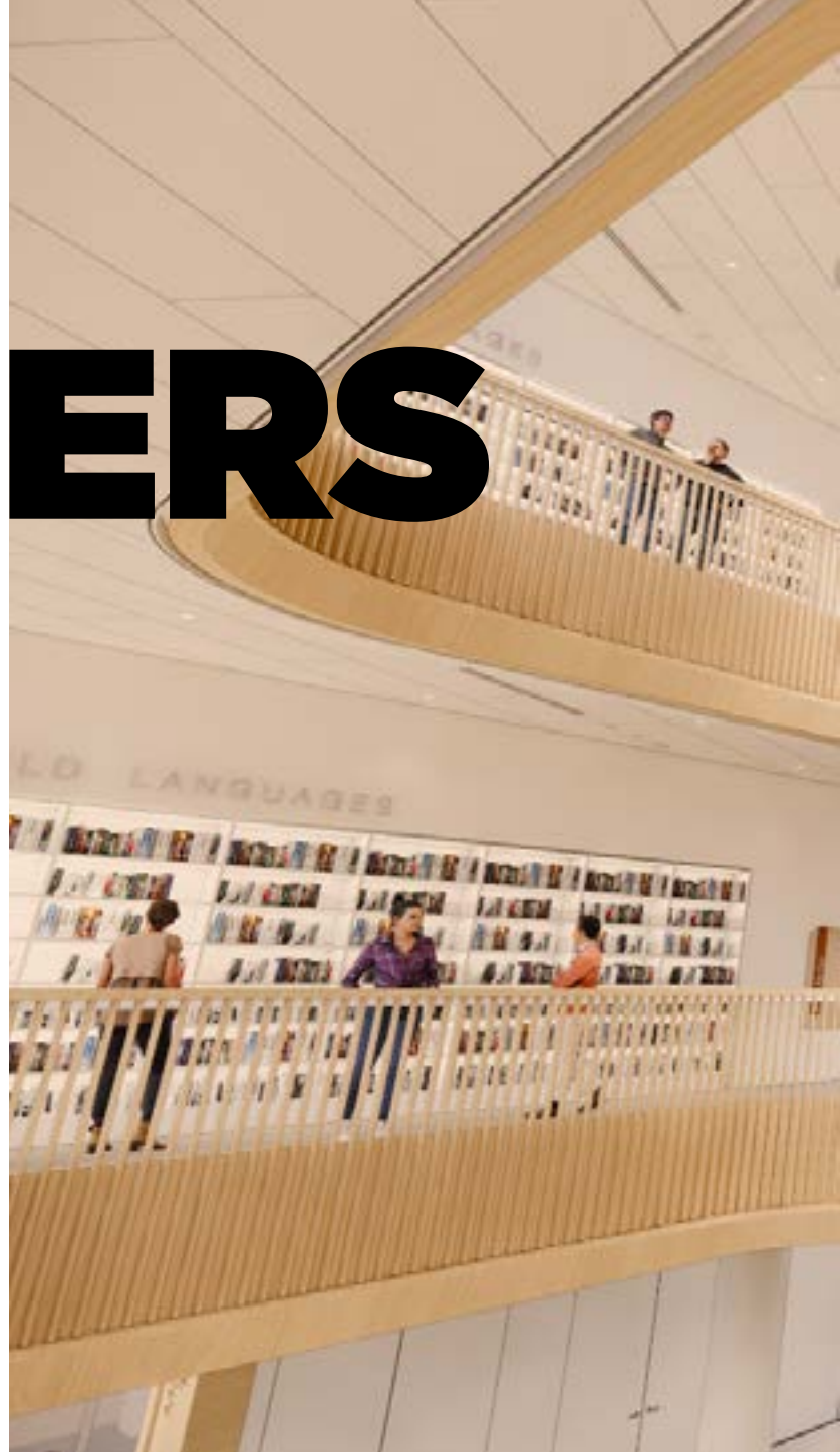
John S. and James L. Knight Foundation Hall

A deep and expansive plaza meets a kaleidoscope façade of steel and glass and primes visitors for the marvels they can expect inside: an atrium with natural light filtered through a grand skylight, illuminating five themed floors that spiral upward, each a destination for exploration, collaboration, and reflection.