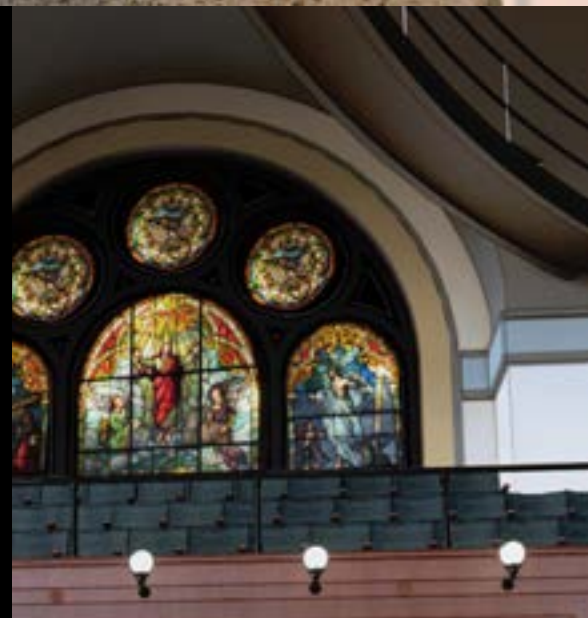
Morris Family Immersive Theater

Pass through the John S. and James L. Knight Foundation Hall to the newly renovated McGlohon and Duke Energy Black Box theaters, where stories will leap from the page to the stage.