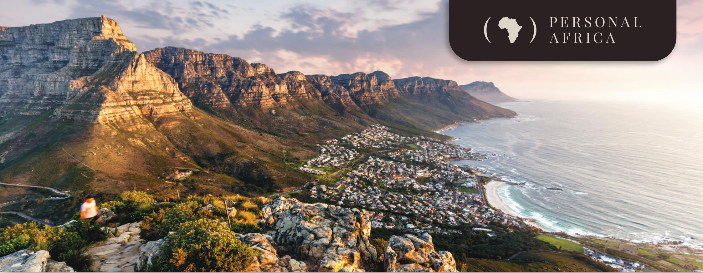
Table Mountain National Park

Table Mountain National Park is a UNESCO World Heritage Site encompassing the stunning Cape Peninsula in South Africa. This expansive park features a diverse range of landscapes, including rugged mountains, pristine beaches, and lush valleys. The park is home to iconic landmarks such as Table Mountain, which offers breathtaking views of Cape Town and the surrounding area. Aside from its natural beauty, Table Mountain National Park is known for its rich biodiversity. The park is home to thousands of plant species, many of which are found nowhere else on Earth. It is also a haven for wildlife, with animals such as baboons, dassies (rock hyraxes), and various bird species calling the park home.