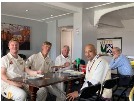
Mid-West Tour pictures.