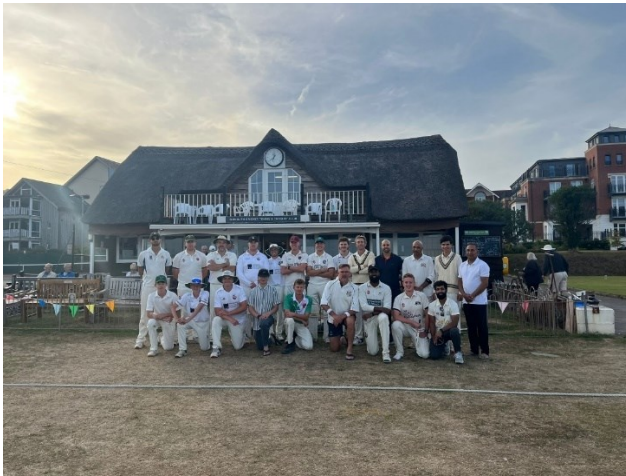
Two teams at the end with the sun going down on the beautiful, thatched Sidmouth CC pavilion

(Just reminds the manager what beautiful weather we had for the cricket season in 2025)