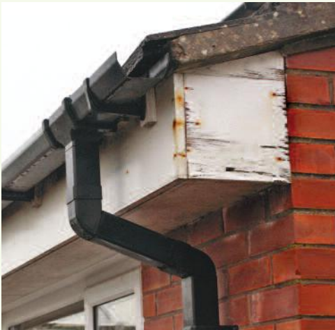
Timber roofline can rot without maintenance...

Freefoam's roofline and rainwater range is different. An occasional wipe down with washing-up liquid and water does the trick.