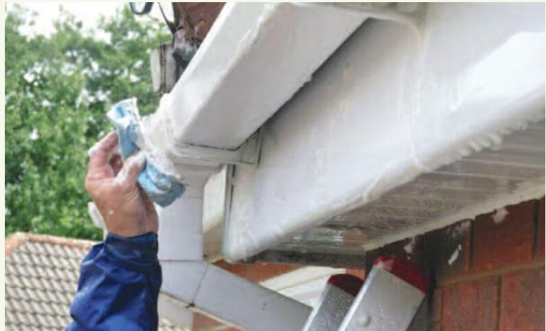
...but a quick wipe down will keep your roofline and cladding looking good.

Goodbye to time-wasting maintenance and hello to free weekends!