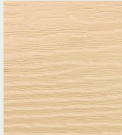
Close up of the woodgrain effect

Fortex® comes with significant environmental credentials: The Building Research Establishment's Green Guide to Specification recently gave PVC cladding the top A+ rating, when installed with standard products or materials.