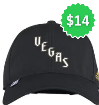
ADIDAS ADJUSTABLE RETRO REVERSE HAT