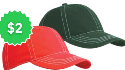
KNP CT6720 CONTRAST STITCH CAP (FOREST, RED)