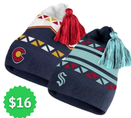
ADIDAS RR BEANIE

AD-HN2191 (Seattle) AD-HM7297 (Colorado)