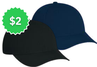
AJM 1C770B YOUTH CAP (Royal, Forest, Navy)