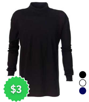
King 1135 Mock Neck T-Shirt