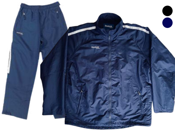
REEBOK WINDBREAK JACKET (Youth only)