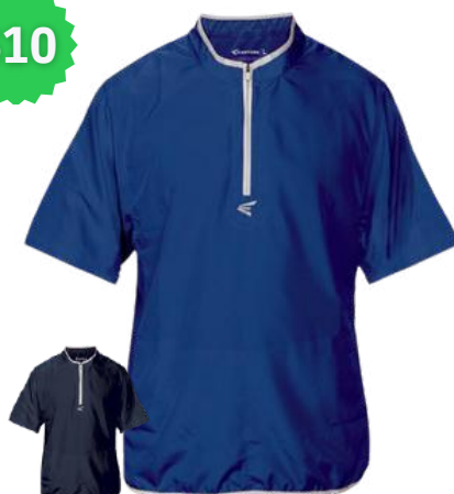
Easton M5 Short Sleeve Cage Jacket A167601 Adult Navy and Royal A167634 Youth Royal