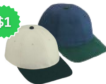
KNP CT2830 CAP (NV/FG, FG/TAN, FOREST)