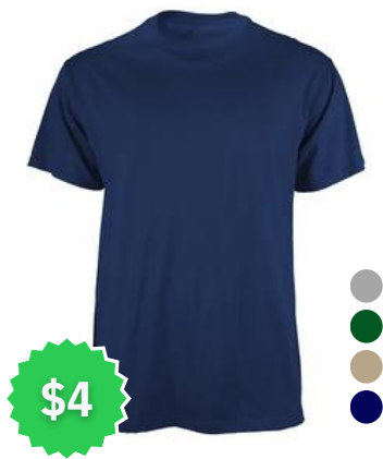
King 900 Cotton T-shirt