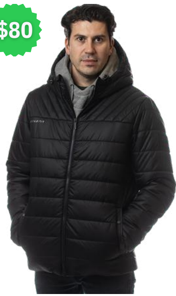
S23 Bauer Supreme Hooded Puffer Jacket