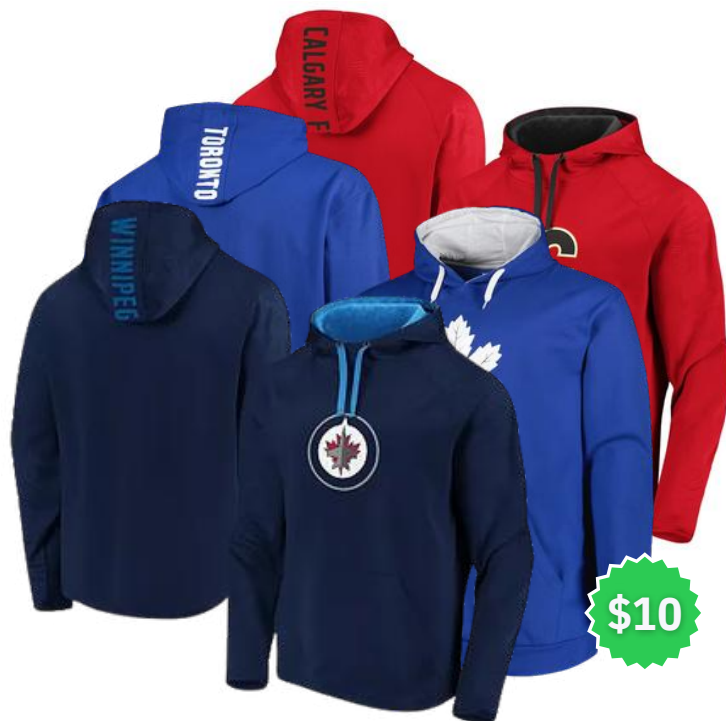
FANATICS NHL HOODIE