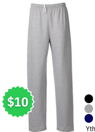
King 9022 Youth Sweat Pant