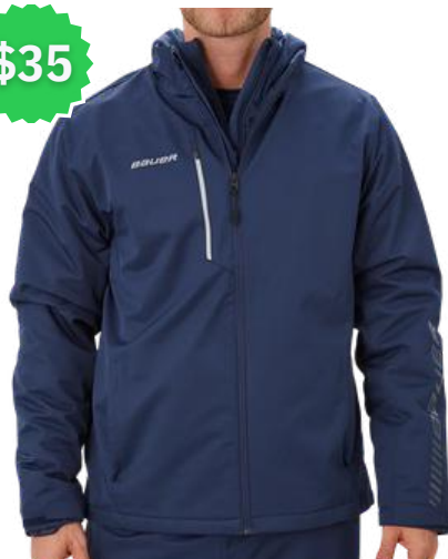
S23 Bauer Supreme Midweight Jacket ● ● ●