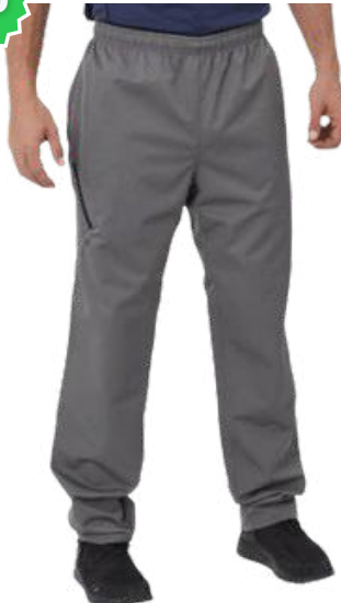
S23 Bauer Supreme Lightweight Pant ● ● ●