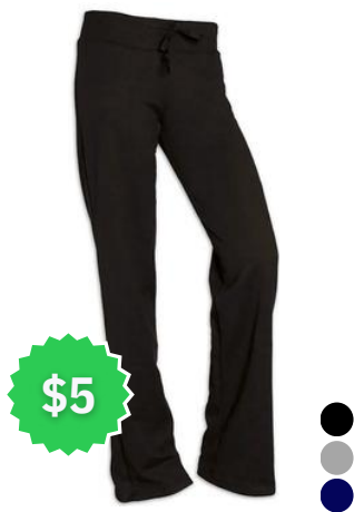
King 9008 Yoga Pant