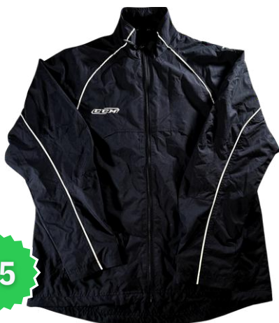
CCM TEAM LIGHT WEIGHT JACKET (Youth) J8007 (Black YS)