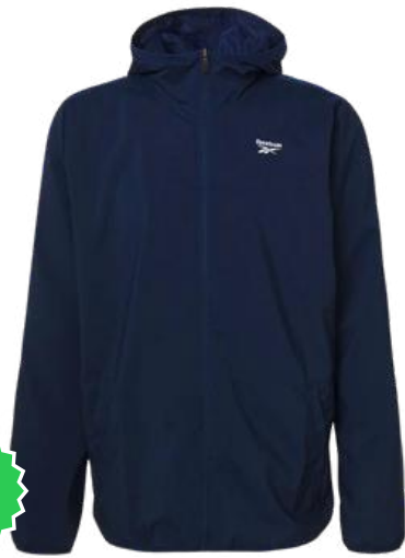
REEBOK MIDWEIGHT JACKET (Youth) J8900-YTH (Navy Small)