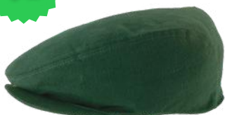
KNP C1220 PAPER BOY CAP (Forest Green)