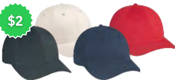
AJM 2A260 FITTED CAP (L/XL, S/M, Youth)