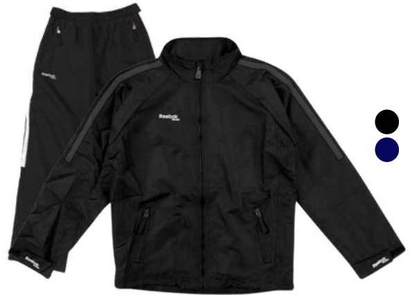
REEBOK RINK JACKET (Youth only)