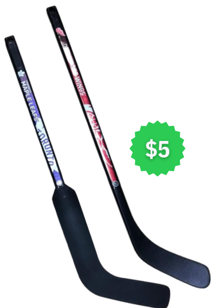
NHL COMPOSITE TEAM MINI STICKS

AD-HN2191 (Seattle) AD-HM7297 (Colorado)