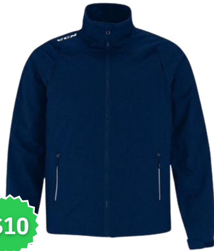
CCM PREMIUM SKATE JACKET (Youth) J5590-YTH (Navy XXS-XL)