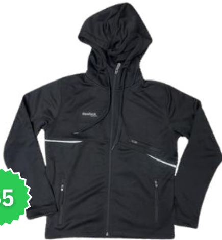
REEBOK TECH FLEECE HOODED JACKET (Youth) F8901-YTH (Black YS)