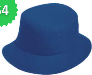
KNP CT3870 BUCKET HAT (Navy)