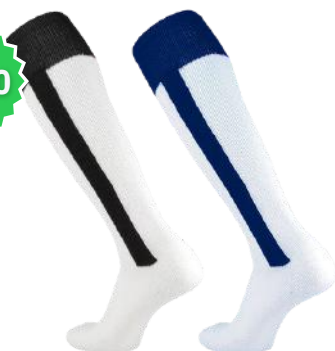
Rawlings 2N1 Sock RA-2N1 Black or Royal