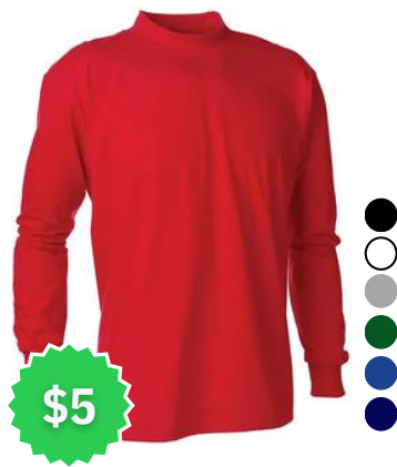
King 902 / 1132 Mock Neck T-Shirt