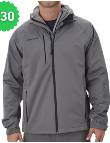
S23 Bauer Supreme Lightweight Jacket ● ● ●