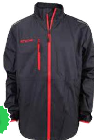
CCM LIGHTWEIGHT JACKET (Youth) J7170 (Black/White, or Black/Red)