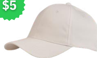
KNP CS6260 STRETCH FIT CAP (White L/XL)