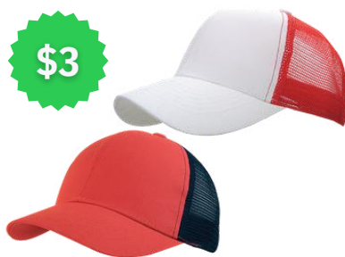
KNP CM6020 TRUCKER (Rd/bk, Wh/red)