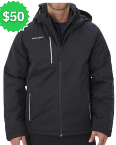
S23 Bauer Supreme Heavyweight Jacket ● ● ●