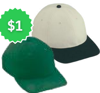
KNP C0290 CAP (FG/BK, KH/BK, FOREST)