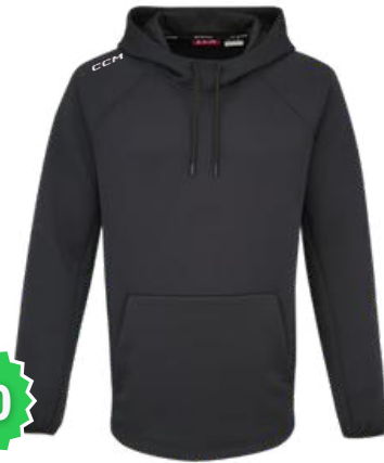
CCM TEAM HOODIE (Youth) F7173 (Black YS)