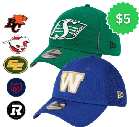
NE ADJUSTABLE CFL CAPS