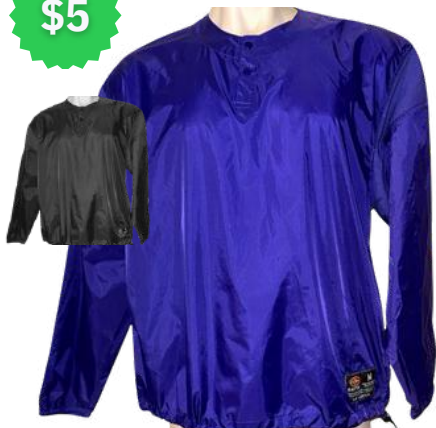
Easton Game Day Pullover A161952 Youth Black and Royal