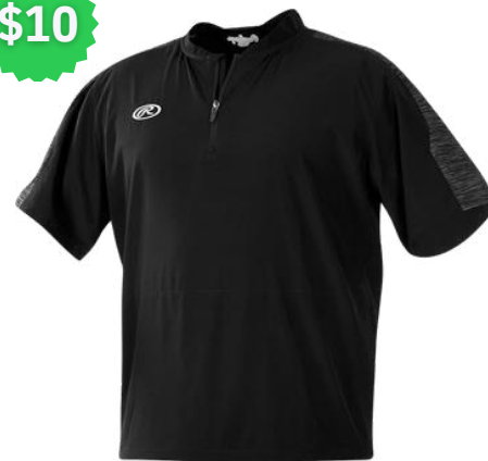
Rawlings Youth Launch Cage Jacket RA-YLNCCJ Youth Black