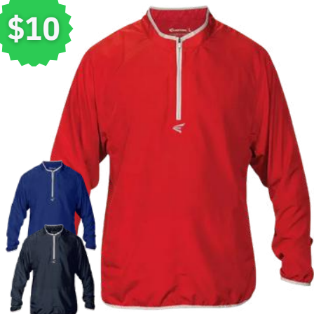
Easton M5 Long Sleeve Cage Jacket A167600 Adult Red or Royal A167602 Youth Navy