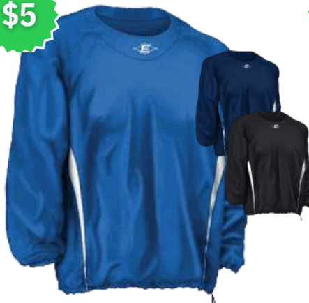
Easton Enforcer Jacket A164454 Youth Black