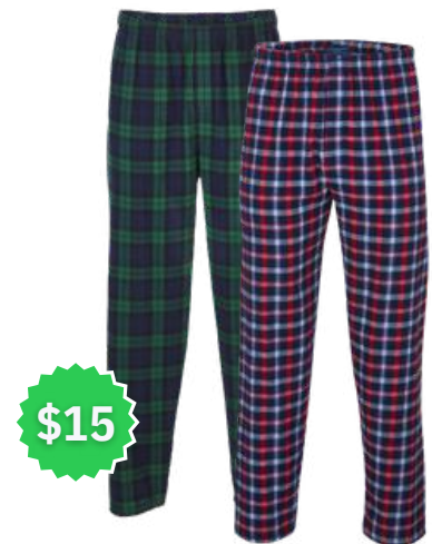
Boxercraft BM6624 Flannel Pant Blackwatch - XXS, XL, XXL Red/Blue Plaid - XXS, XXL