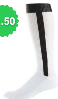
Augusta Stirrup Sock Augusta-6011 size 7-9 or 9-11