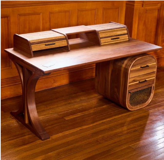
Indy Beck – Modern Study Desk