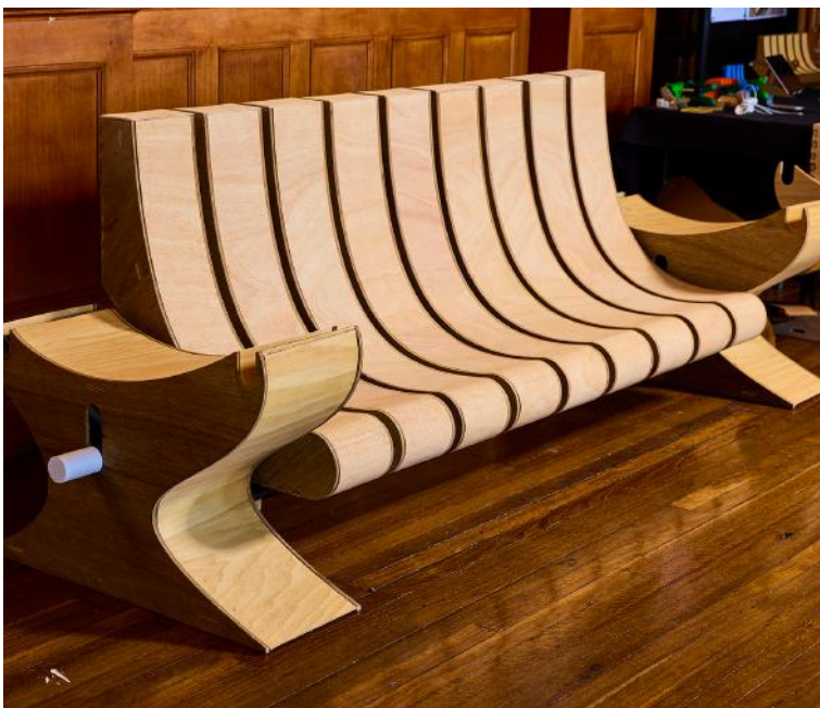
Samuel Hutchinson – Multifunctional Furniture