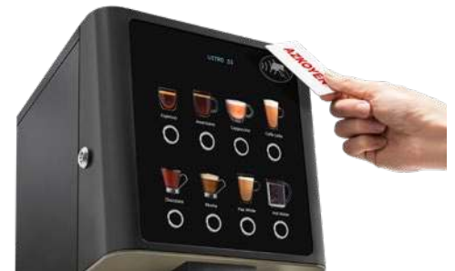
RFID Reader Kit For product recharge card or cashless systems