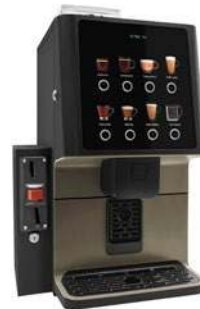
Validator module kit Ready to install a coin validator