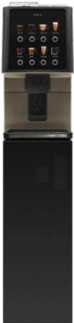
Base cabinet kit Ready to install a coin validator (850 mm)

It is also the perfect solution for a coffee service in convenience stores as well as for hotels, where breakfast needs to be good but also fast. It offers a pleasurable experience with an attractive, simple and functional design.