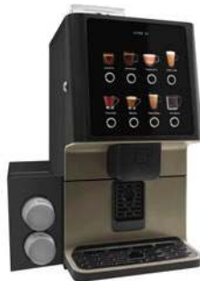
Cup module kit For dispensing cups