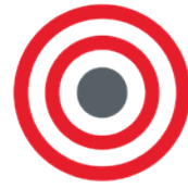
Make It Simple

We are passionate about what we do. We are motivated by our company's fast-paced learning, multi-national environment, and unparalleled professional growth opportunities.