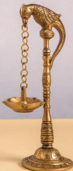
Brass Parrot Lamp 7.5" ₹ 1,400