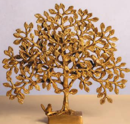
Brass Tree with Birds 9" ₹ 7,500