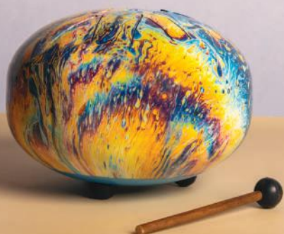
Iron Handpainted Happy Drum 9" ₹ 3,100