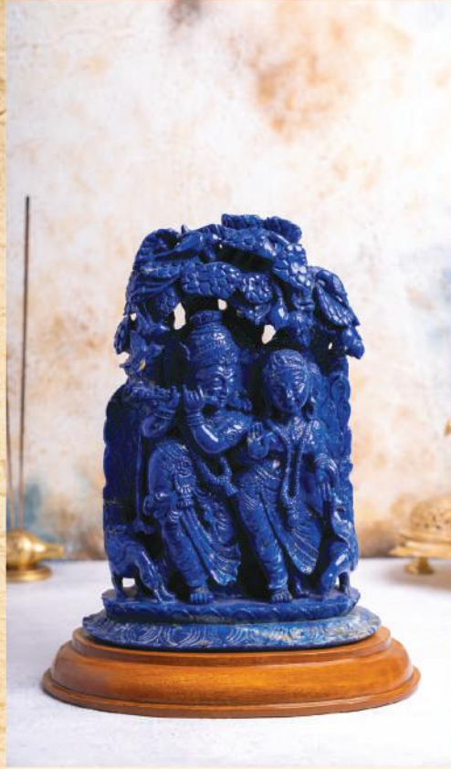
Lapis Stone Radha Krishna 9.8"