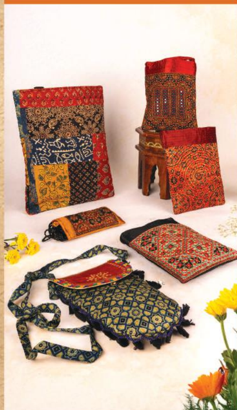
Hand Embroidered Bags - Gujarat