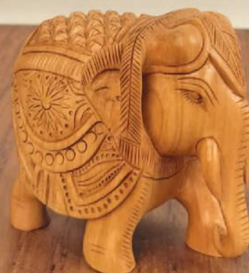
Kadamwood Carved Elephant 4" ₹ 950