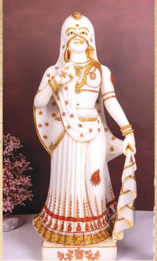
Marble Bani Thani 36"