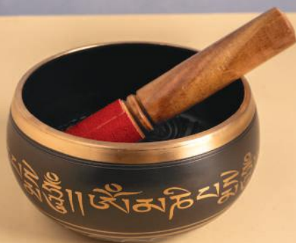
Brass Singing Bowl with Leather Stick 6" ₹ 2,100