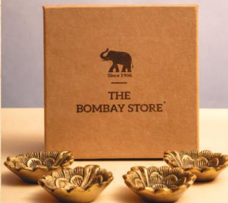
Brass Deepak Set of 4 ₹ 1,500