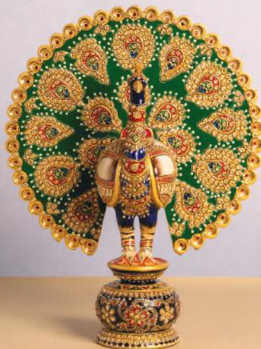
Wooden Handpainted Chamki Peacock 12" ₹ 8,000