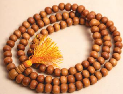
Sandalwood Jap Mala 8mm ₹ 510