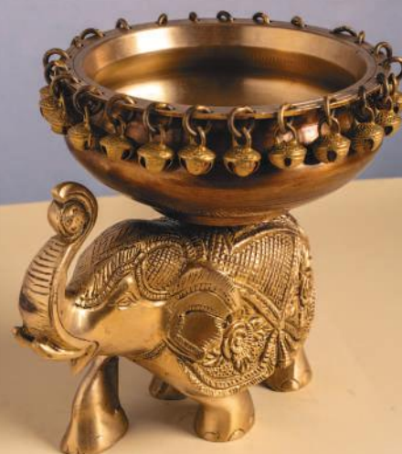
Brass Elephant Urli - Antique Finish 7.5" ₹ 7,500