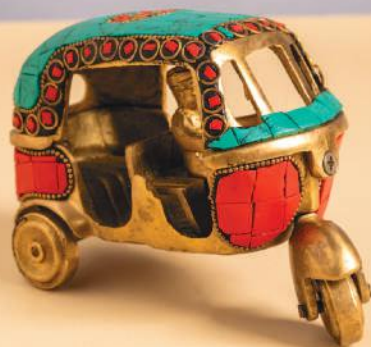
Brass Auto Rickshaw 5" ₹ 1,800