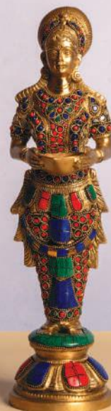
Brass Deeplaxmi 14" ₹ 8,800