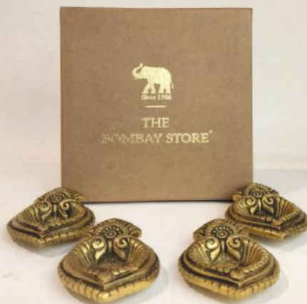
Brass Leaf Deepak Set of 4 ₹ 1,900