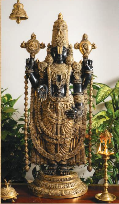
Brass Balaji - Antique Finish 47"