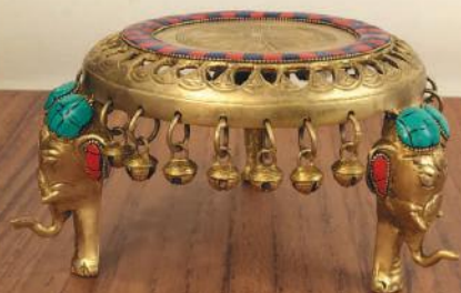
Brass Ghungroo Chowki 8" x 5" ₹ 7,700