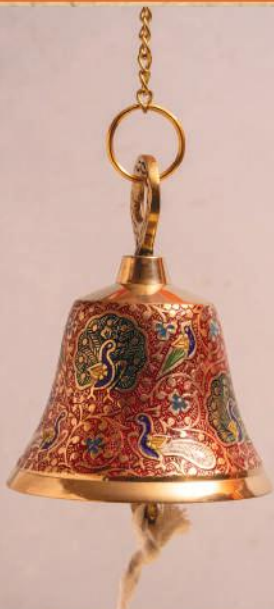
Brass Temple Bell ₹ 1,300