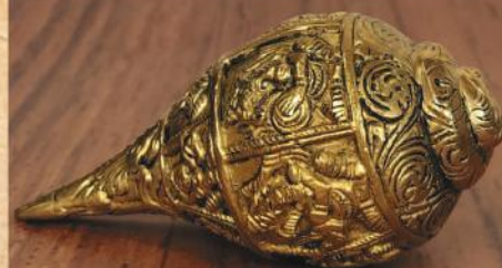
Brass Shankh Ganesha Carving 5.5" ₹ 1,700