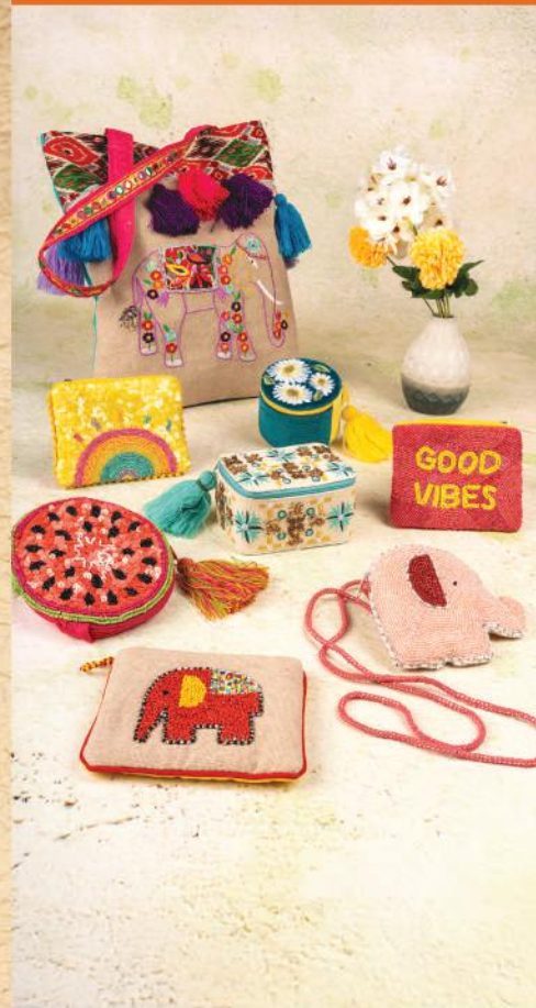
Beaded Pouches - UP