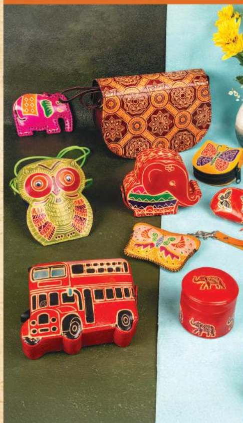
Shanti Niketan Leather - West Bengal