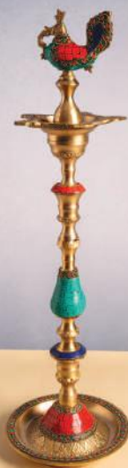
Brass Annam Oil Lamp 24" ₹ 9,500