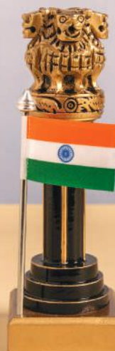
Kadamwood Ashoka Pillar ₹ 750