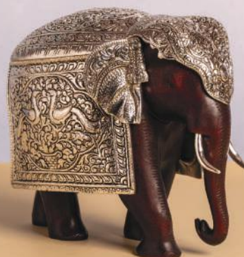
Wooden Mysore Elephant 6" ₹ 5,400