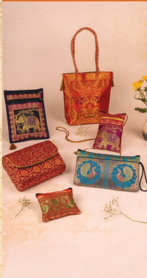
Banarasi Art Silk Bags