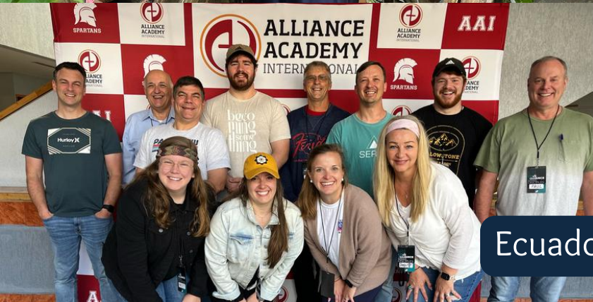
Ecuador Mission Team - 2022