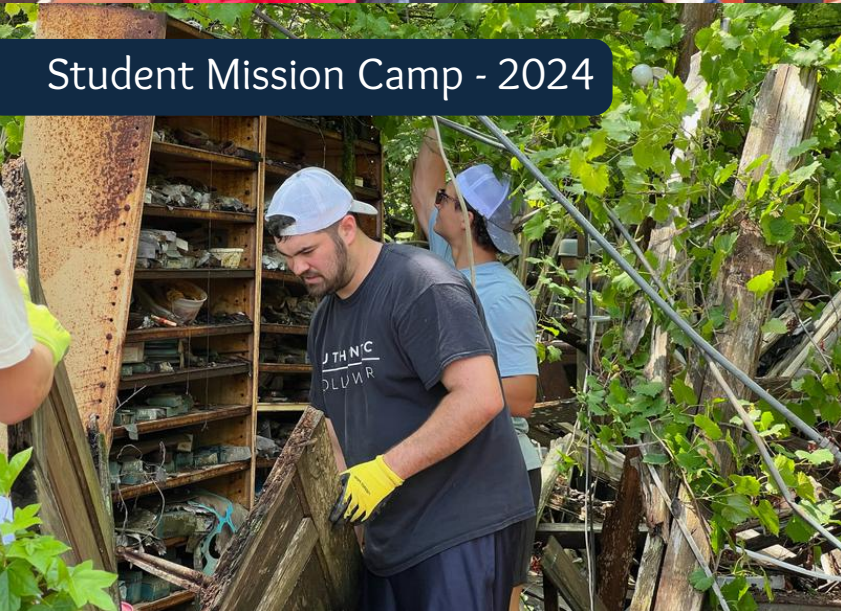
Student Mission Camp - 2024