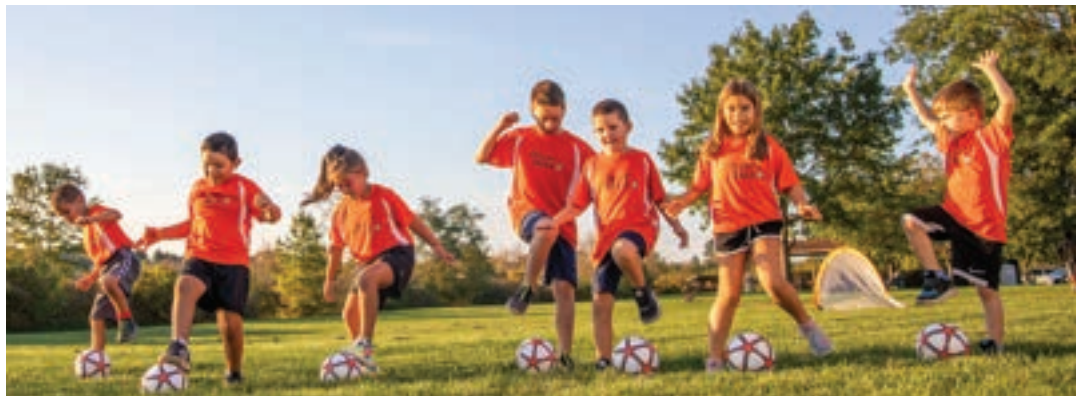
Volume 1 : Winter 2025

Mondays and Wednesdays 9:00 - 10:15 AM Mondays 5:30 - 6:45 PM